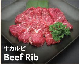
牛カルビ Beef Rib