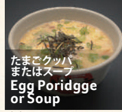
たまごクッパまたはスープ Egg Porridge or Soup