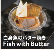
白身魚のバター焼き Fish with Butter