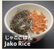
じゃこごはん Jakon Rice