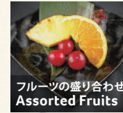
フルーツの盛り合わせ Assorted Fruits