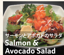
サーモンとアボカドのサラダ Salmon & Avocado Salad