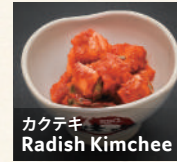
カクテキ Radish Kimchee