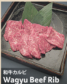
和牛カルビ Wagyu Beef Rib

*Cook lightly, then dip in lemon juice & chilli powder