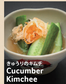
きゅうりのキムチ Cucumber Kimchee