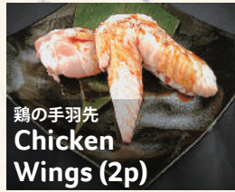
鶏の手羽先 Chicken Wings (2p)