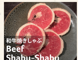
和牛焼きしゃぶ Beef Shabu-Shabu

*Cook lightly, then dip in lemon juice & chilli powder