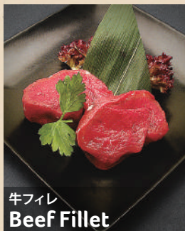
牛フィレ Beef Fillet