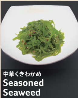
中華くわかめ Seasoned Seaweed