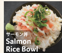
サーモン丼 Salmon Rice Bowl