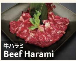
牛ハラミ Beef Harami