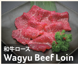
和牛ロース Wagyu Beef Loin