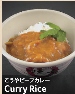
こうやビーフカレー Curry Rice