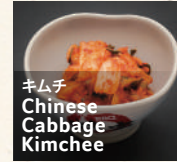
キムチ Chinese Cabbage Kimchee