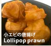
小エビの唐揚げ Lollipop prawn