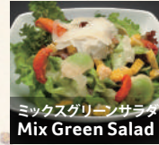
ミックスグリーンサラダ Mix Green Salad