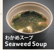
わかめスープ Seaweed Soup

*Tuna flake topped w/ mayonnaise on rice