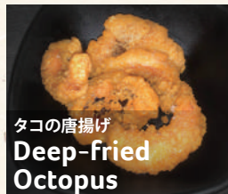
タコの唐揚げ Deep-fried Octopus