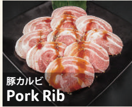
豚カルビ Pork Rib