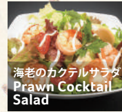
海老のカクテルサラダ Prawn Cocktail Salad