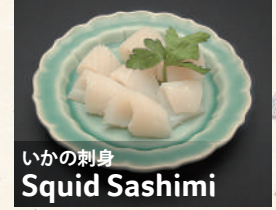
いかの刺身 Squid Sashimi