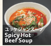
ユッケジャンスープ Spicy Hot Beef Soup