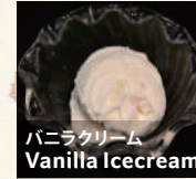
バニラクリーム Vanilla Icecream