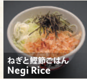
ねぎと鰹節ごはん Negi Rice