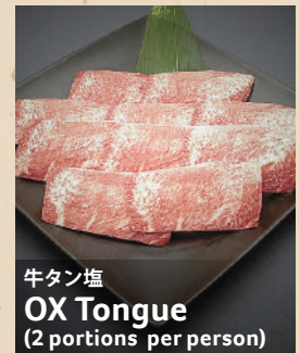
牛タン塩 OX Tongue (2 portions per person)

*Cook lightly, then dip in lemon juice & chilli powder