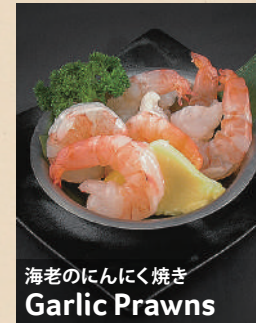
海老のにんにく焼き Garlic Prawns