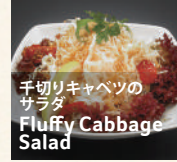
千切りキャベツのサラダ Fluffy Cabbage Salad