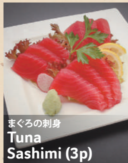
まぐろの刺身 Tuna Sashimi (3p)