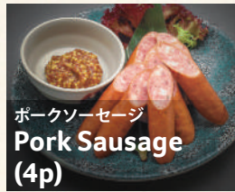
ポークソーセージ Pork Sausage (4p)