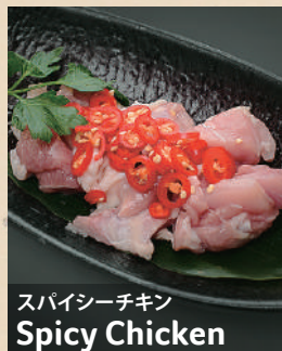
スパイシーチキン Spicy Chicken