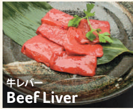
牛レバー Beef Liver