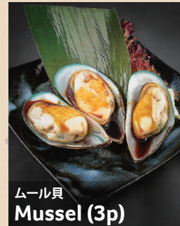
ムール貝 Mussel (3p)