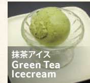
抹茶アイス Green Tea Icecream

*Baby bok choy & carrot, pickled radish & bean sprout, and shitake mushroom