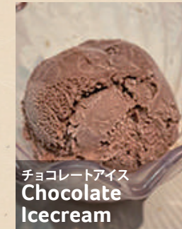
チョコレートアイス Chocolate Icecream