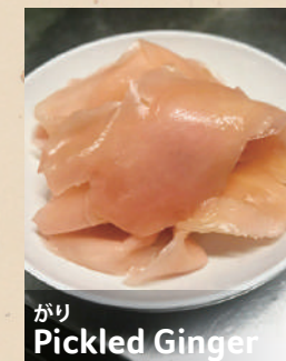
がり Pickled Ginger