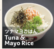
ツナマヨごはん Tuna & Mayo Rice

*Tuna flake topped w/ mayonnaise on rice