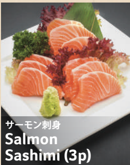
サーモン刺身 Salmon Sashimi (3p)