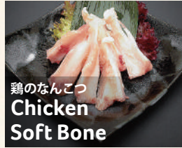
鶏のなんこつ Chicken Soft Bone