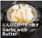
にんにくのバター焼き Garlic with Butter