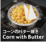
コーンのバター焼き Corn with Butter