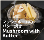
マッシュルームのバター焼き Mushroom with Butter