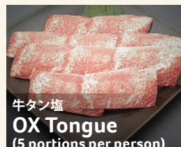
牛タン塩 OX Tongue (5 portions per person)

KOH-YA BUFFET + additional menu as follows + SPECIAL BUFFET