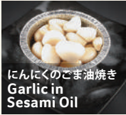
にんにくのごま油焼き Garlic in Sesami Oil