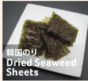
韓国のり Dried Seaweed Sheets