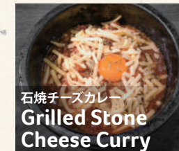
石焼チーズカレー Grilled Stone Cheese Curry