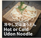
冷やし又は温うどん Hot or Cold Udon Noodle