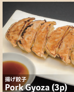
揚げ餃子 Pork Gyoza (3p)