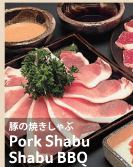
豚の焼きしゃぶ Pork Shabu Shabu BBQ