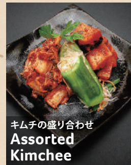
キムチの盛り合わせ Assorted Kimchee