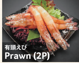
有頭えび Prawn (2P)