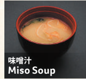
味噌汁 Miso Soup