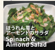
ほうれん草とアーモンドのサラダ Spinach & Almond Salad