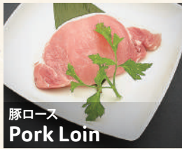
豚ロース Pork Loin