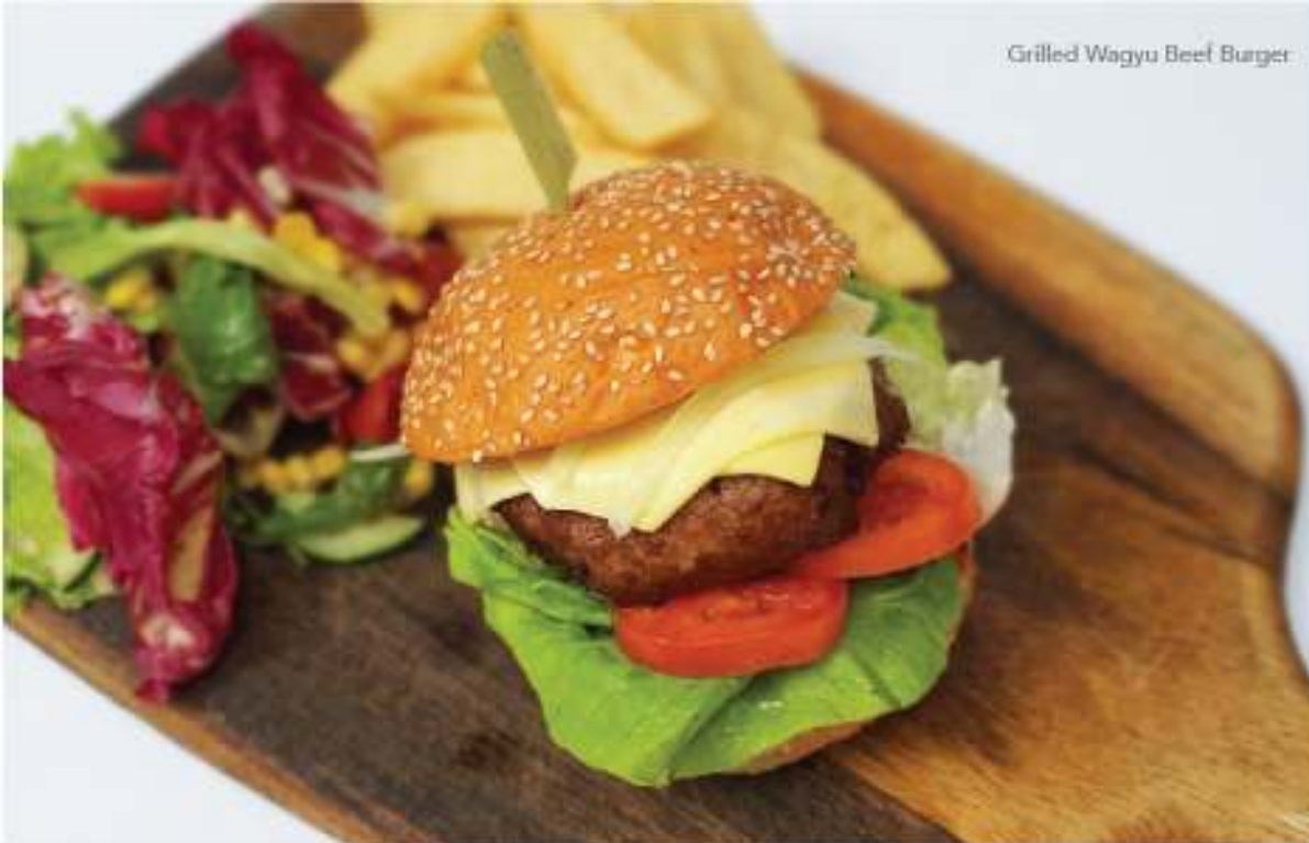
Grilled Wagyu Beef Burger