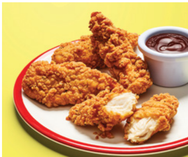
Southern Fried Chicken 6.19 Tender chicken strips with a BBQ sauce dip

Sticky Chicken Wings 6.19 Served with sour cream and coated in your choice of sauce Choose from BBQ | Nashville Hot