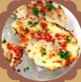
BAKED OYSTERS (spicy) 6 for $43.9 12 for $72.9