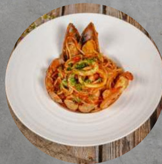
SEAFOOD MARINARA $18.9