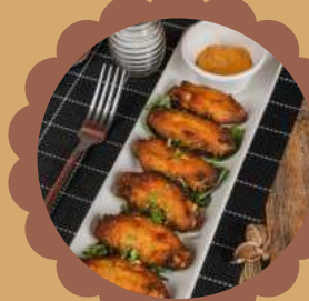
BUFFALO WINGS 6 for $9.9