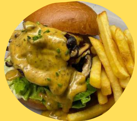
PORTOBELLO MUSHROOM BURGER (MEATLESS) $22.9