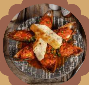
SPICY MUSSELS with bread 6 for $15.9