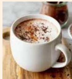
HOT CHOCOLATE $5.5