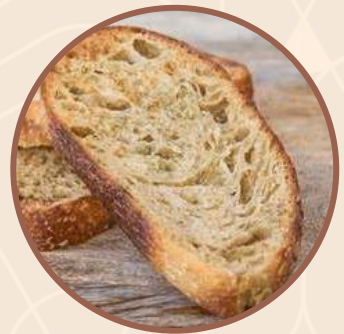
SOURDOUGH TOAST $2.9 / SLICE