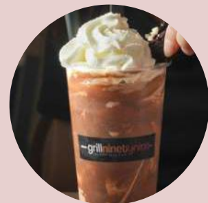
NUTELLA BROWNIE $12 (SERVED WITH MINI BROWNIE)