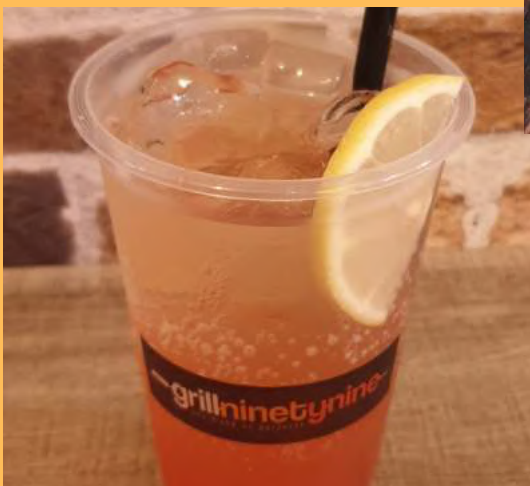
GRAPEFRUIT APPLE COOLER