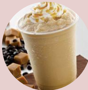
CARAMEL COFFEE FRAPPE $9.5 HAZELNUT COFFEE FRAPPE $9.5 VANILLA COFFEE FRAPPE $9.5