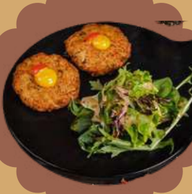
CRISPY CRABCAKE 2 for $13.9