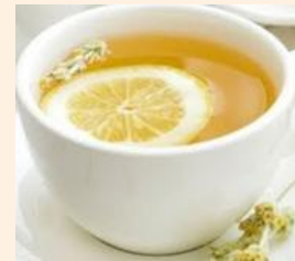
HOT HONEY LEMON (homemade) $5