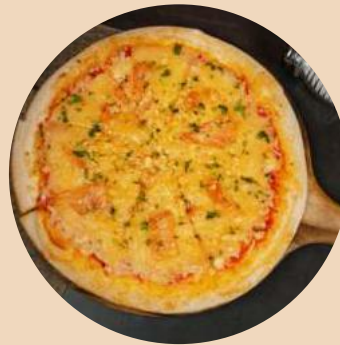
SMOKED SALMON $27