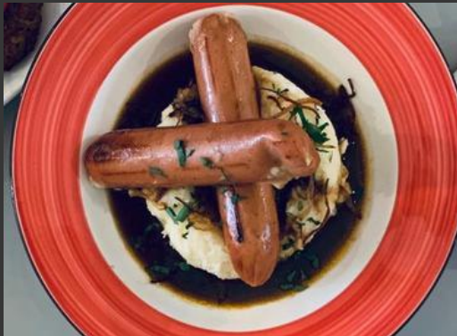
BANGERS & MASH $15.9