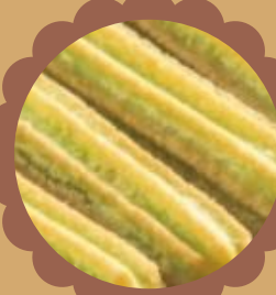
CHURROS PANDAN 5 for $10.9