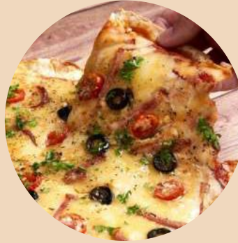
SMOKED DUCK $27