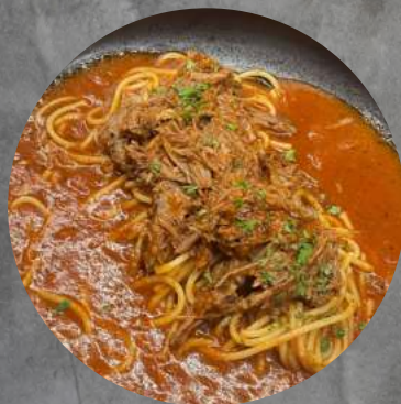
BEEF RAGU $18.9