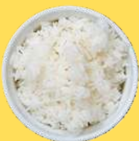
WHITE RICE $2