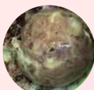
AFTER 8 (CHOC MINT)