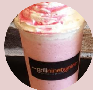
BUTTER BANDUNG $9