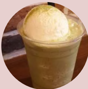
MATCHA LATTE FRAPPE $9.5 + VANILLA ICECREAM $2.5