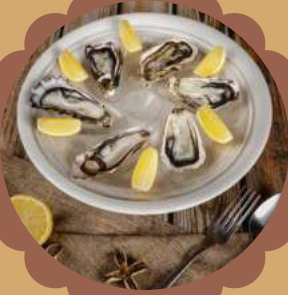
FRESH OYSTERS 6 for $33.9 12 for $62.9