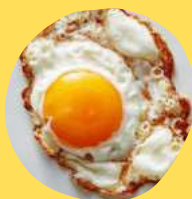
SUNNY SIDE UP $2