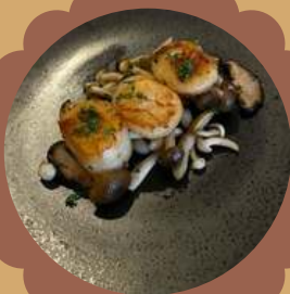
PAN SEARED SCALLOP 3 for $16.9