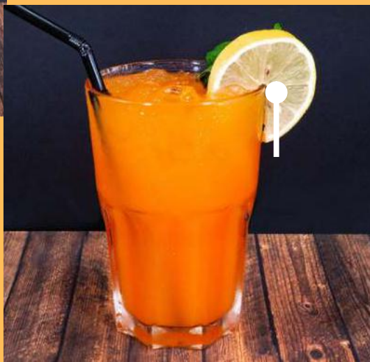
99 SUNSET (NON-FIZZY)