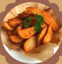
POTATO WEDGES $13.9