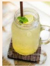
ICED HONEY LEMON (homemade) $6