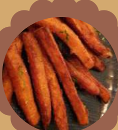
SWEET POTATO FRIES $13.9