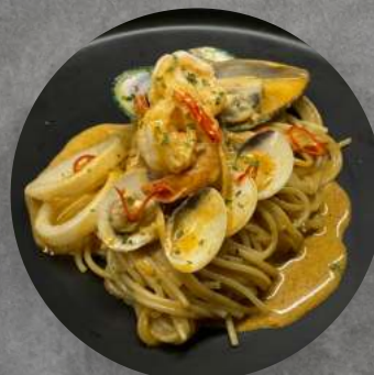
CREAMY SEAFOOD TOMYUM $18.9