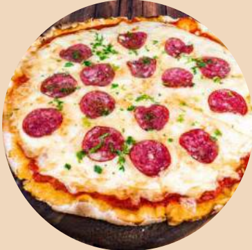
BEEF PEPPERONI $26