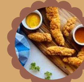
CHICKEN TENDERS 6 for $9.9