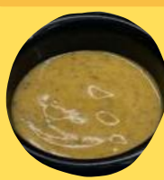
TRUFFLE CHEESE SAUCE $3