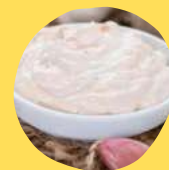
GARLIC AIOLI $3