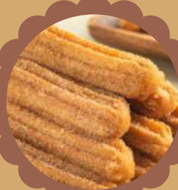
CHURROS ORIGINAL 5 for $9.9