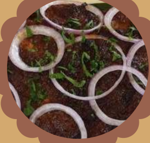
SAMBAL SEABASS APPETISER $15.9