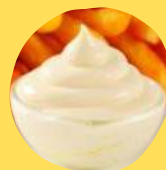
TRUFFLE MAYO $3