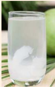
COCONUT WATER (BOTTLED) $5