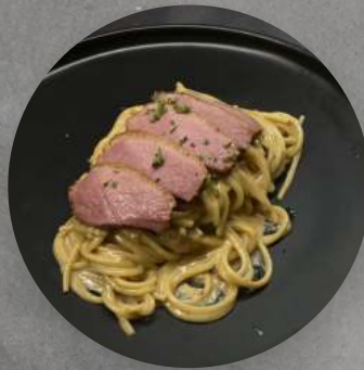
SMOKED DUCK PASTA $17.9