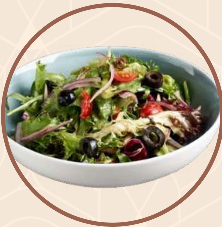
GARDEN SALAD $12.9