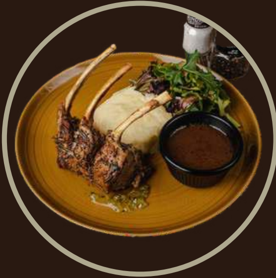
LAMB RACK (served with salad & mash) $36.9