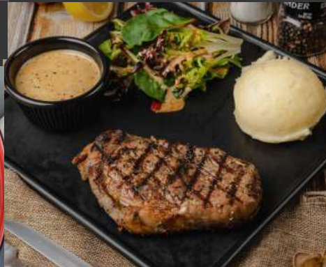
NEW YORK STRIP (300G) $28.9