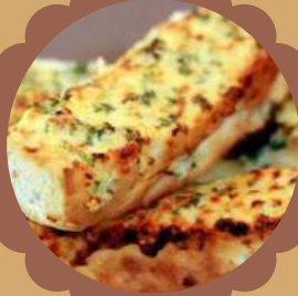
GARLIC BREAD 5 for $9.9