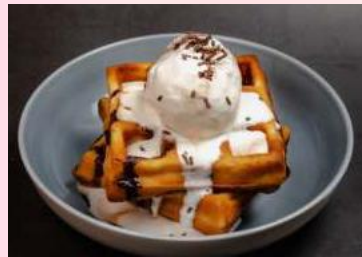
WAFFLE A LA CARTE $9 WAFFLE WITH 1 VANILLA ICECREAM $13.9