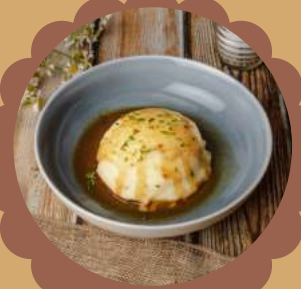
MASH POTATO with beefy brown sauce $5.5