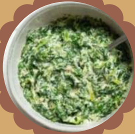
CREAMED SPINACH $13.9