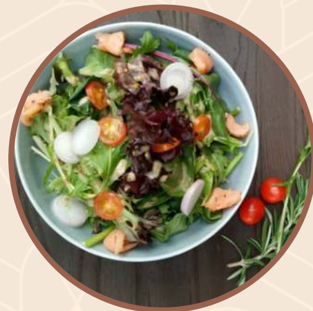
SMOKED SALMON SALAD $14.9

All salads are served with roasted sesame dressing