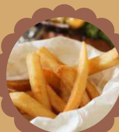
FRENCH FRIES $11.9