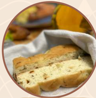
FOCCACCIA BREAD $1 / SLICE