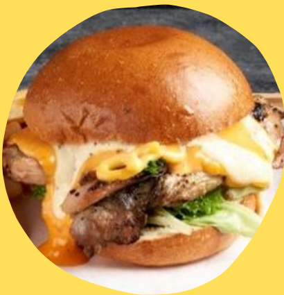
CHICKEN BURGER $23.9