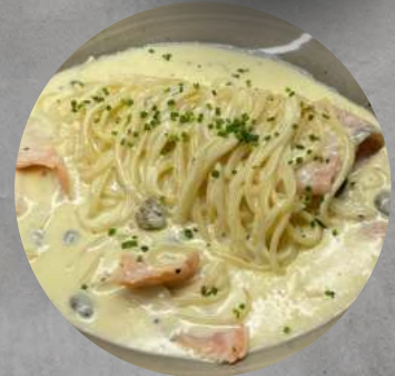
SMOKED SALMON PASTA $18.9