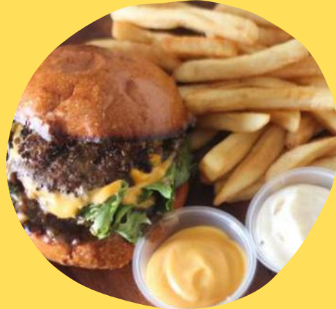
BEAST BURGER (double beef patty) $26.9