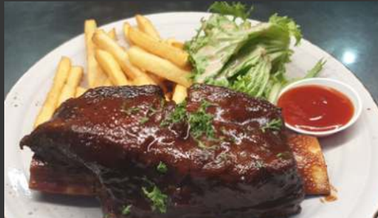
BEEF RIB $43.9