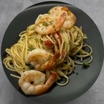
PRAWN AGLIO OLIO $16.9