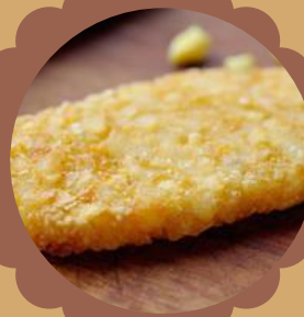
HASHBROWN $2.5 / PC