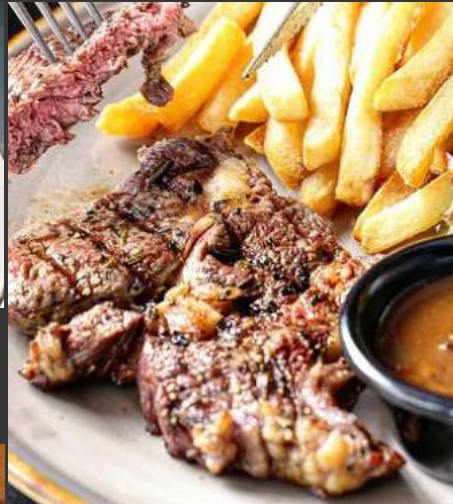
RIBEYE (200-250G) $34.9