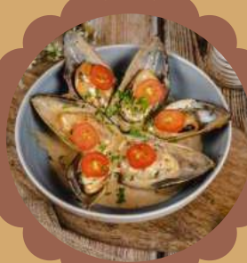
CREAMY MUSSELS with bread 6 for $15.9