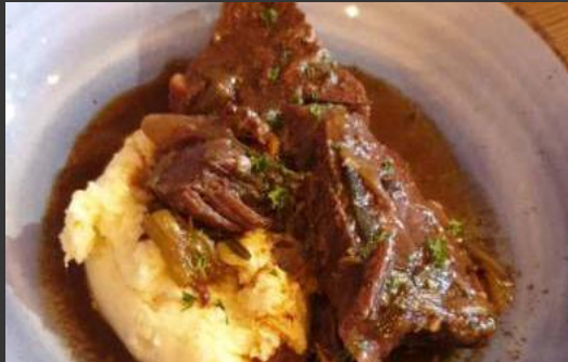
BEEF CHEEK $28.9