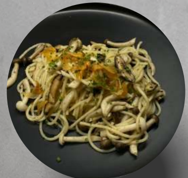
GARLIC MUSHROOM (VEGETARIAN) $15.9