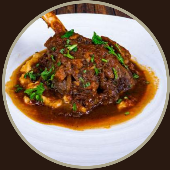
LAMB SHANK (served with mash) $28.9 + focaccia bread ($1 / slice) + sourdough bread ($2.9 per slice) + white rice ($2 per portion)