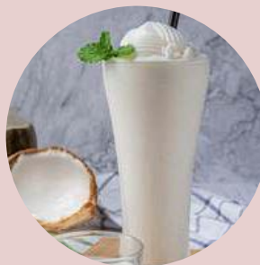
COCONUT SHAKE WITH COCONUT ICECREAM $10.9