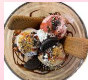
DIY SUNDAE $18.5 Pair any 3 gelatos with any 3 toppings. Complimentary biscuit and sauce included