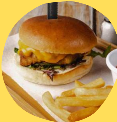
FISHERMAN'S BURGER $24.9