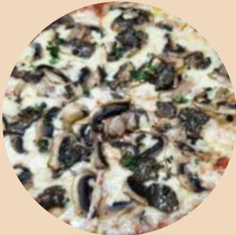
TRUFFLE MUSHROOM $28