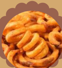
CURLY FRIES $13.9