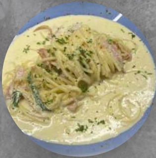
CHICKEN HAM CARBONARA $17.9