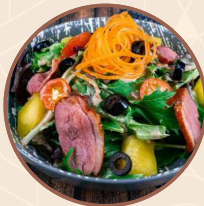
SMOKED DUCK SALAD $14.9