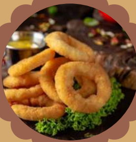
ONION RINGS $9.9