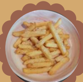
TRUFFLE FRIES WITH PARMESAN CHEESE $14.9