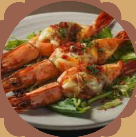
TIGER PRAWN THERMIDOR 3 for $16.9