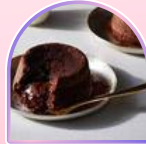
CHOCOLATE LAVA CAKE $6.5