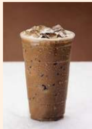
ICED CHOCOLATE $6