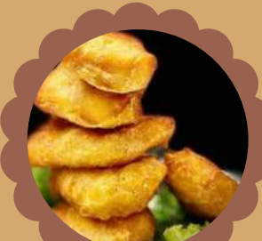
CHICKEN NUGGETS 6 for $7.9