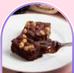
BROWNIE $7 + VANILLA ICECREAM 2.5