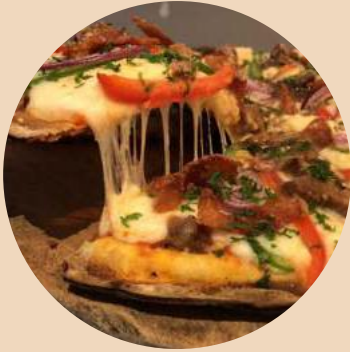
MEAT LOVER (BEEF) $27.00

12 INCH – HOMEMADE – THIN CRUST – CUT INTO 8