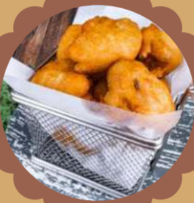
BATTERED MUSHROOMS $13.9