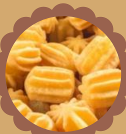
CHURROS BALL 25 for $9.9