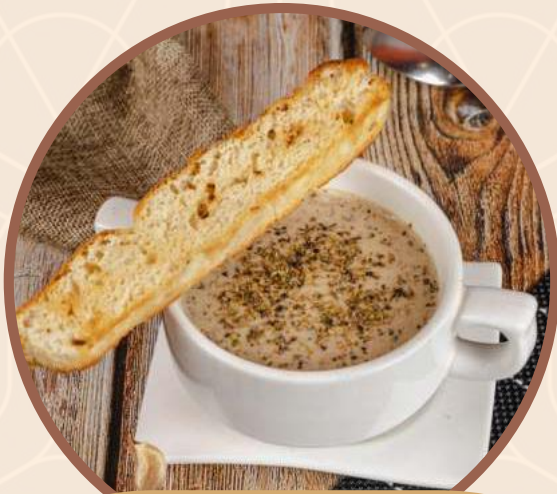
CREAM OF MUSHROOM WITH FOCCACCIA BREAD $8.50 + TRUFFLE OIL $2