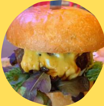
BEEF BURGER (single patty) $23.9

all burgers are served with french fries and truffle cheese sauce