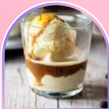
VANILLA AFFOGATO $9