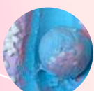
COTTON CANDY BUBBLEGUM