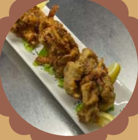
SOFT SHELL CRAB 2 pc for $16.9