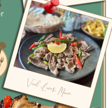
Veal Liver Main