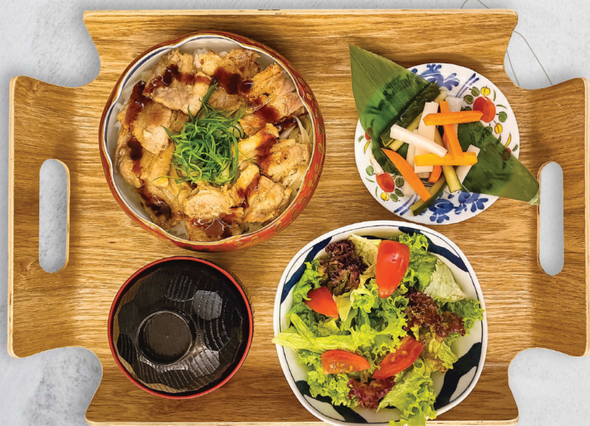
BUTA YAKI DON