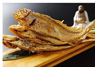
C049 香炸小黄花鱼 $23.80/条

Poached Sliced Fish Fillet in sze chuan Style