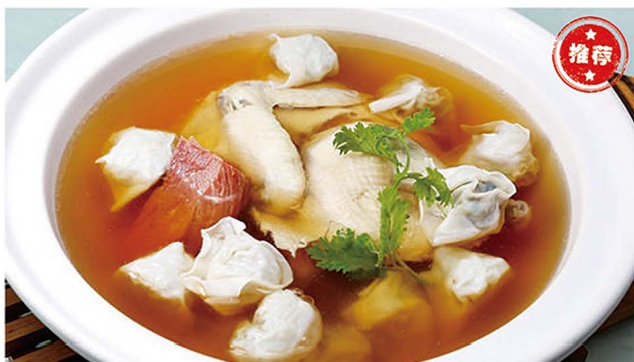
E001 云吞鸡汤 Small $28.80 Reg $49.80 Claypot Chicken Soup with Wonton and Ham

百年治春 百姓味道 CENTENNIAL YECHUN PEOPLE TASTE