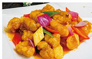
C028 糖醋鸡球 $14.80 Sweet & Sour Chicken