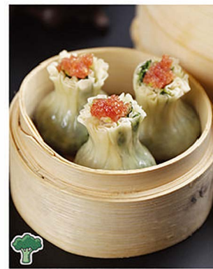
A012 翡翠烧卖 $5.80/3只 (PCS) "Shao Mai" Steamed Vegetable Dumpling