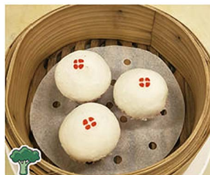
A010 莲蓉包 $4.80/3只 (PCS) Steamed Lotus Paste Bun