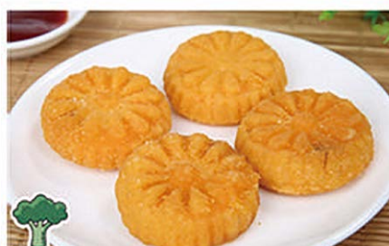
G005 南瓜饼 Pan Fried Pumpkin Pastry