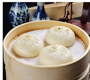
A004 鲜肉包 $5.80/3只 (PCS) Steamed Pork Bun