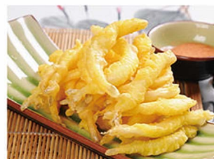
B009 椒盐白饭鱼 $9.80 Crispy Silver Fish with Garlic & Chilli