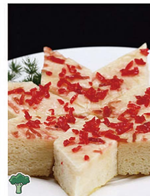
A023 千层油糕 $4.80/4只 (PCS) Steamed Multi-layer Cake