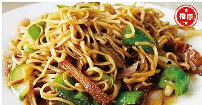
F013 扬州炒面 $11.80 (可素Vegetarian Option Available) Fried Noodle in Yang Zhou Style