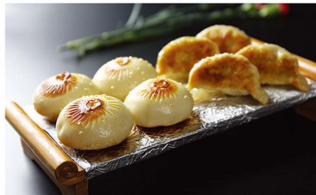
A021 治春双味 $16.80/8只 (PCS) Yechun Double Flavored Buns & Dumplings