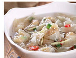
F011 虾籽馄饨 $8.80 Pork Wonton in Shrimp Roe Soup