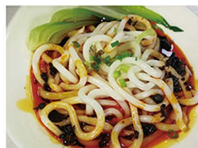
F019 四川抄手拉面 $11.80 Hot & Sour Hand Made Noodle in Sze Chuan Style with Wonton