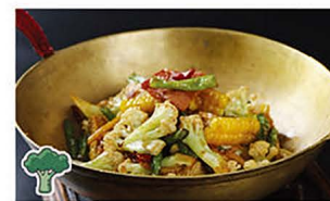
D008 干锅四季菜 $16.80 Wok Fried Four Season Vegetables