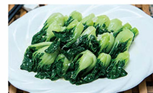
D011 蒜茸白菜苗 $14.80 Fried Baby Cabbage with Garlic