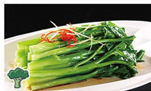
D002 白灼芥兰 $13.80 Poached Hong Kong Kai Lan