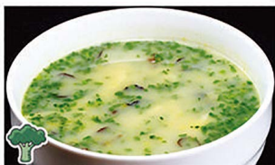
F004 菜泡饭 $10.00 Soup Rice with Vegetable & Mushroom