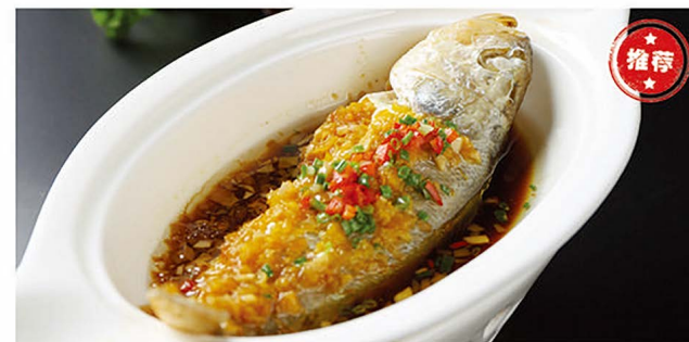
C046 酱椒/雪菜小黄花鱼 $23.80/1条 (PC)

Steamed Yellow Croaker fish with Green Pepper Sauce/Preserved Vegetable