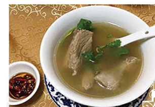
E008 肉骨茶 $9.80/位 (pax) Bah Kut Teh Pork Ribs Soup