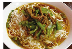
F020 青椒肉丝面 $11.80 Noodle with Shredded Pork Meat & Capsicum