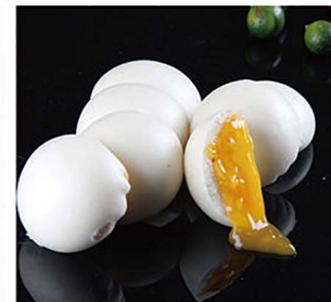
A014 奶黄流沙包 $5.80/3只 (PCS) Steamed Custard Bun