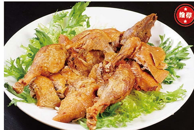
C026 香酥鸭 $26.80/半只(Half) $49.80/一只(Whole) Yechun Crispy Duck