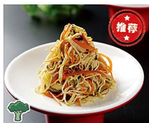
B019 什香小菜 $7.80 Shredded Mixed Vegetable with Sesame Oil