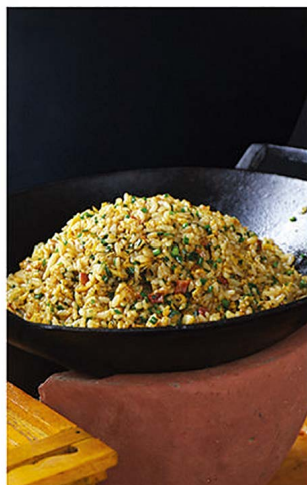
F003 特色风箱炒饭 $16.80 Fried Rice with Ham & Chives