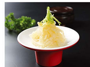
B011 葱油海蜇 $8.80 Cold Jelly Fish with Scallion Oil