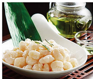
C016 清炒虾仁 $22.00 Sautéed Freshwater Shrimps