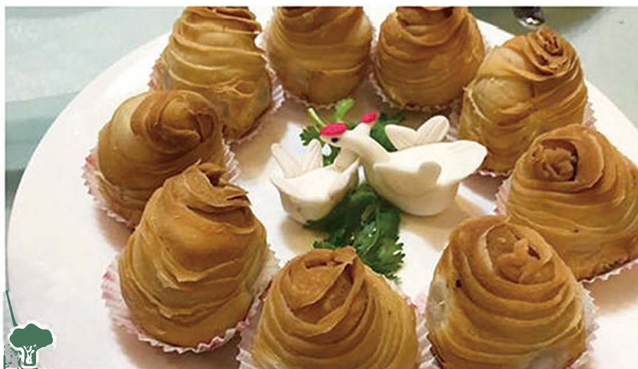
G008 冶春真心真芋香脆酥 YeChun True Love Yummy Crispy Pastry (4 只pcs)

$8.80(W/O Yolk) $10.00(with Yolk) ( 不包咸蛋黄 ) ( 包咸蛋黄 )