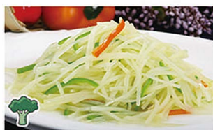
D003 青椒土豆丝 $9.80 Fried Copsisicum with Potato