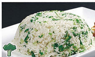
F002 素菜炒饭 $12.80 Vegetarian Fried Rice