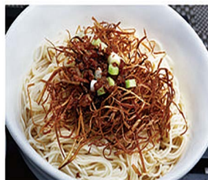
F018 葱油拌面 $10.80 Hand Made Noodle with Onion Oil