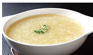
E002 蛋花粟米羹 $6.80/位 $19.80/煲 Boiled Sweet Corn Soup with Minced Egg