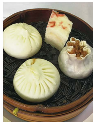
A020 什锦包 $8.80/5只 (PCS) Assorted Steamed Dumplings