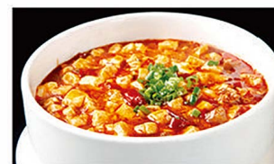
D012 麻婆豆腐 $12.80 Mopo Style Braised Tofu