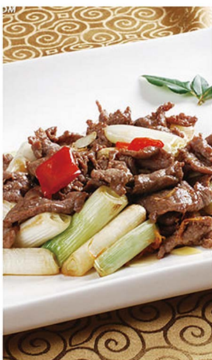
C022 京葱爆牛肉 $25.80 Sauteed Sliced Beef