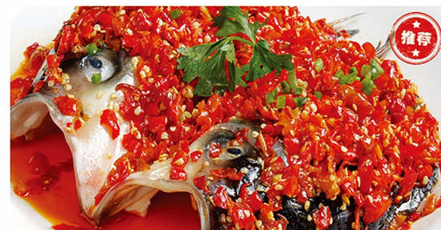
C047 剁椒鱼头 $26.80/半只 (Half) $49.80/一只 (Whole)

Steamed Yellow Croaker fish with Green Pepper Sauce/Preserved Vegetable