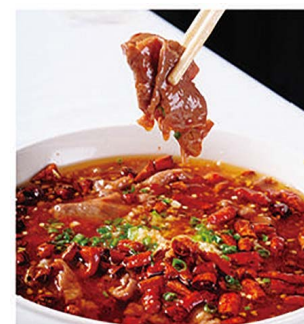
C021 水煮牛肉 $26.80 Poached Slice Beef in Sze Chuan Style