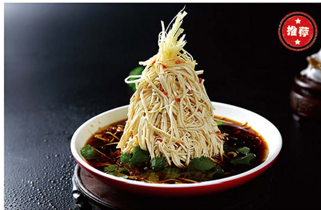
B020 冶春烫干丝 S $7.80 / M $12.00 / L $22.00 YeChun Braised Shredded Dried Tofu