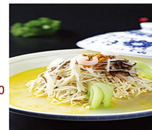
C006 大煮干丝 $23.80 Poached Beancurd Strips & Water Shrimp with Ham in Superior Soup