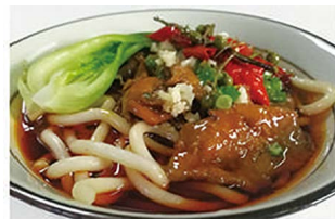
F014 水煮牛肉面 $14.80 Hand Made Noodle with Sliced Poached Beef in Sze Chuan Style