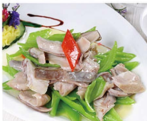
C008 青椒炒肚片 $19.80 Pork Stomach Slices Fried with Green Capsicum