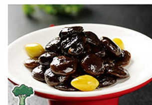
B015 银杏香菇 $7.80 Sauteed Gingko & Chinese Mushroom