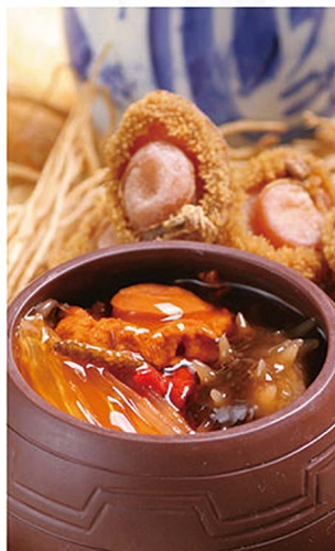
C031 佛跳墙 $88.00/位 Double Boiled Buddha Jump Over the Wall Soup