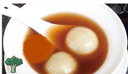
G001 姜茶汤圆(2只) Sesame-filled Glutinous Rice Balls (2pcs) in Ginger Soup

$8.80(W/O Yolk) $10.00(with Yolk) ( 不包咸蛋黄 ) ( 包咸蛋黄 )