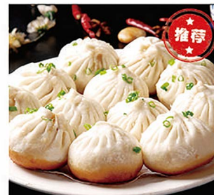
A008 生煎包 $6.80/3只 (PCS) Pan Fried Pork Bun