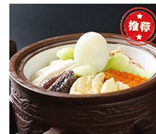
C002 精品全家福 $198.00 Pen Chai (Sharks' Fin, Abalone, Sea Cucumber, Dried scallops, etc.) Subject to Pre-ordering