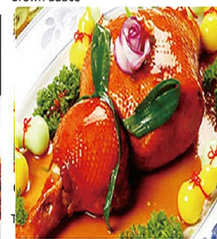
C020 八宝葫芦鸭 $68.00 8 treasure duck Subject to pre-ordering