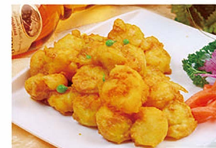
C037 黄金虾球 $23.80 Sauteed Water Shrimp with Salted Egg Yolk