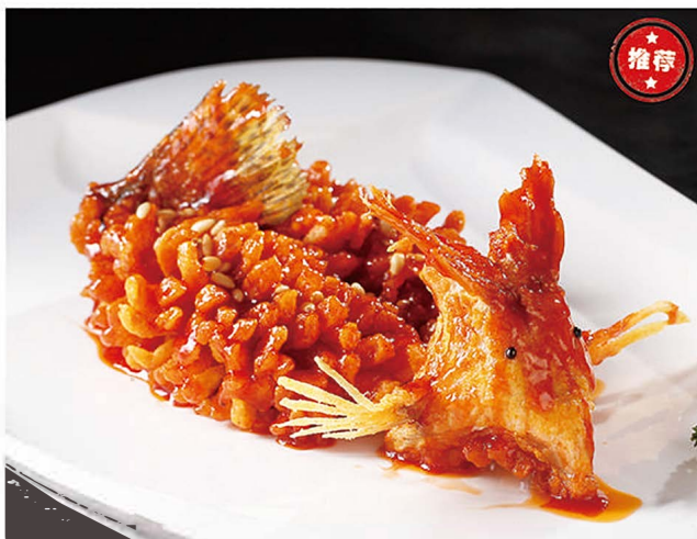
C042A 松籽笋壳鱼 $10.80/100g

Deep Fried Soon Hock Fish with Pine Nuts in Sweet & Sour Sauce