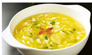
D005 平桥豆腐 $13.80 Braised Tofu with Ham