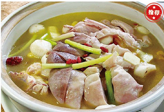
C024 滋补肚煲鸡 Small $28.80 Reg $46.80 Pax $10.80 Claypot Chicken and Pig Stomach Stew