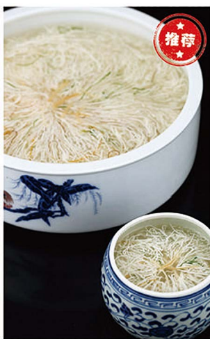
E003 文思豆腐 $8.80/位 $26.80/煲 Braised Silky Beancurd Soup with Ham