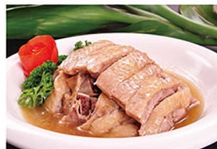
B006 特色盐水鸭 $9.80 Marinated Salted Duck