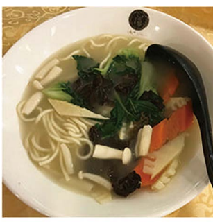
F009A 三鲜素拉面 $11.80 Vegetarain Noodle