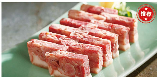
B001 冶春肴肉 $9.80 Yechun Spiced Pork