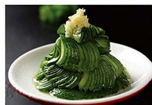
B014 蓑衣黄瓜 $7.80 Sliced Cucumber with Sesame Oil & Sauce