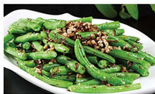
D001 干煸四季豆 $13.80 Fried Spring Bean with Minced Pork & Chilli Sauce