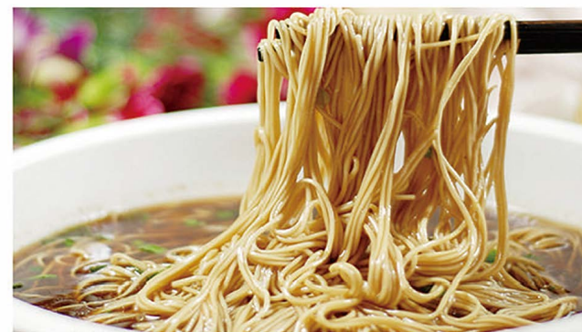
F006 阳春面 $8.80 Yang Chun Noodle