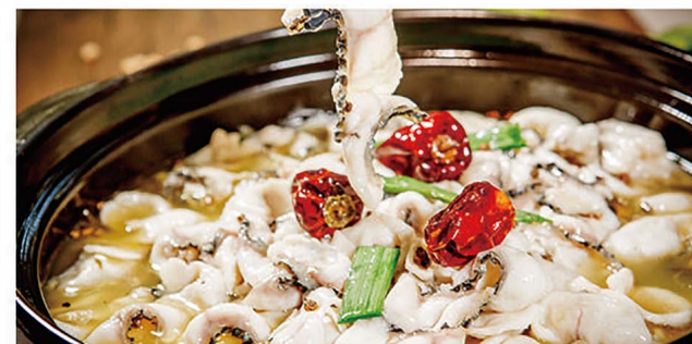
C045 酸菜鱼片 $26.80

Steamed Fish Head with Chilli Sze Chuan Style