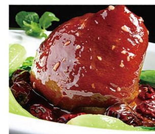
C019 东坡元蹄 $33.80 Braised Pig Trotter with Vegetables in Brown Sauce