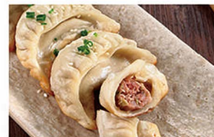
A009 鲜肉锅贴 $6.80/3只 (PCS) Pan Fried Pork Dumpling