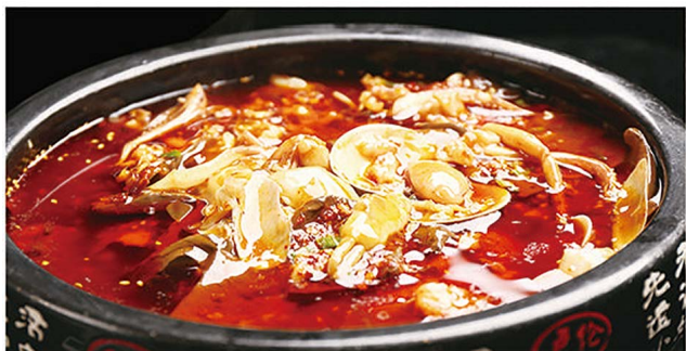
C013 水煮三国 $29.80 Poached Sliced Beef & Prawn in Sze Chuan Style