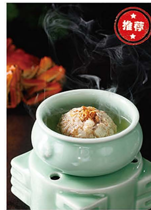
C001 狮子头 $9.80/只 Double Boiled Minced Pork Ball Soup