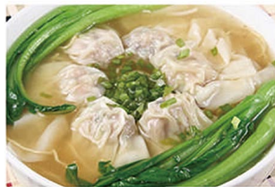
F012 菜肉云吞面 $11.80 Hand Made Noodle with Pork & Vegetable Dumpling