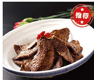
C015 韭香脆肝 $18.80 Sautéed Pig Liver with Chinese Chives