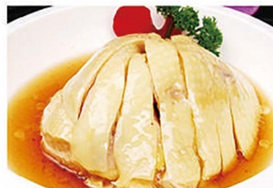
B008 李白醉鸡 $8.80 Hua Tiao Drunken Chicken