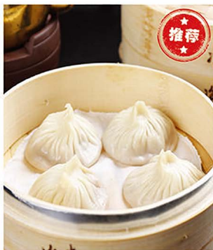
A007 小笼汤包 $5.80/4只 (PCS) Xiao Long Bao Steamed Pork Dumpling