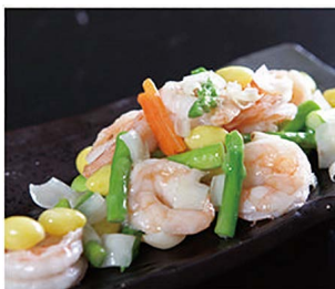
C009 芦笋百合炒虾仁 $26.80 Fried Freshwater Shrimps Served with Asparagus and Fresh Lily Bulb