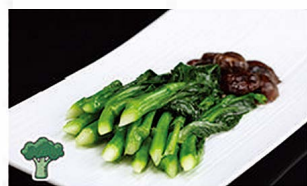
D004 香菇菜心 $13.80 Stir Fried Choy Sum with Mushrooms