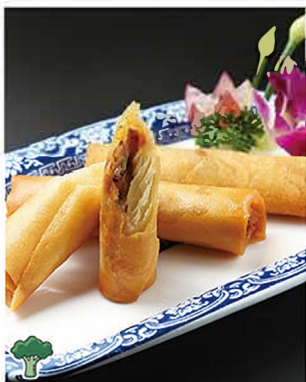
A018 四季春卷 $4.80/3只 (PCS) Deep Fried Spring Roll

Deep Fried Sesame Pastry Stuffed With Turnip Strips