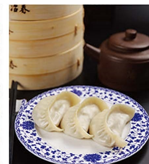
A003 治春蒸饺 $5.80 /3只 (PCS)