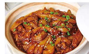
D009 鱼香茄煲 $14.80 Stewed Egg Plant with Minced Pork & Chilli Sauce