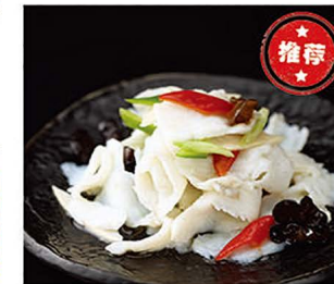
C004 滑炒玉兰片 $20.00 Sauteed Fish Fillet