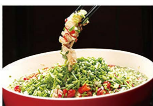
B005 口味椒麻水鸡 $9.80 Steamed Chicken with Chilli, Peanut and Sesame Sauce in sze chuan Style