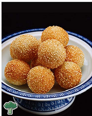
A016 传统麻团 $4.80/3只 (PCS) Deep Fried Glutinous Rice Balls Coated With White Sesame