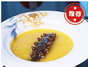
C035 小米海参 $46.80/位 Braised Sea Cucumber and Millet Grains in Superior Broth