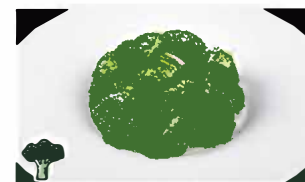
D013 清炒西兰花 $14.80 Stir Fried Broccoli