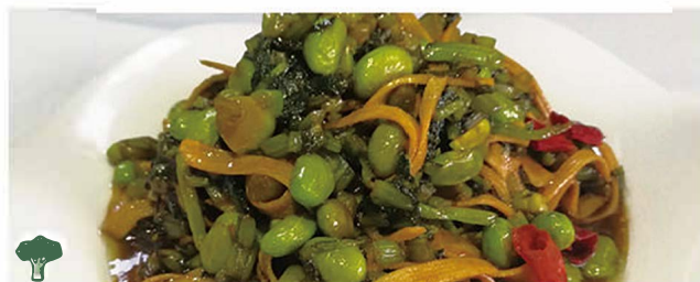
D007 毛豆雪菜百叶 $14.80 Fried Beancurd Strips with Green Soy Bean and Preserved Vegetables