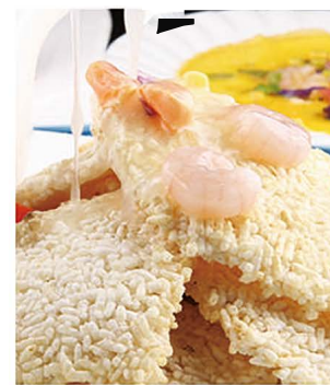
C007 天下第一响 (海鲜或酸甜汁) Braised Rice Crust with Seafood Sauce or Sweet and Sour Sauce $16.80