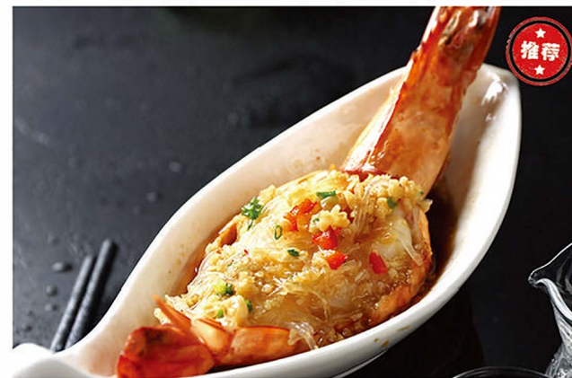
C039 蒜蓉大虾 $11.80/位(Pax) Sauteed Big Prawn With Garlic