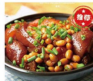
C018 黄豆焖猪手 $23.80 Braised Pork Leg with Yellow Beans