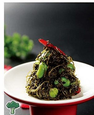
B012 雪菜豆米 $7.80 Fried Green Soy Bean with Preserved Vegetable Xue Cai