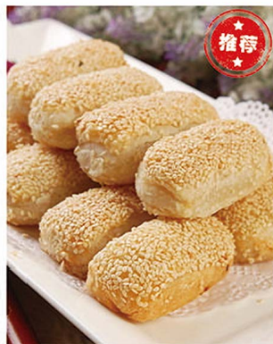
A017 黄桥烧饼 $6.80/3只 (PCS) Deep Fried Sesame Pastry Stuffed With Chicken Floss and Spring Onion