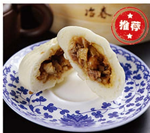
A006 三丁大包 $2.60/只 (PC) Steamed Bun With Diced Chicken, mushroom & Bamboo Shoots Steamed bun with diced chicken, pork & bamboo shoots