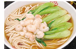
F009 虾仁煨面 $11.80 Stewed Noodle in Soup with Freshwater Shrimp