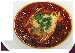
F016 担担面 $11.80 Dan Dan Noodle