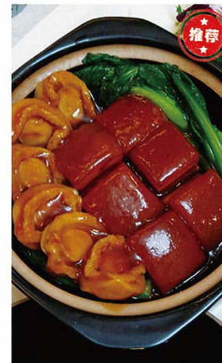
C030 鲍鱼东坡肉 $39.80 Stewed abalone & Pork Belly