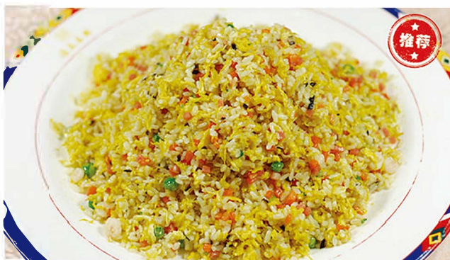
F001 正宗扬州炒饭 Small $8.80 Reg $16.80 Yang Zhou Style Fried Rice