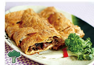
B021 香煎素鹅 $9.80 Crispy Beancurd Skin Roll stuffed with mushroom