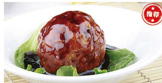
C017 红烧狮子头 $22.80/2只 (PCS) Braised Minced Pork Ball with Chinese Cabbage