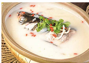
C043 砂锅鱼头汤 $26.80

Deep Fried Seabass with Pine Nuts in Sweet and Sour Sauce