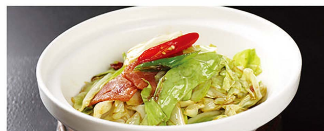
D014 手撕包菜 $16.80 Hand-Shredded Cabbage with Bacon