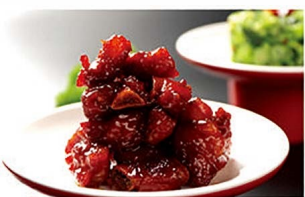
B002 糖醋小排 $9.80 Braised Pork Rib With Special Home-made Sauce