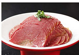
B003 酱香牛肉 $9.80 Yechun Marinated Sliced Beef