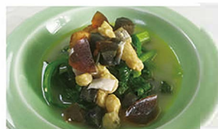
D006 三蛋时蔬 (上汤) $14.80 Poached Seasonal Vegetable with Assorted Eggs