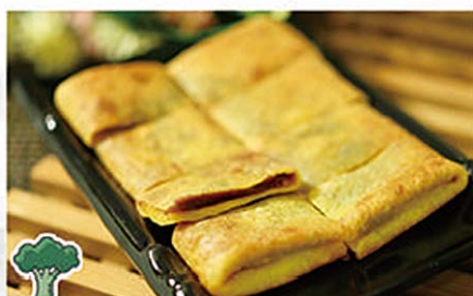
G006 豆沙锅饼 Pan Fried Red Bean Pancake