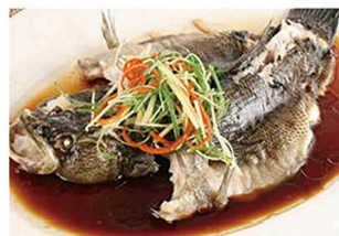
C044 清蒸笋壳鱼 $10.80/100g

Steamed Soon Hock Fish (Marble Goby Fish)