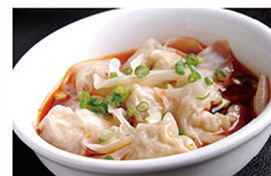
F010 红油抄手 $9.80 Wonton with Hot Spicy Sauce