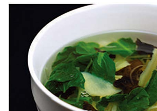
E007 榨菜肉丝汤 $8.80 Shredded Pork with Pickled Vegetable Soup