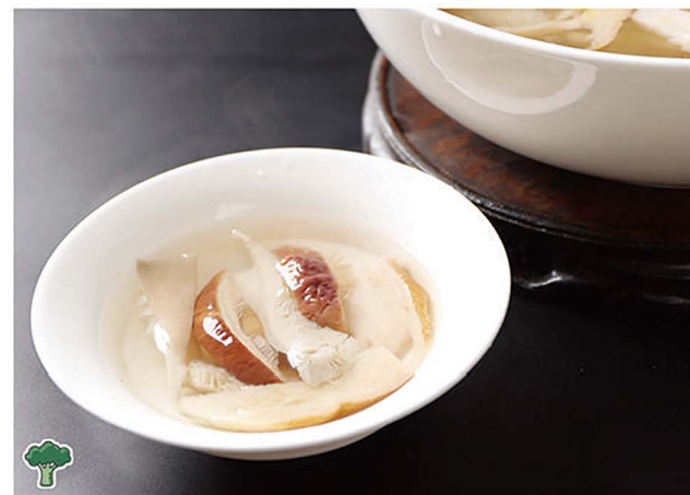
E005 菌菇汤 $6.80/位 $19.80/煲 Fresh Mushroom Soup