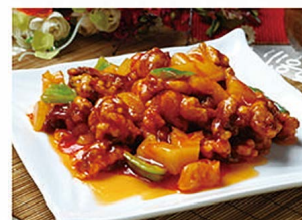
C027 菠萝咕嚕肉 $14.80 Sweet & Sour Pork