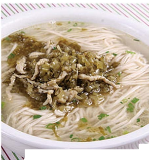
F021 雪菜肉丝面 $11.80 Noodles Served with Shredded Pork & Preserved Vegetable