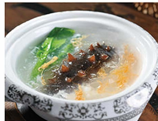
C034 辽参三宝盅 $48.00/位 Double Boiled Sea Cucumber Soup with Dried Scallop and Cordyceps Flower