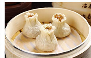
A011 松籽烧卖 $5.80/3只 (PCS) "Shao Mai" Steamed Dumpling With Glutinous Rice and Pine Nuts