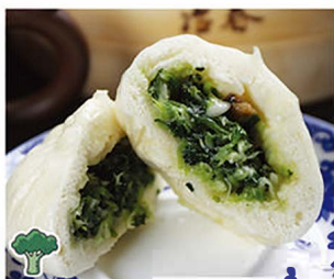
A005 香菇菜包 $5.80/3只 (PCS) Steamed Bun Stuffed With Mushroom and Green Vegetables