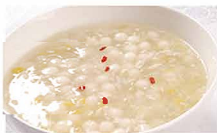
G002 酒酿丸子 Glutinous Rice Balls with Sweet Fermented Rice Wine