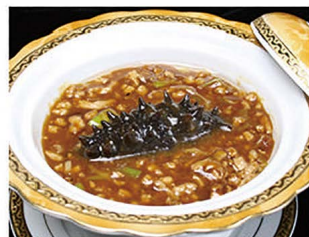
C033 肉末辽参 $39.80/位 Braised Sea Cucumber with Minced Pork