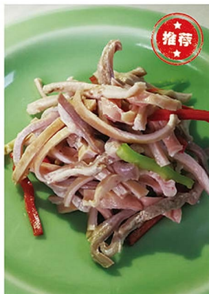
B018 特色拌肚丝 $9.80 Braised Pig Stomach with Onion and Leeks