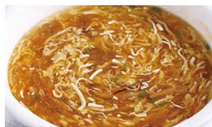
E004 传统酸辣汤 $7.80/位 $23.80/煲 Hot and Sour Soup Size Chuan Style