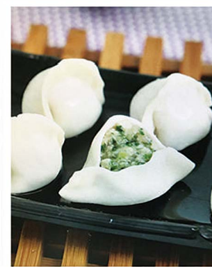
A028 北京水饺 $8.80/6只 (PCS) Bei Jing Style Dumplings