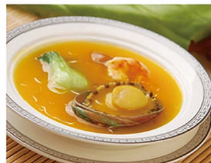
C032 鲍鱼三宝盅 $38.00/位 Double Boiled Abalone Soup with Dry Scallop & Cordyceps Flower