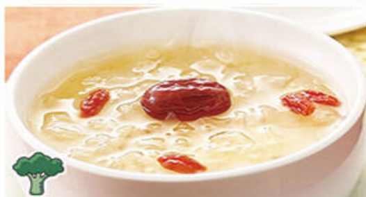
G004 银耳炖红枣 White Fungus Soup with Red Dates