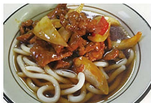
F015 葱爆牛肉面 $14.80 Hand Made Noodle with Sliced Beef & Scallion