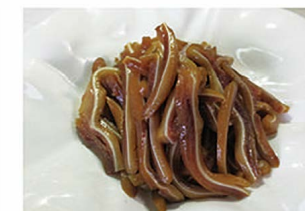
B013 香葱拌猪耳 $8.80 Marinated Braised Pig Ear with Sesame Oil