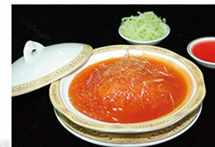
C041 红烧鱼翅 $49.80/位 Braised Shark's Fin Soup with Shredded Crabmeat