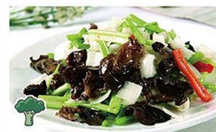
D010 香芹木耳 $14.80 Fried Chinese Celery with Black Fungus