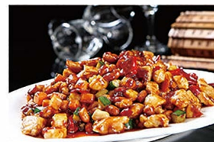
C029 宫保鸡丁 $14.80 Sauteed Diced Chicken with Diced Chilli & Cashew Nut