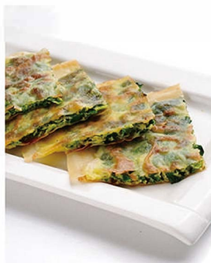
A019 韭菜煎饼 $6.80 Pan Fried Chinese Chives Minced Pork Pancake