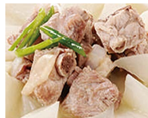
E006 萝卜排骨汤 $8.80/位 $26.80/煲 Pork Rib Soup with White Radish