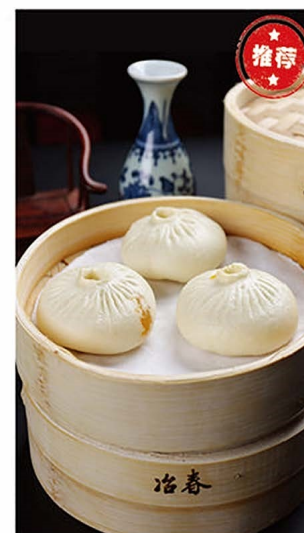
A002A 蟹肉包 $8.80 /3只 (PCS)