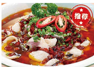
C048 水煮鱼片 $26.80

Steamed Soon Hock Fish (Marble Goby Fish)