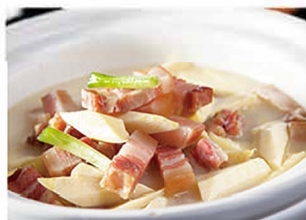
C025 风味腌笃鲜 $28.00 Double Boiled Salted Pork Soup with Bamboo Shoots & Ham