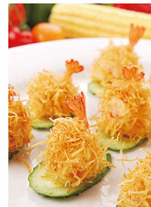
C038 富贵虾球 $23.80 Deep Fried Prawn with Mayonnaise Dressing