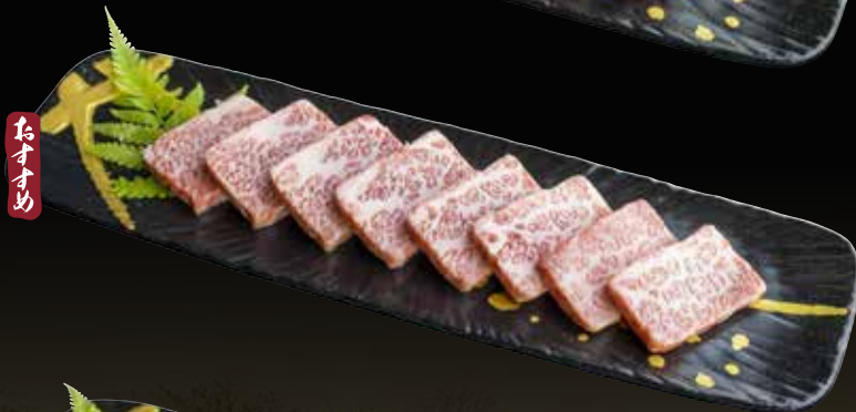
Miyazaki Ribeye A4 (100g) 宮崎牛リブロース $68.8