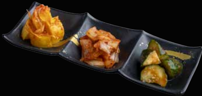
Kimuchi Moriawase キムチ盛り合わせ $11.9