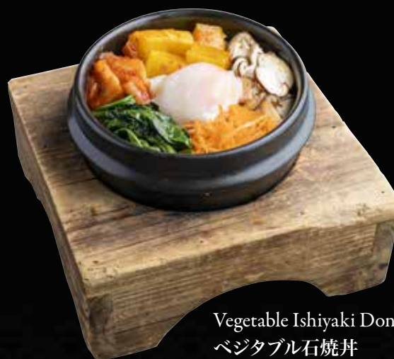
Vegetable Ishiyaki Don ベジタブル石焼き丼 $12.9