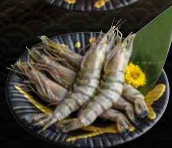
Tiger Prawn (5pcs) タイガーエビ $16.8