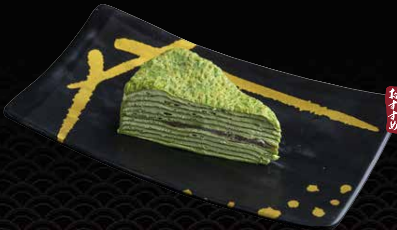
Matcha Cheesecake 抹茶チーズケーキ $12.9