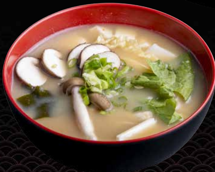
Miso Soup みそ汁 $5.9