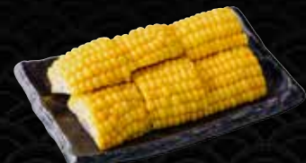
Sweet Corn とうもろこし $5.9