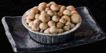
Shimeji Mushroom シメジ $7.9