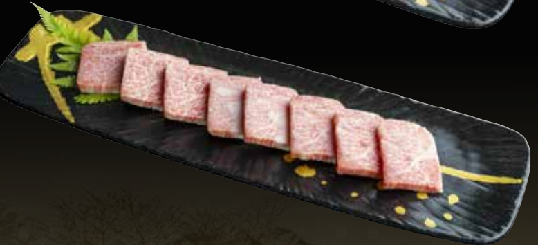
Kagoshima Short Plate A4 (100g) 鹿児島牛ともバラ $58.8