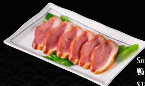
Smoked Duck (100g) 鴨肉 $18.8