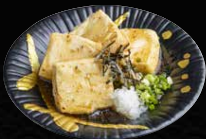
Agedashi Tofu 揚げ出し豆腐 $14.9