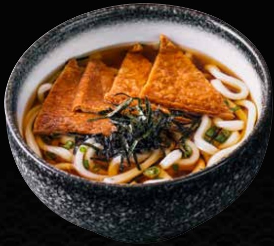
Inari Udon いなりうどん $16.9