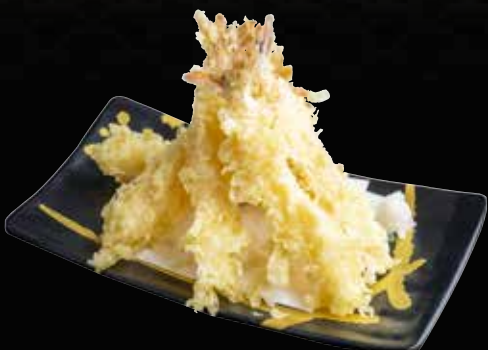
Nobashi Ebi Tempura 海老天ぷら $18.9