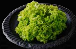
San Chu サンチュ