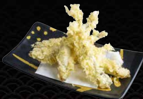
Shishamo ししゃも天ぷら $9.9