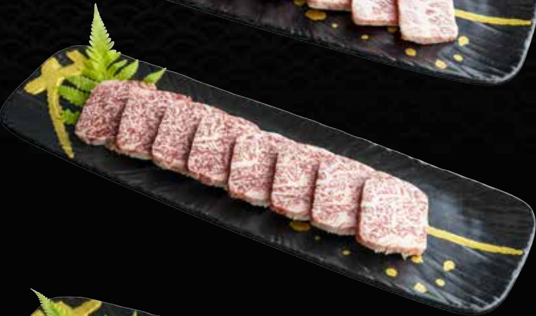
Kagoshima Flap Meat A4 (100g) 鹿児島牛フラップ肉 $58.8