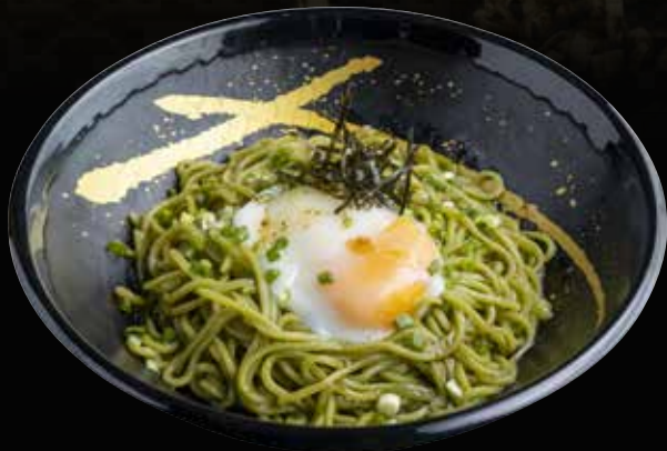
Truffle Cold Chasoba トリュフそば $16.9