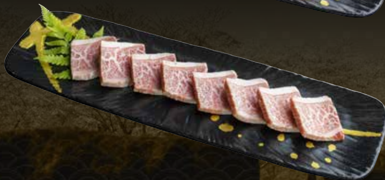
Miyazaki Chuck Short Ribs A4 (100g) 宮崎牛カタサンカク $68.8