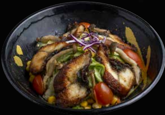
Una-Una Tempura Salad うなうな天ぷらサラダ $18.9