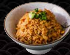
Garlic Fried Rice にんにくチャーハン

Images are for illustration purpose only. Actual product may vary. Prices are exclusive of 10% service charge and 7% GST.