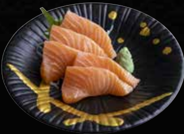
Sake (Salmon) 鮭 $12.9