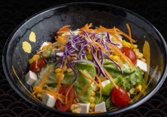
Truffle Wafu Salad トリュフ和風サラダ $11.9