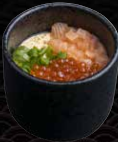
Chawanmushi 茶碗蒸し $5.9