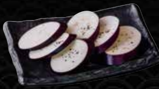
Eggplant なす $4.9