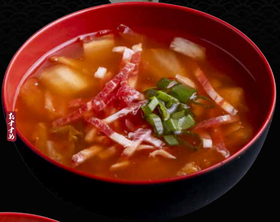
Wagyu Beef Kimuchi Soup 和牛キムチ汁 $12.9