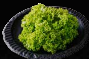
San Chu サンチュ