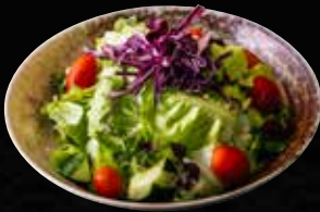
House Salad サラダ