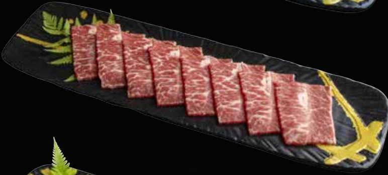
Australian Wagyu Oysterblade MS 6/7 (100g) 和牛オイスターブレード $46.8