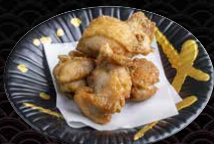
Tori Karaage 鶏からあげ $8.9