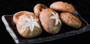
Shiitake Mushroom 椎茸 $7.9