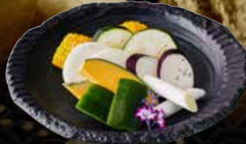
Vegetable Platter 野菜盛合せ $11.9