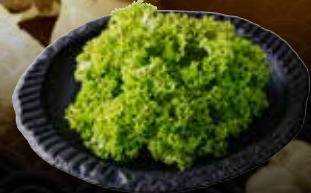
Sanchu サンチュ $5.9