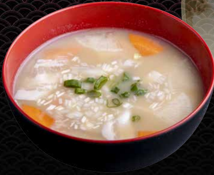
Ton Jiru Soup 豚汁 $12.9