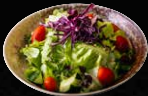
House Salad サラダ