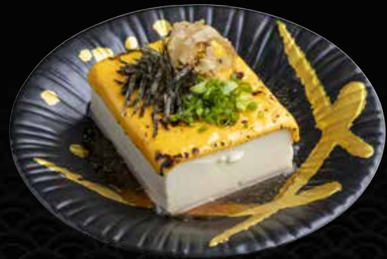
Aburi Cheese Tofu あぶりチーズ豆腐 $11.9