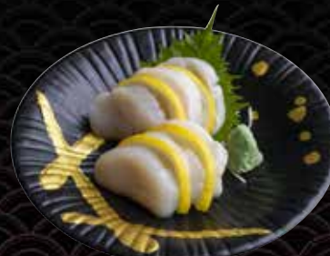
Hotate (Scallop) 帆立 $28.9