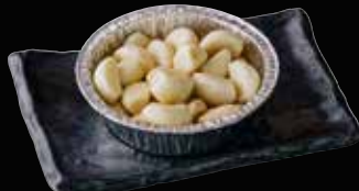
Garlic with Butter ニンニク $5.9