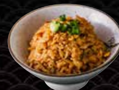
Garlic Fried Rice にんにくチャーハン

Images are for illustration purpose only. Actual product may vary. Prices are exclusive of 10% service charge and 7% GST.