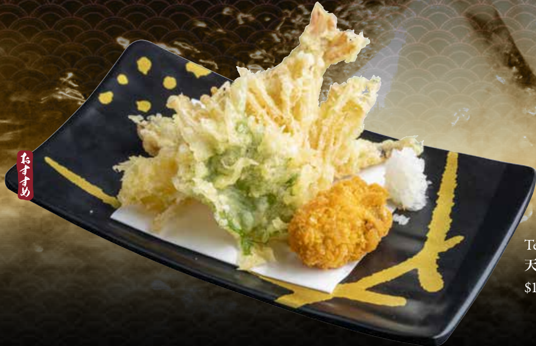
Tempura Moriawase 天ぷら盛り合わせ $18.9