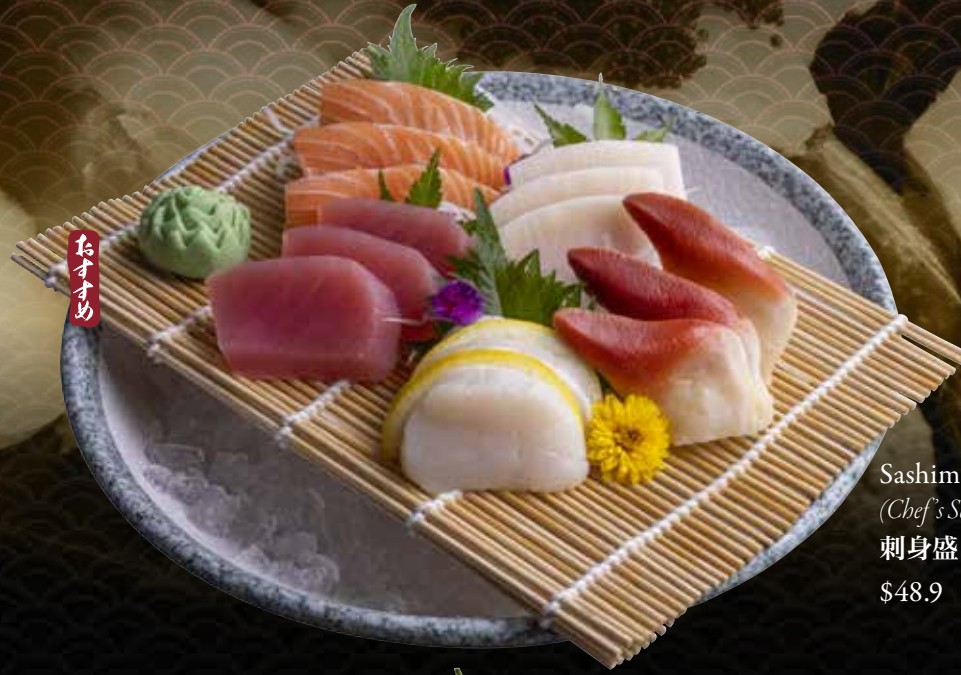
Sashimi Moriawase (Chef's Selection) 刺身盛り合わせ $48.9