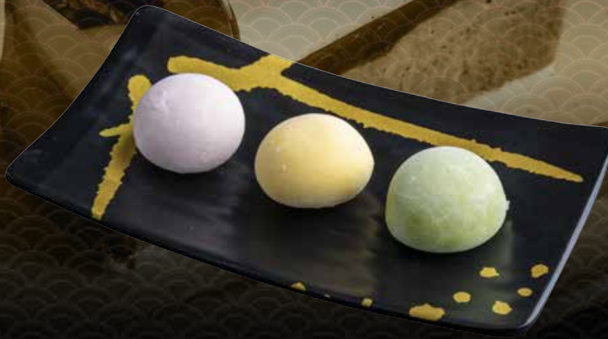
Daifuku (Mango, Matcha, Strawberry) 大福 (マンゴー、抹茶、イチゴ) $12.9