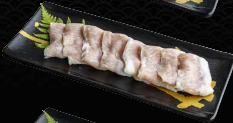
Kurobuta Pork Jowl (100g) 黒豚のあご $26.8