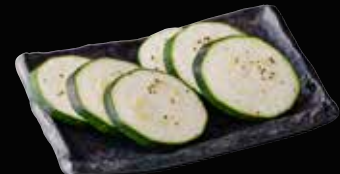
Zucchini ズッキーナ $5.9