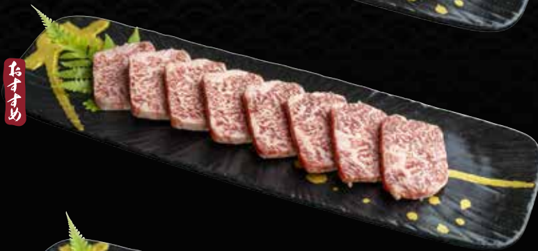
Tochigi Ribeye A5 (100g) 栃木牛リブロース $88.8