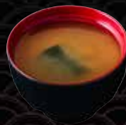
Miso Soup みそ汁