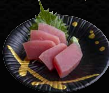
Maguro (Tuna) マグロ $12.9