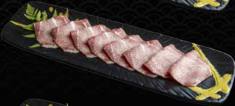
Australian Wagyu Tongue (100g) 和牛タン $46.8