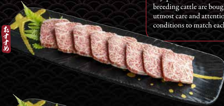
Saga Striploin A5 (100g) 佐賀牛ストリップロイン $88.8

The special type of Wagyu produced in Saga Prefecture is known exclusively as Saga-Gyu. Saga-Gyu ranks among the best of over 200 beef brands in Japan. At the fattening farms, high quality breeding cattle are bought in and raised with the utmost care and attention under controlled feeding conditions to match each growing stage.