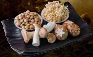
Mushroom Platter きのこ盛合せ $15.9