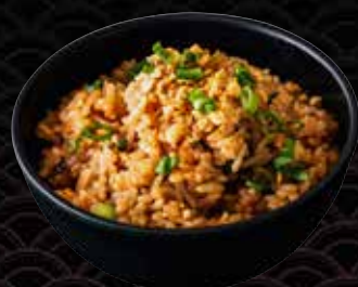
Garlic Fried Rice ガーリックチャーハン $5.9