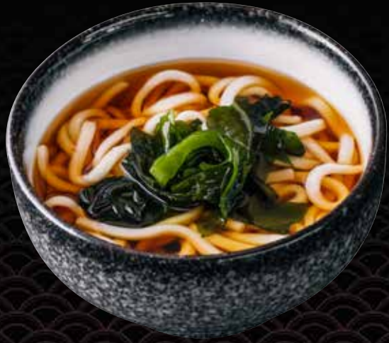
Wakame Udon わかめうどん $11.9