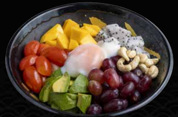
Tajimaya Fruit Salad トリュフ和風サラダ $16.9