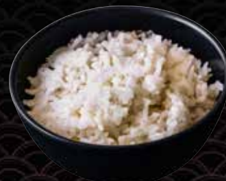
Steam Rice ごはん $3.9