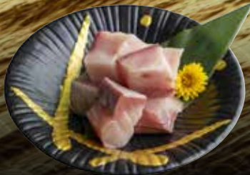
Yellowtail (100g) ハマチ $22.8