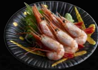
Ama Ebi (Sweet Prawn) 甘エビ $22.9