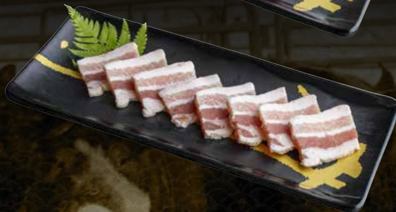
Kurobuta Pork Belly (100g) 黒豚バラ肉 $26.8