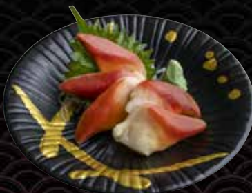
Hokkigai (Surf Clam) ホッキ貝 $26.9