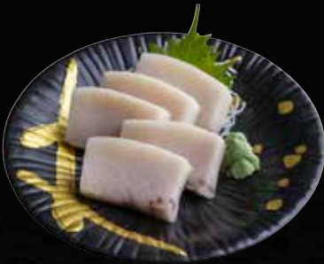
Kajiki (Swordfish) カジキ $17.9