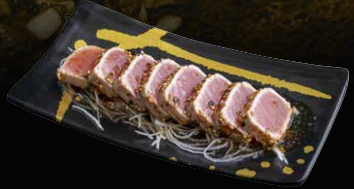
Tuna Tataki マグロのたたき $24.9