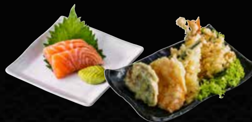
Sashimi (Daily Selection) or Tempura さしみ (日替わり) / 天ぷら