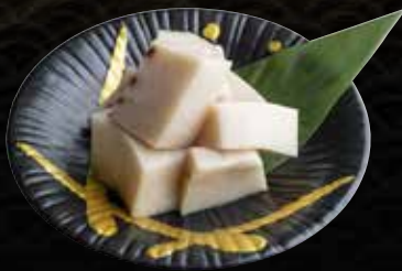
Swordfish (100g) カジキ $18.8