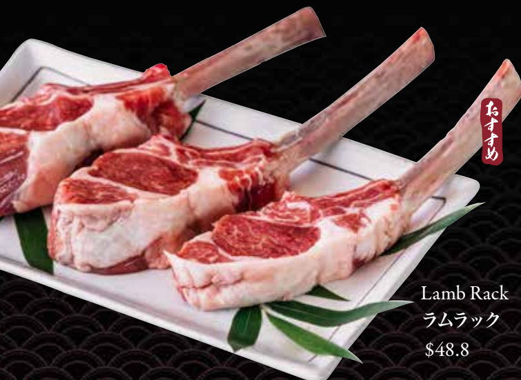
Lamb Rack ラムラック $48.8