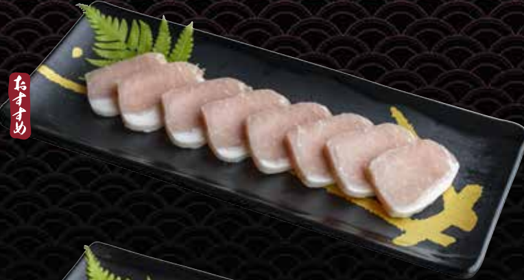
Kurobuta Pork Tenderloin (100g) 黒豚ヒレ肉 $28.8