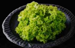
San Chu サンチュ