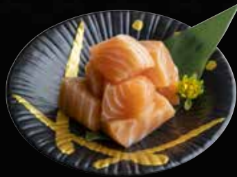
Salmon (100g) サーモン $16.8