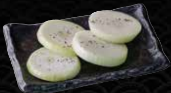
Onion 玉葱 $4.9