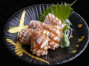
Sake Harasu (Salmon Belly) 鮭ハラス $15.9