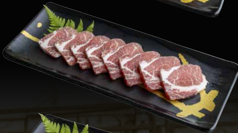
Shirobuta Pork Collar (100g) 白豚肩ロース $28.8