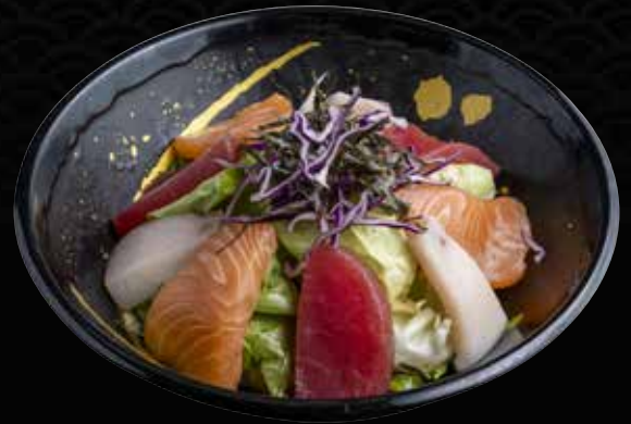
Sashimi Salad 刺身サラダ $18.9