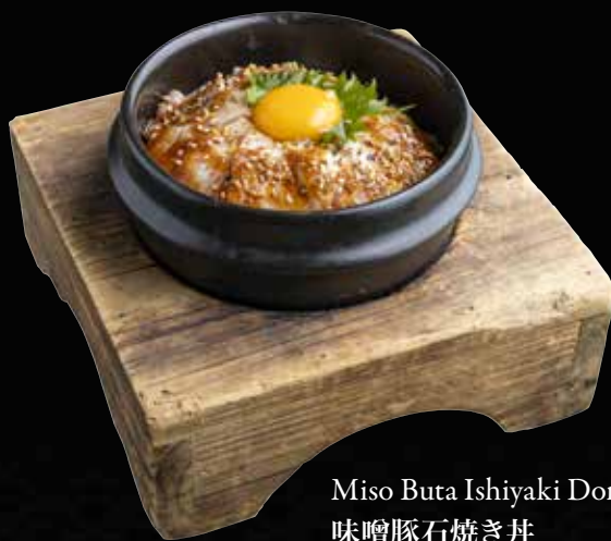
Miso Buta Ishiyaki Don 味噌豚石焼き丼 $22.9