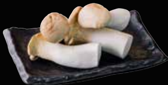
Eringi Mushroom エリンギ $6.9