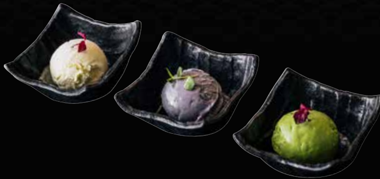
Ice Cream アイスクリーム Yuzu ゆず $6.9 Hokkaido Melon 北海道メロン $6.9 Matcha 抹茶 $10.9