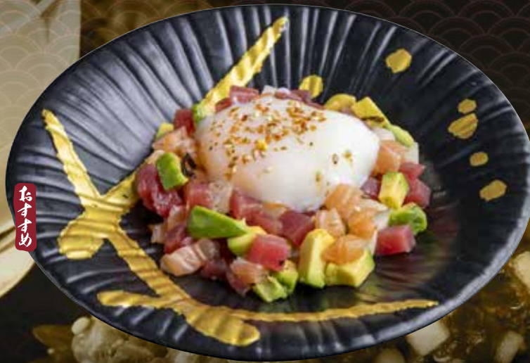
Seafood Tartare with Onsen Egg 温泉卵のタルタルステーキ $12.9