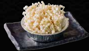
Enoki Mushroom with Butter エノキ $7.9