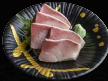
Hamachi (Yellowtail) ハマチ $16.9