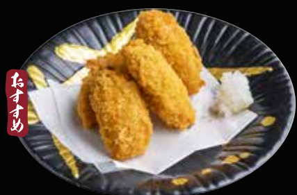
Kaki Fry カキフライ $18.9