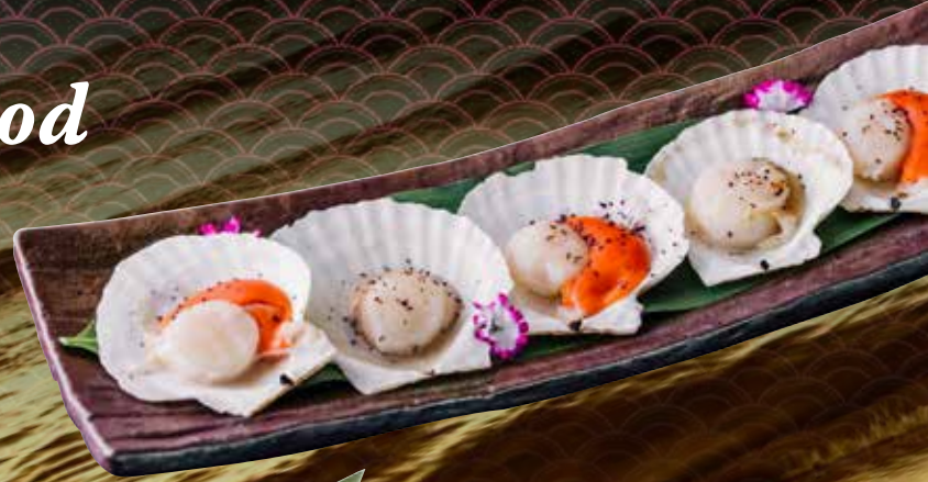
Half-shell Scallop (5pcs) ホタテ $22.8