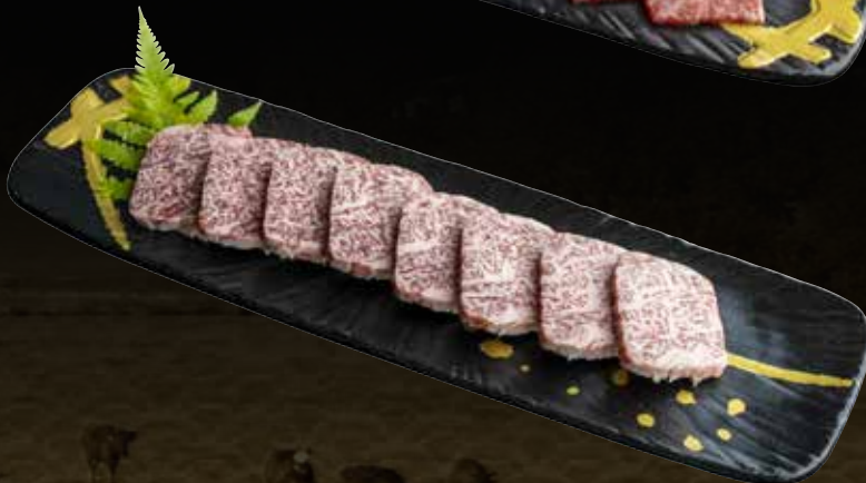
Australian Wagyu Flap Meat MS 6/7 (100g) 和牛フラップ肉 $44.8

Australian Beef Grading MS 6/7 – Richer and denser premium cuts, buttery without being overwhelming.