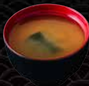
Miso Soup みそ汁