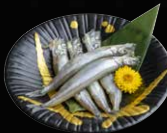
Shishamo (5pcs) ししやも $12.8