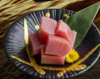
Tuna (100g) マグロ $16.8