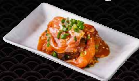
Teriyaki Chicken (100g) 鶏肉 $18.8