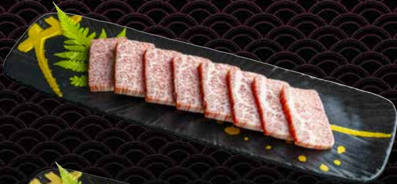
Miyazaki Striploin A4 (100g) 宮崎牛ストリップロイン $68.8