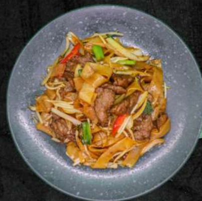
Dry Beef Ho Fun

onion, capsicum, beansprouts & green onion sprinkled with sesame seeds