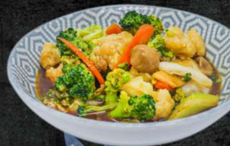
Four Seasons Mixed Veggies