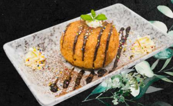
Chocolate Fried Ice Cream