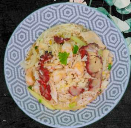
Combination Fried Rice