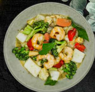
King Prawn Green Curry