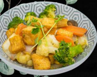
Tofu Stir Fry