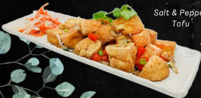
Salt & Pepper Tofu