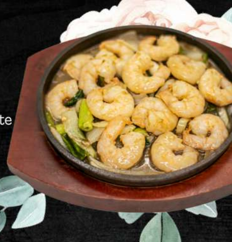
Garlic King Prawns