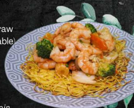
King Prawn Chow Mein