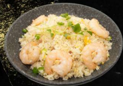
Special Fried Rice