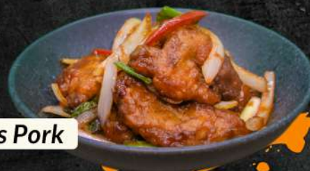
Peking Pork Ribs