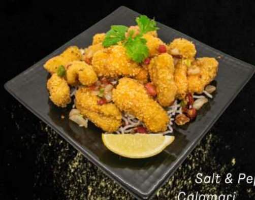
Salt & Pepper Calamari