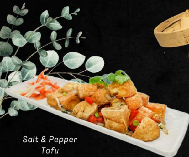
Salt & Pepper Tofu