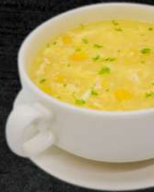
Sweet Corn Soup