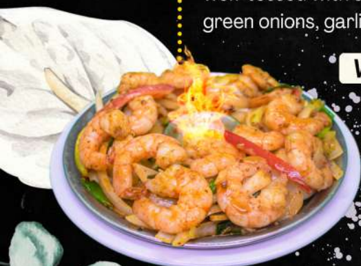
Satay, King Prawn