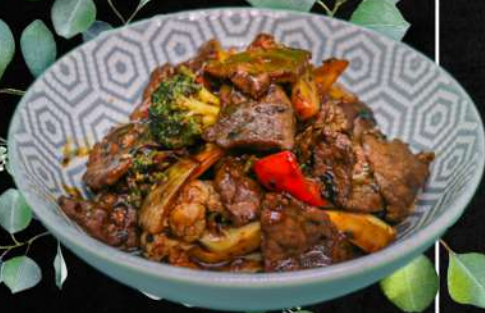
Beef Black Bean & Veggies