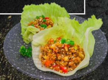
San Choy Bow