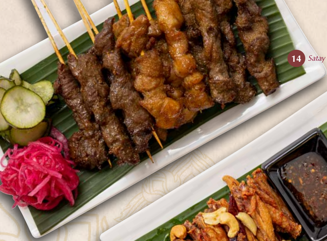
14 Satay Combo