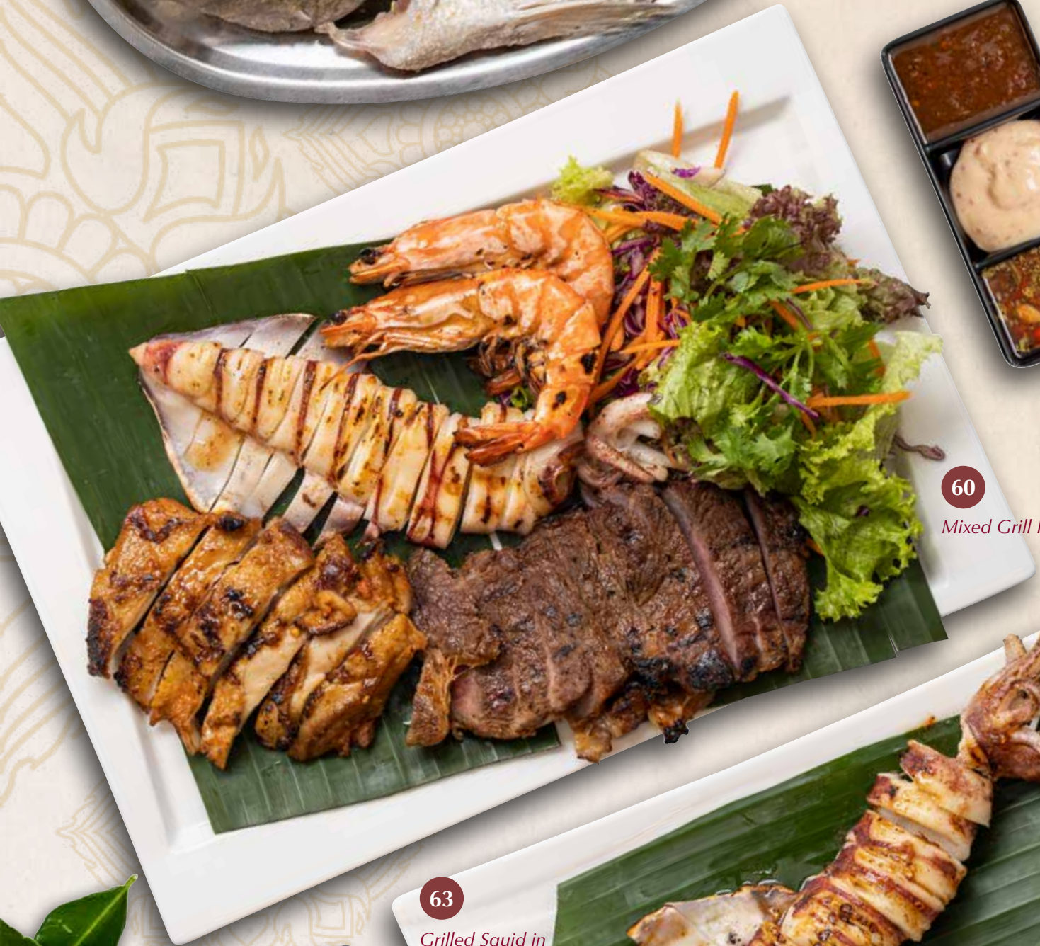
60 Mixed Grill Platter