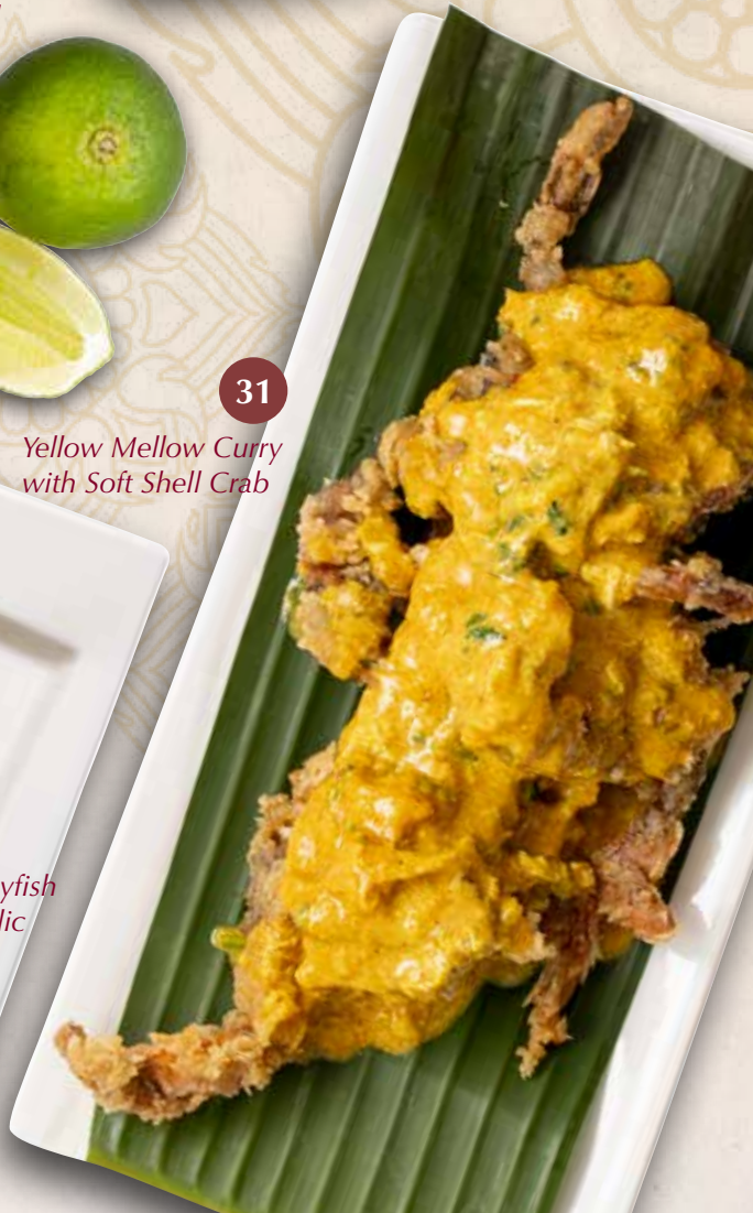
Yellow Mellow Curry with Soft Shell Crab