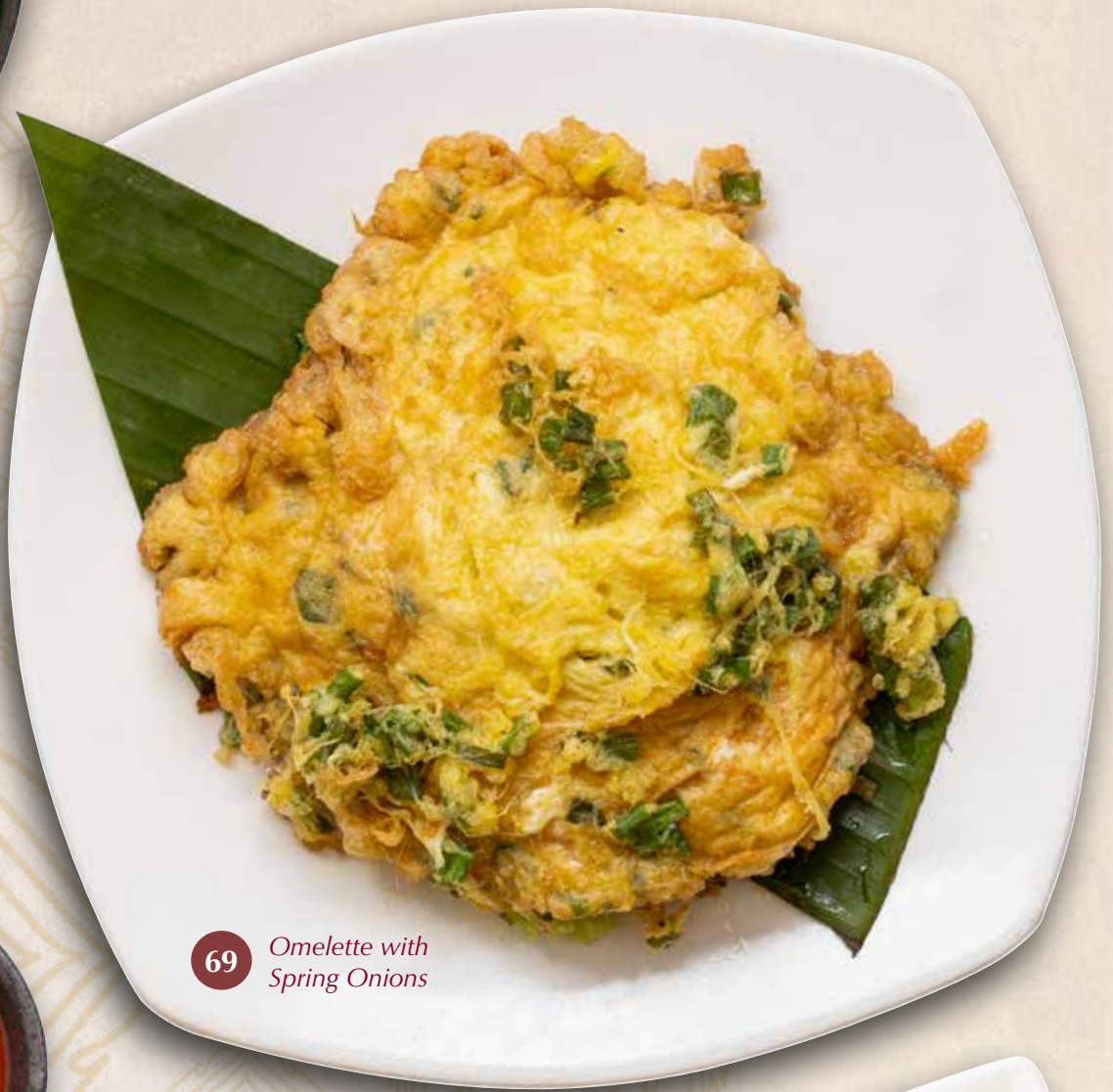
69 Omelette with Spring Onions