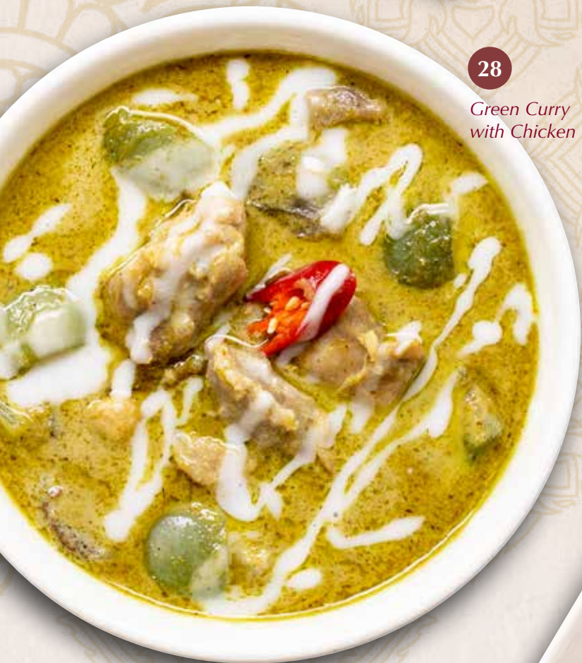
28 Green Curry with Chicken