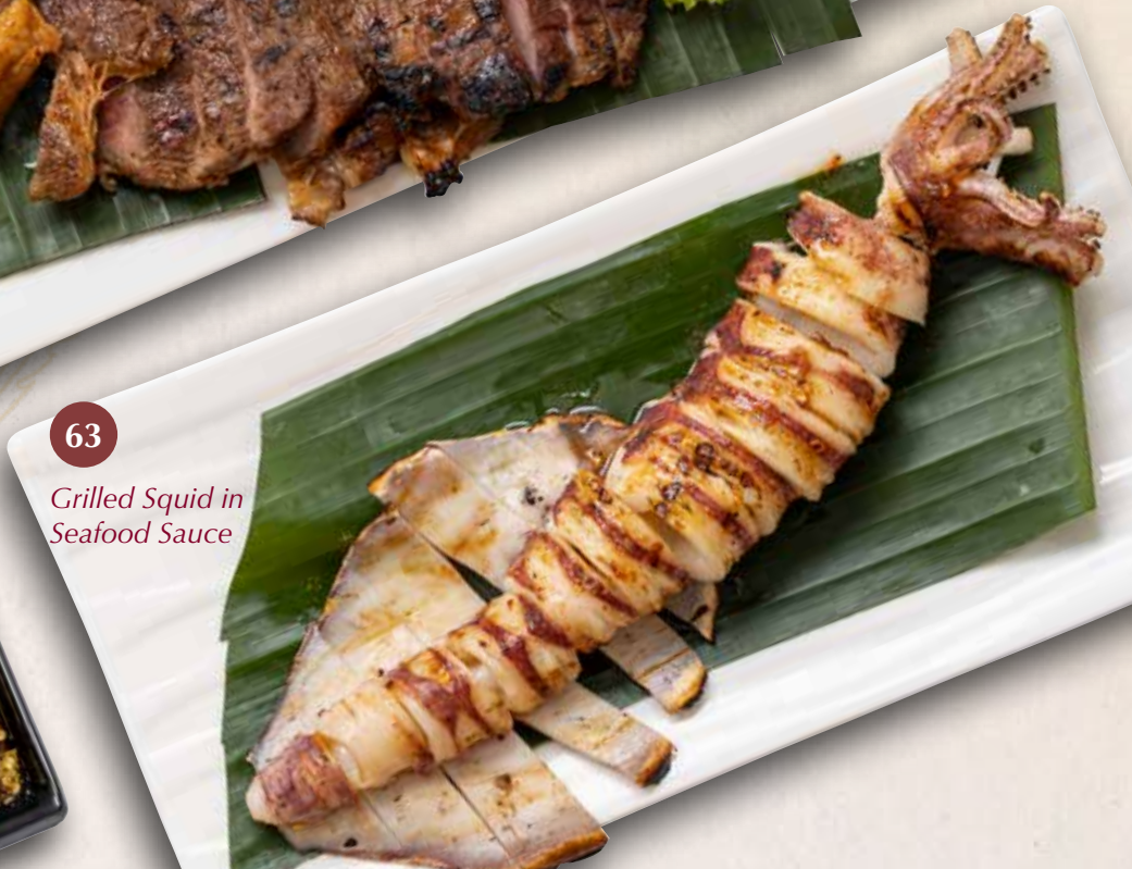
63 Grilled Squid in Seafood Sauce