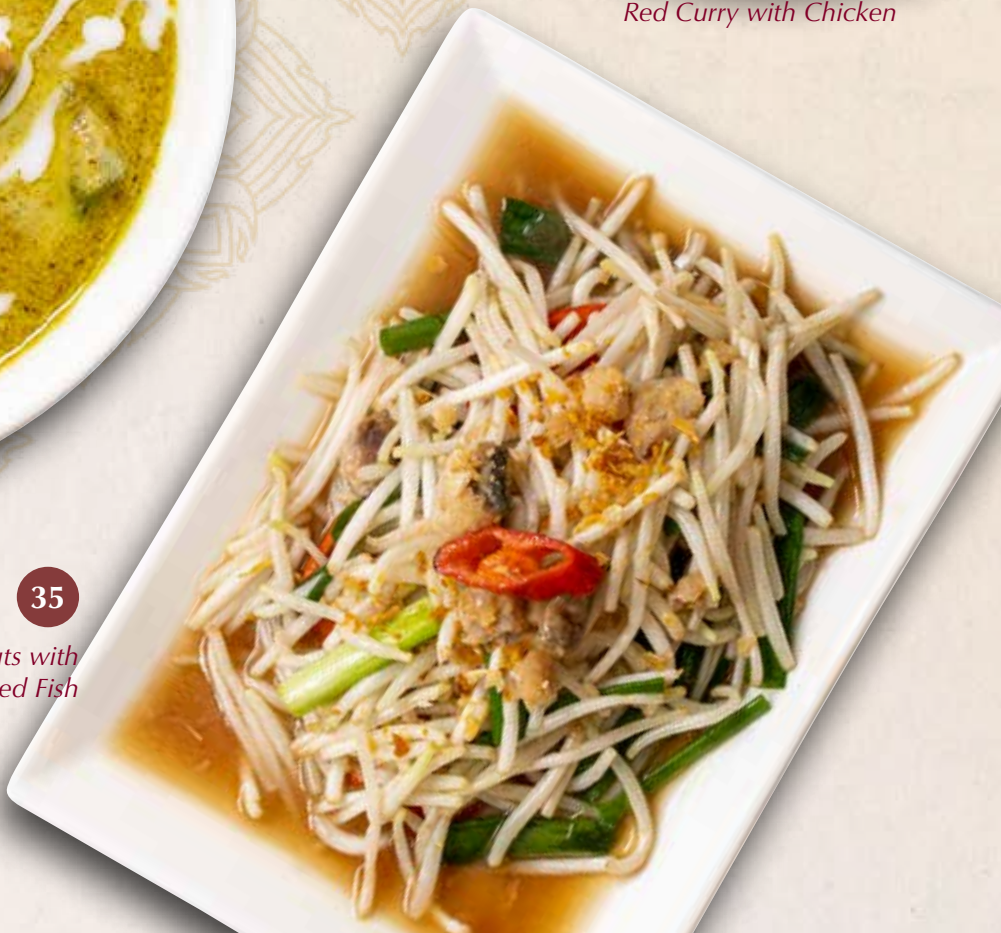
35 Beansprouts with Salted Fish