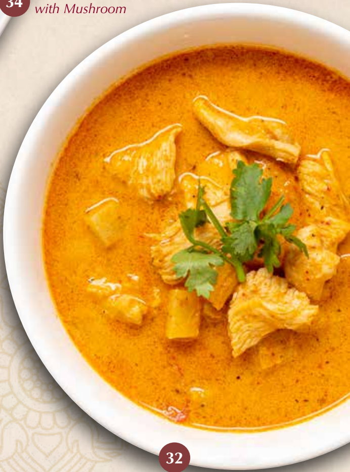
32 Red Curry with Chicken