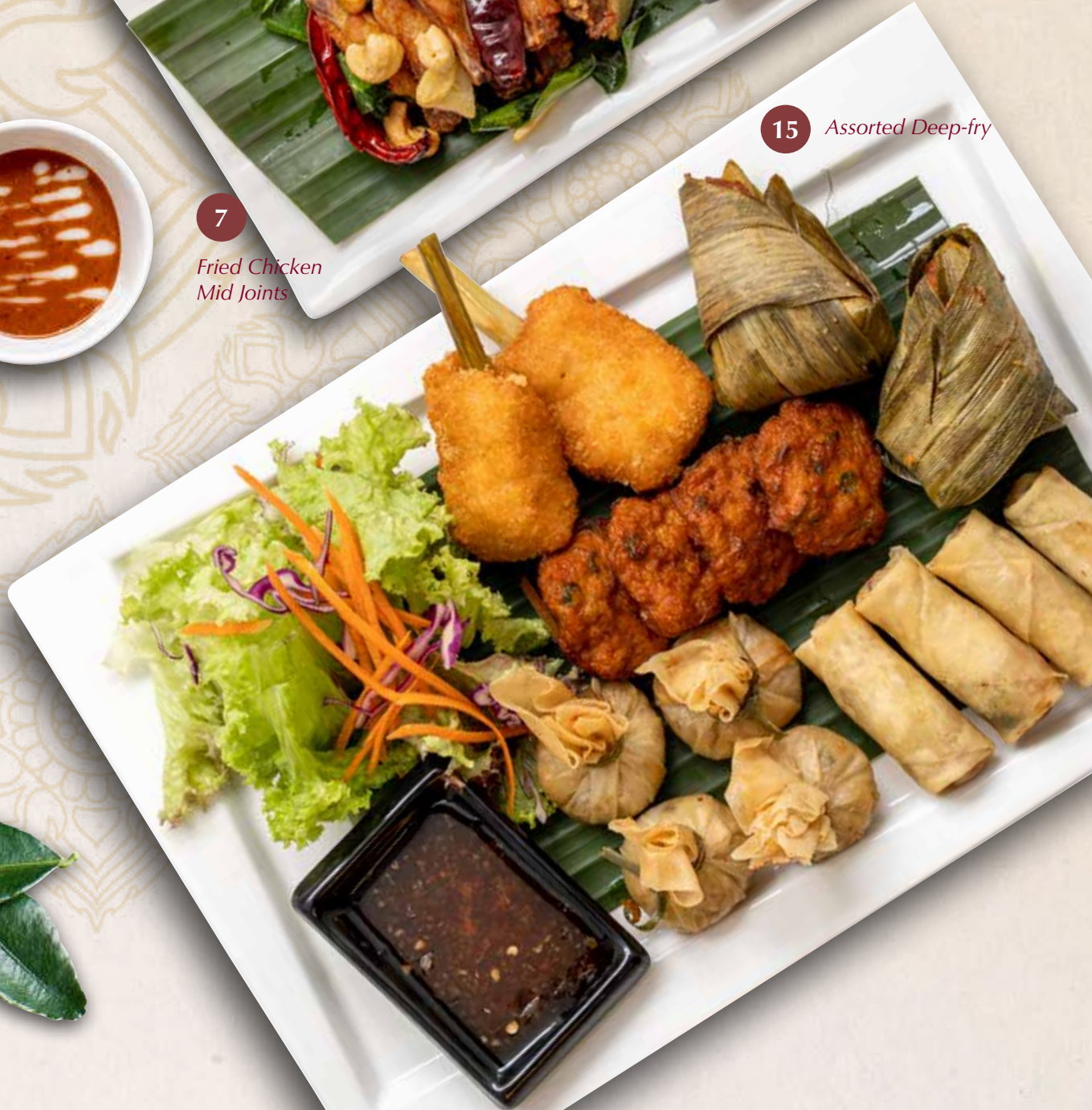
15 Assorted Deep-fry