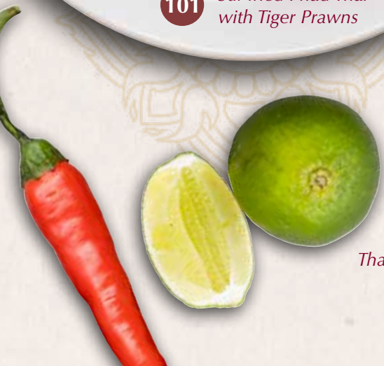
Thai Pink Noodles with Seafood