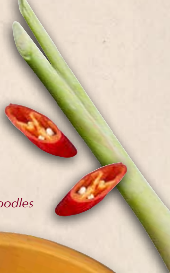
97 Tom Yum Mama Noodles with Seafood