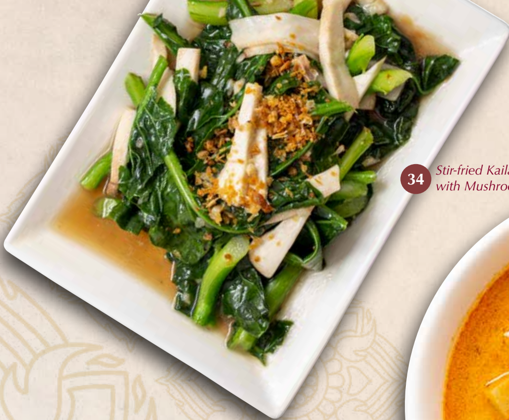
34 Stir-fried Kailan with Mushroom