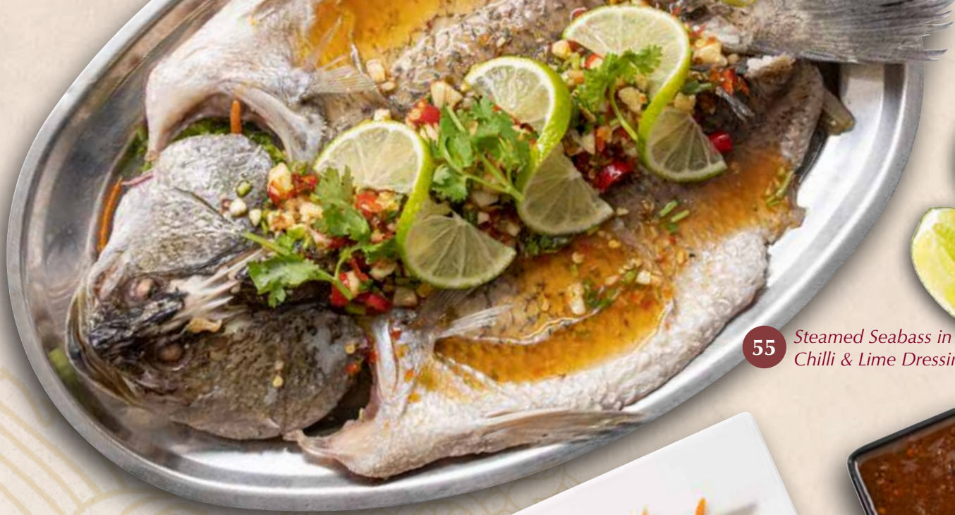
55 Steamed Seabass in Chilli & Lime Dressing