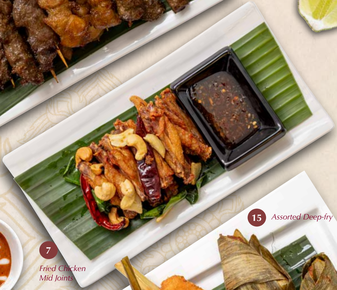
7 Fried Chicken Mid Joints