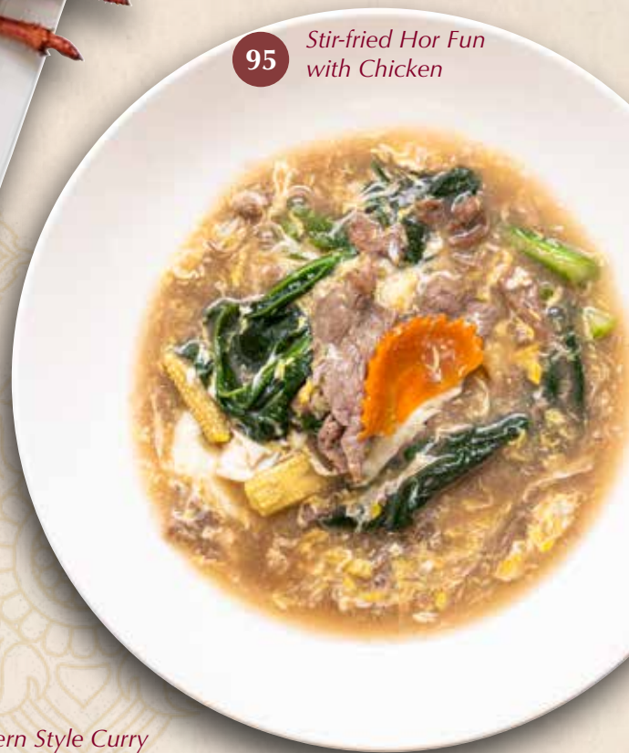
Stir-fried Hor Fun with Chicken