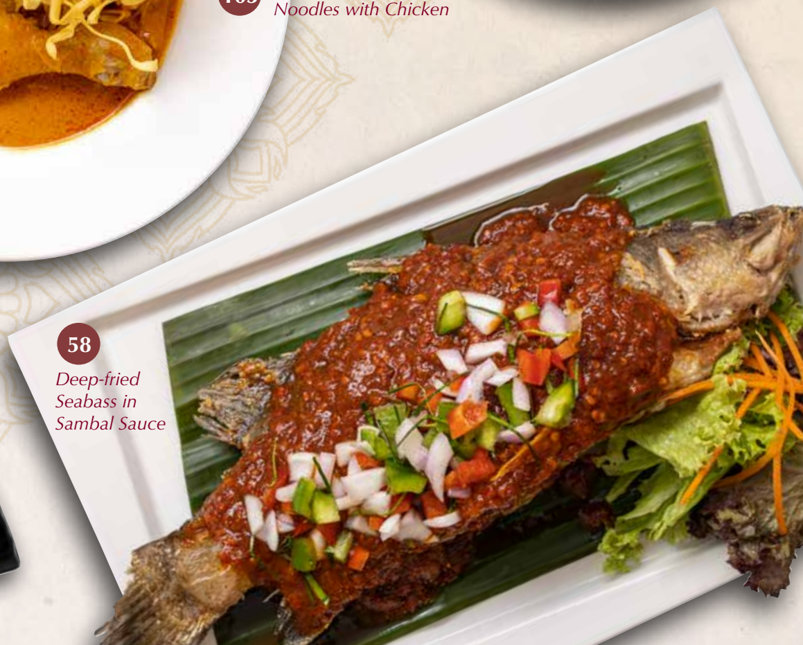
Deep-fried Seabass in Sambal Sauce