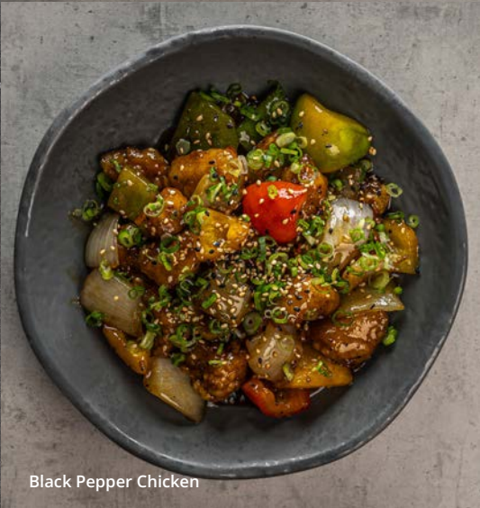
Black Pepper Chicken