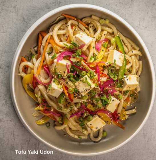
Tofu Yaki Udon