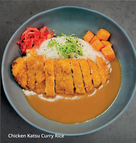
Chicken Katsu Curry Rice