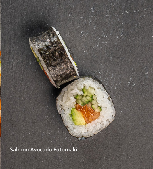
Salmon Avocado Futomaki