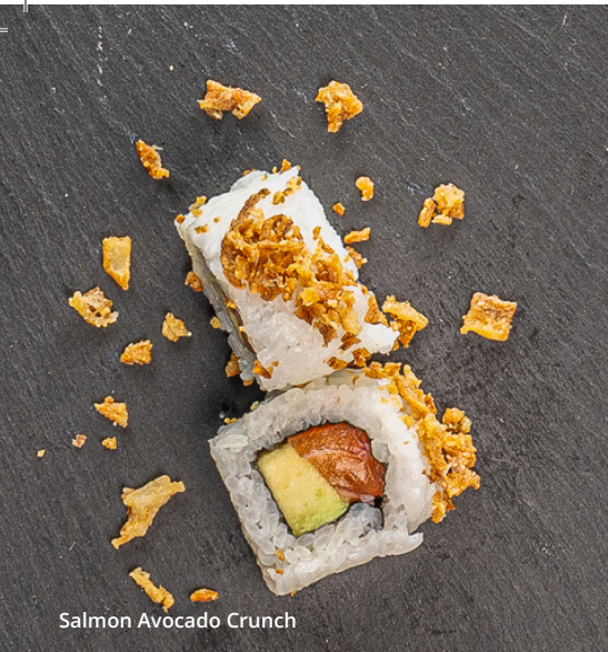
Salmon Avocado Crunch