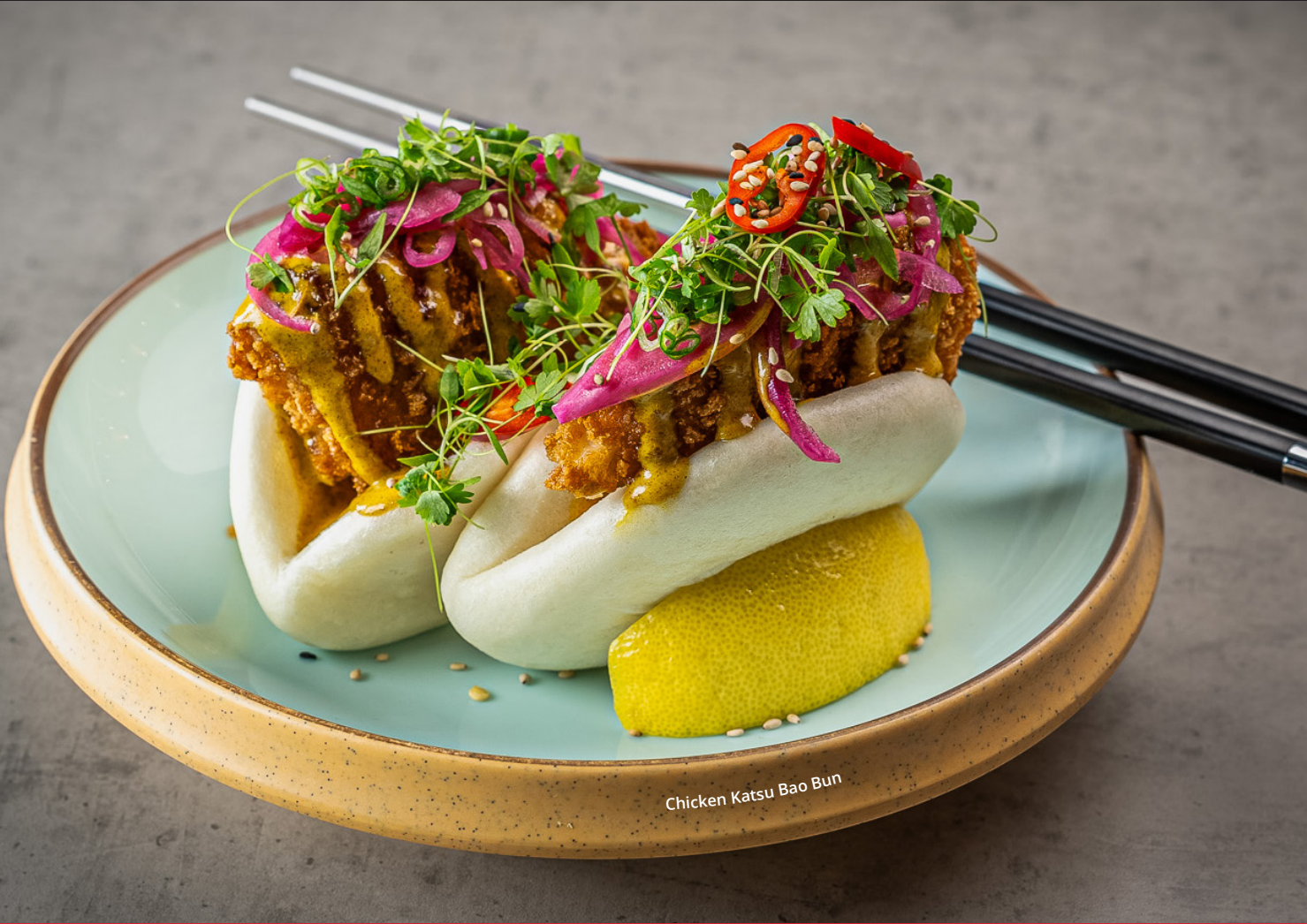
Chicken Katsu Bao Bun