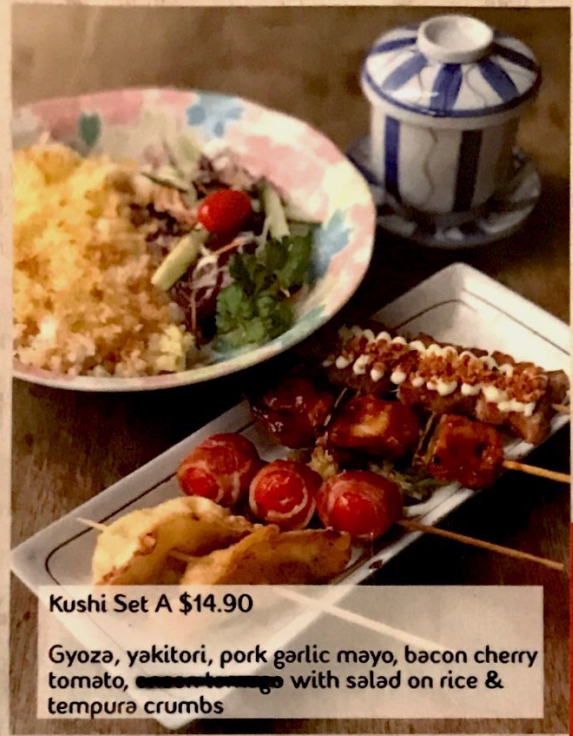
Kushi Set A $14.90

Gyoza, yakitori, pork garlic mayo, bacon cherry tomato, onion tamago with salad on rice & tempura crumbs