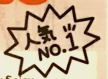
Specialty Spicy Chicken Donburi $14.90

Flavourful bowl of flame grilled chicken glazed with our special hot sauce tare over japanese rice topped with onsen egg, tanuki crumbs & pickles