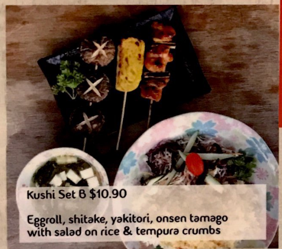
Kushi Set B $10.90

Gyoza, yakitori, pork garlic mayo, bacon cherry tomato, onion tamago with salad on rice & tempura crumbs