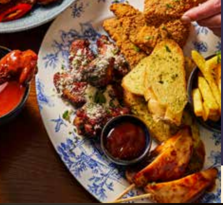
The Chicken Feast