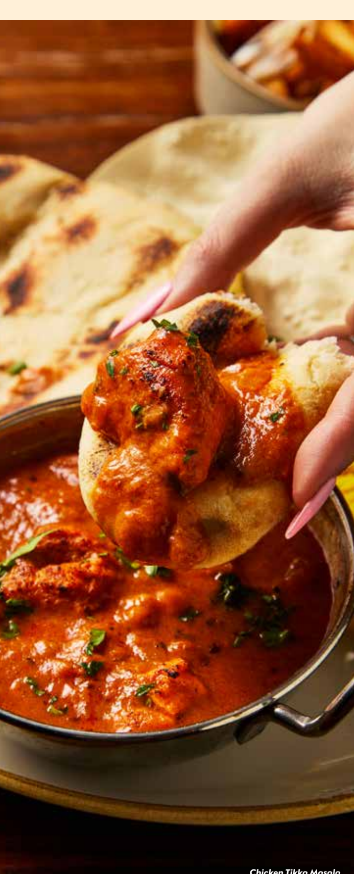
Chicken Tikka Masala

Add a drink for £1.50 to selected main dishes or enjoy a free soft drink on us. £1.50 upgrade to any beer, cider, 175ml of house wine or any low or no alcohol drink.