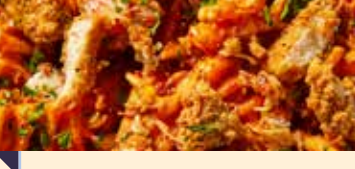
Chicken & Waffle Fries

Spicy Beef Nachos SMALL 7.00 LARGE 10.00 Spicy pulled beef chilli, cheese sauce, jalapeños, spring onions, tomato salsa and garlic & herb sauce. 4.42 kcal / 1135 kcal