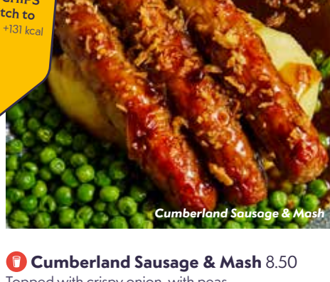
Cumberland Sausage & Mash

WHY STOP THERE? DOUBLE your CHIPS 219 kcal or switch to WAFFLE FRIES +131 kcal for just 2.00