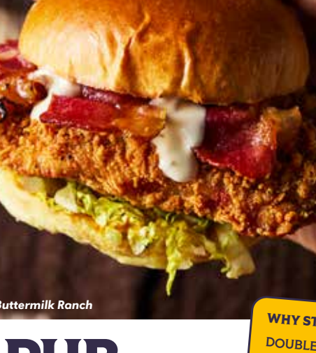
The Buttermilk Ranch

All served in a soft glazed bun with lettuce, onion and gherkin, dished up with a side of skin-on fries. (Unless otherwise stated)