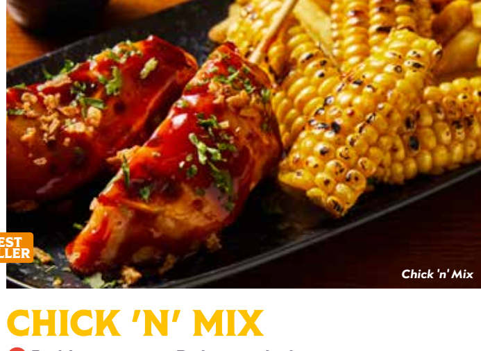
Chick 'n' Mix

Crispy breaded chicken and curry sauce with rice (925 kcal) or chips (904 kcal), peas and spring onions. Make it Veggie 7.33 kcal or Vegan 6.94 kcal