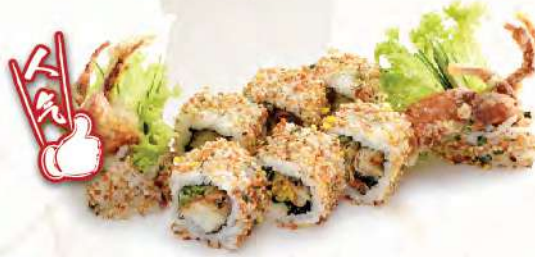
MK 02 ソフトシェルクラブ Soft Shell Crab $12.0 Crispy soft shell crab, spicy tuna sauce and okaka