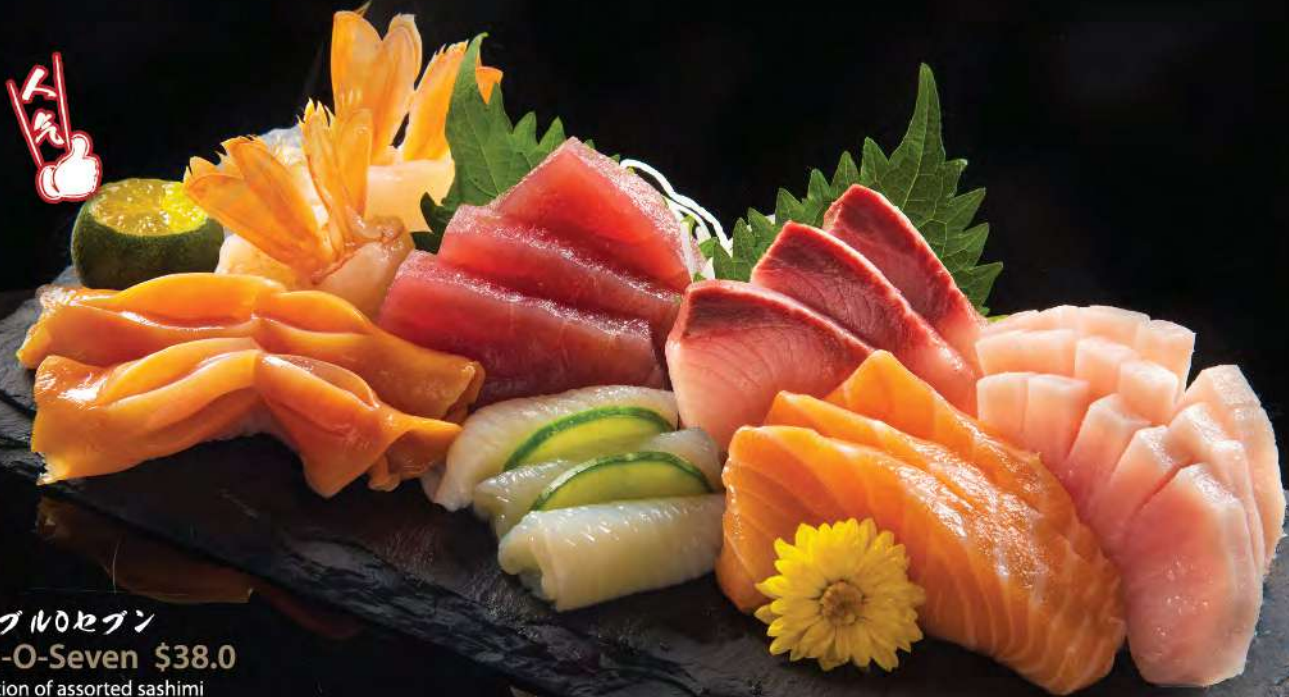
SS 01 ダブル0セブン Double-O-Seven $38.0 Chef's selection of assorted sashimi