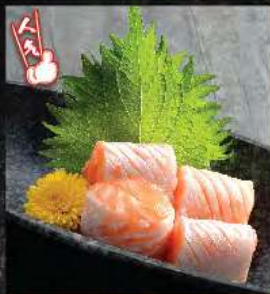
SS 05 サーモン腹 Salmon Belly $9.5