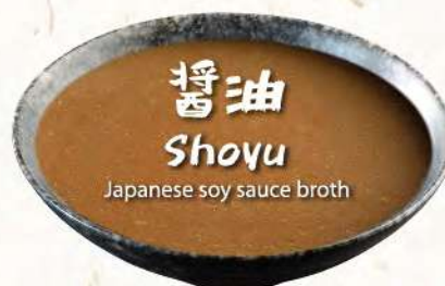
醤油 Shoyu Japanese soy sauce broth