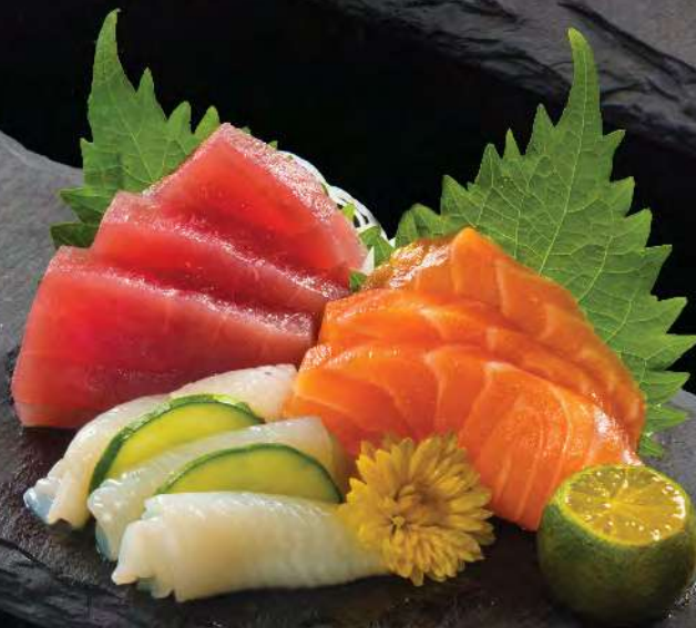
SS 03 3種類の中から Three of a kind $15.0 Chef's selection of assorted sashimi