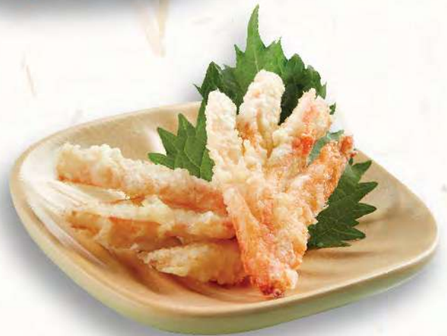
TP 03 カニ天ぷら Kani Tempura $2.39 Fried snow crabstick tempura