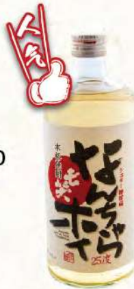
B 20 焼酎 Nanawarai $80.0 Nanchara Hoi Shochu 25% Alc VoL 720ml Pref: Nagano