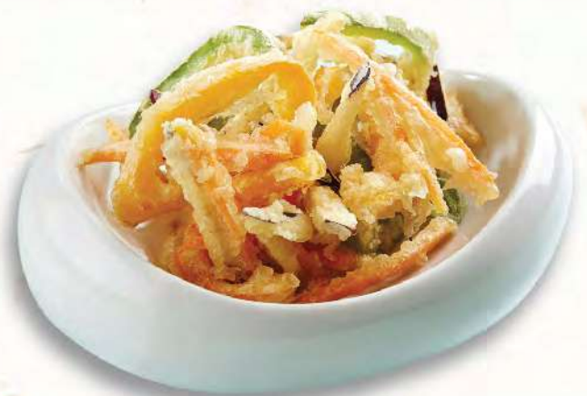
TP 05 野菜かき揚げ Yasai Kakiage $2.39 Crispy shredded vegetable tempura drizzled with teriyaki sauce