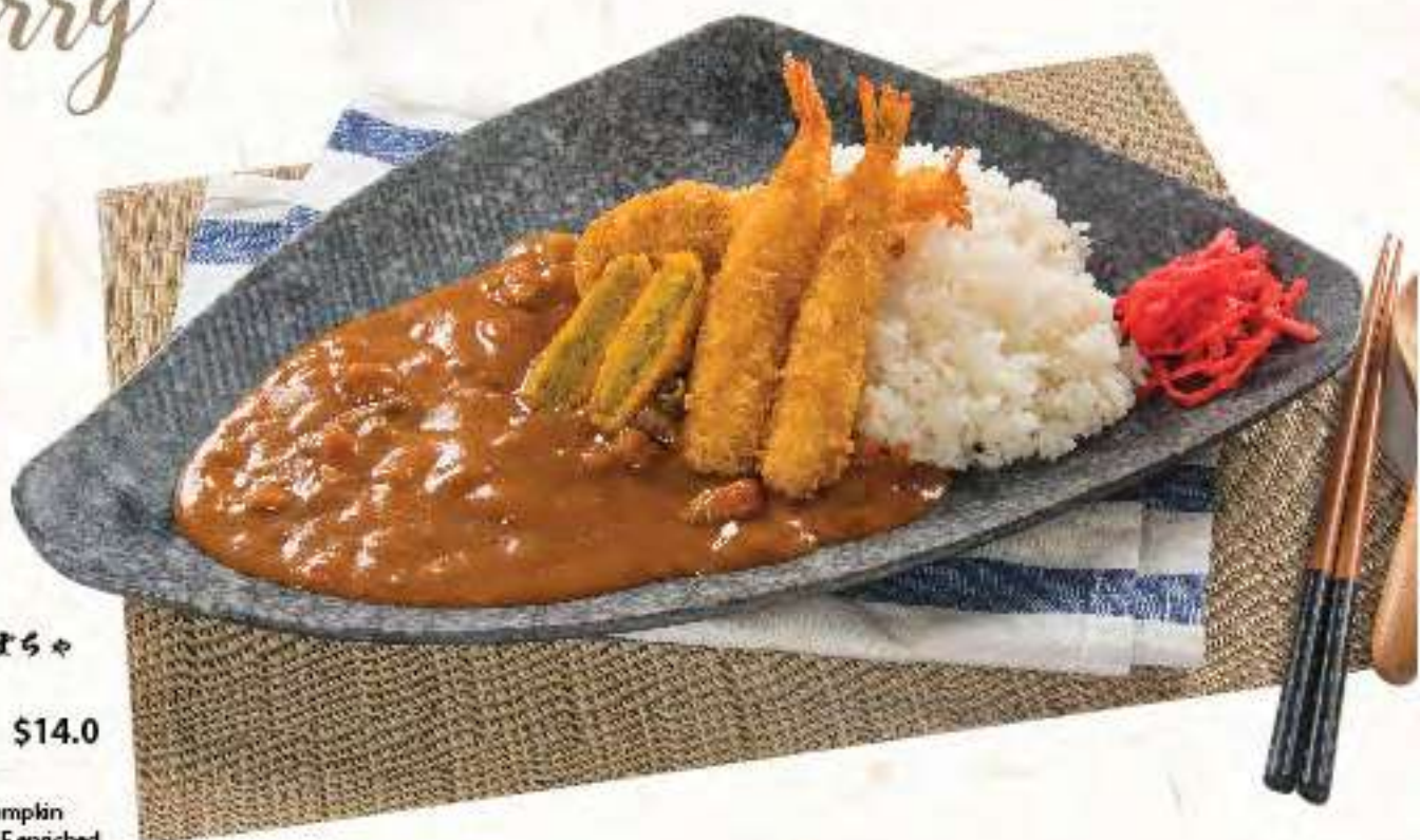
CR 01 エビフライ & かぼちゃ クロquetteカレー Ebi Fry & Pumpkin $14.0 Croquette Curry Crispy breaded prawn fritters, pumpkin croquette and premium Vitamin E enriched Japanese rice