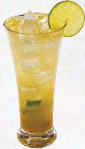
B 05 ホッピン・パッション Poppin' Passion $4.0 Fizzy soda pop with passion fruit bits