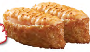
SU 17 サーモン明太イナリ Salmon Mentai Inari $6.39 Grilled salmon with marinated pollock roe sweet beancurd sushi