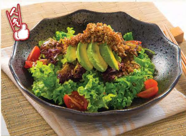
SL 02 ケールヒキノア Kale & Quinoa Salad $10.0 Avocado, kale, quinoa, cherry tomatoes with assorted greens and wafu dressing