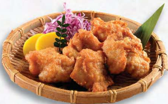
AM 05 鶏からあげ Chicken Karaage $8.0