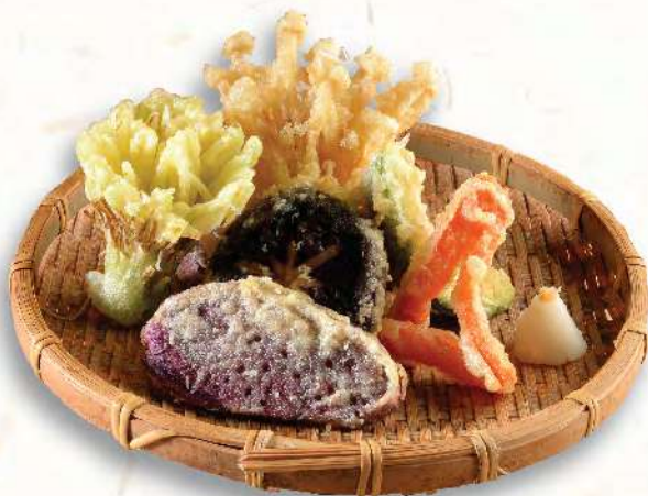
TP 04 野菜天ぷら Yasai Tempura $8.0 Crispy vegetable tempura