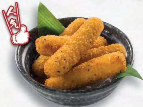
AM 03 モzzarella・スティック Mozzarella sticks $4.5

Tasty breaded cheese sticks fried to perfection