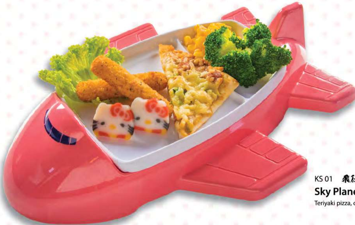
KS 01 飛行機のおむちゃ付きセット Sky Plane Set $10.0 Teriyaki pizza, cheesy sticks and character fish cakes