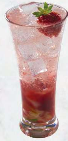
B 07 ベリー・ストロベリー Berry Strawberry $4.0 Fizzy soda pop with strawberry and lime