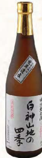
B 18 白神山地の四季 Shirakami Sanchi $63.0 Tokubetsu Junmai SMV: +1 15-16% Alc VoL 720ml Pref: Akita