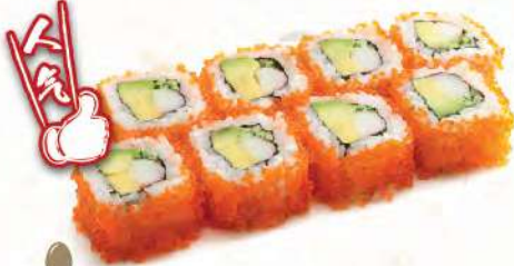
Contains Egg MK 04 カリフォルニアミニ California Mini $8.0 Crabstick, avocado, cucumber, egg omelette and flying fish roe