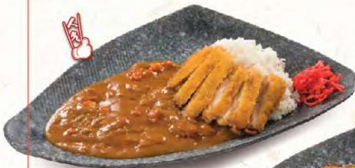
CR 02 チキンカツカレー Chicken Katsu Curry $14.0 Crispy breaded chicken cutlet and premium Vitamin E enriched Japanese rice