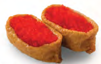
SU 19 鱈子イナリ Ebikko Inari $4.39 Smelt fish roe sweet beancurd sushi