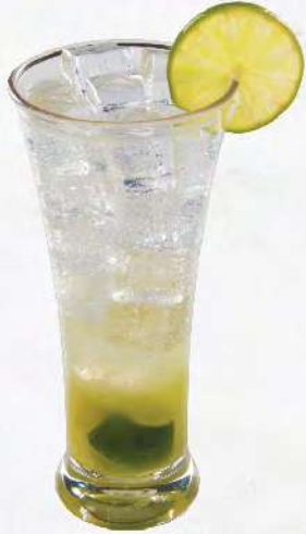
B 04 レモン・フィズ Lemon Fizz $4.0 Fizzy soda pop with refreshing lemon and lime