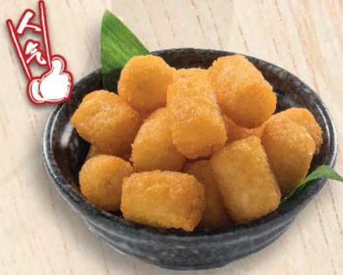
SO 08 ホテトツツ Potato Tots $4.0 Crispy bite-size hashbrowns