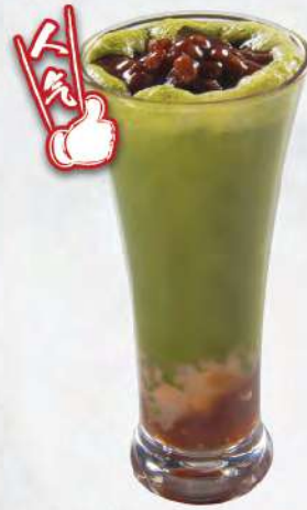
B 02 抹茶ラテ Matcha Latte $4.5 Matcha latte with earl grey jelly, sago and azuki bean