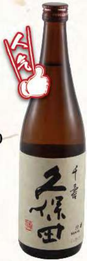
B 24 久保田 千寿 吟醸 Kubota Senjyu $66.0 Ginjyo SMV: +6 15-16% Alc VoL 720ml Pref: Niigata