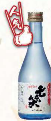
B 22 純銘酒 Nanawarai Junmaishu Sake $18.0 SMV: +2 15% Alc VoL 300ml Pref: Nagano