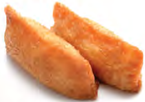
SU 16 イナリ Inari $2.39 Sweet beancurd sushi