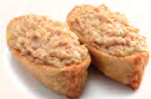
SU 20 マチヨメイヨイナリ Tuna Mayo Inari $4.39 Tuna mayonnaise sweet beancurd sushi