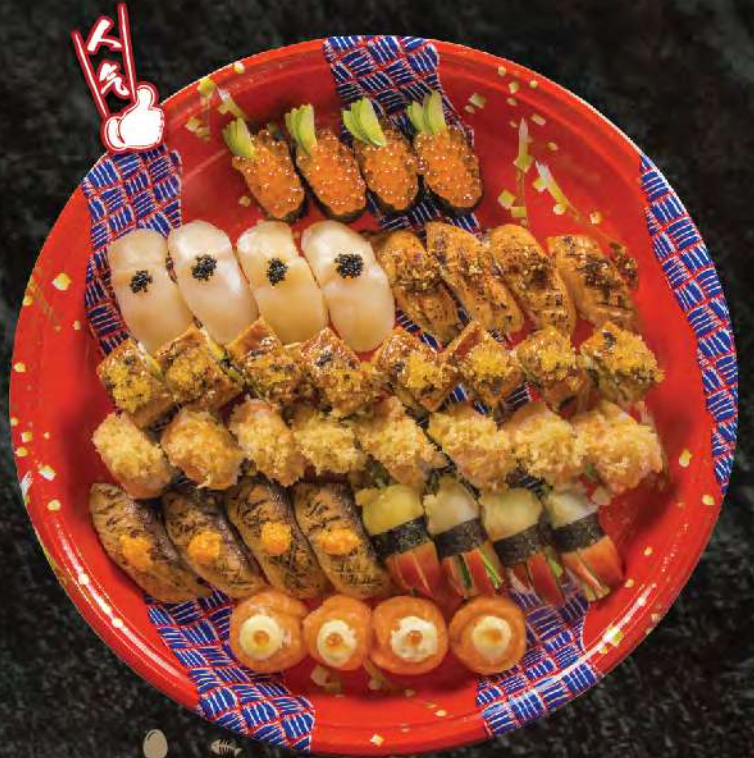
PS 04 栄風プレミアム・ミックス Sakae Premium Mix Platter $77.0