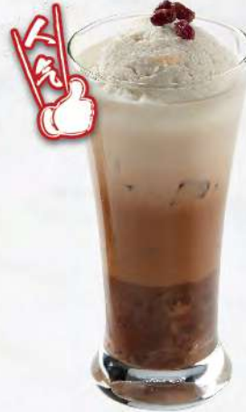
B 10 小豆コーヒー Red Bean Coffee $4.5 Ice coffee float with azuki bean