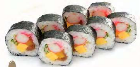
Contains Egg MK 03 太 Futo $10.0 Crabstick, cucumber, pickle, sweet beancurd, smelt fish roe and egg omelette