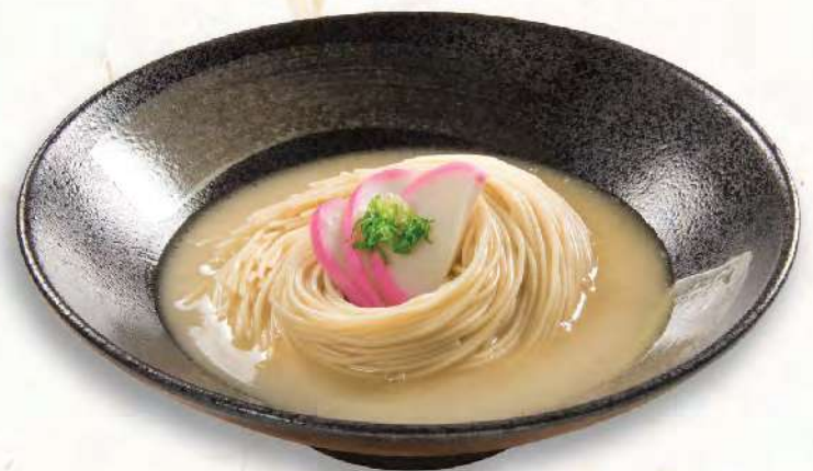
ND 11 素ラーメン Su ramen $11.0

Chicken with Japanese wheat noodles in collagen broth