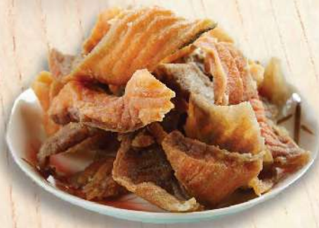
SO 10 サーモン唐揚げ Salmon Karaage $2.39