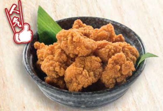
SO 09 ホップコーン・チキン Popcorn Chicken $4.0 Crispy bite-size breaded chicken