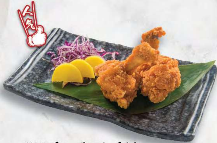
AM 02 チューリップ・チキン Tulip chicken $4.0

Crispy breaded prawn fritters with tonkatsu sauce