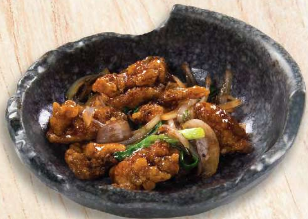
SO 04 照り焼きチキン Teriyaki-Glazed Chicken $10.0 Simmered chicken with teriyaki sauce