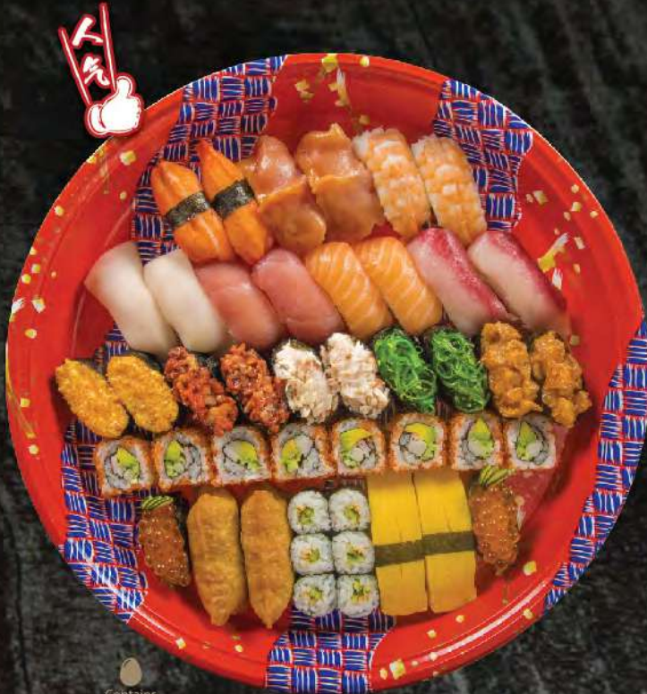
PS 03 栄風ハビネス盛り合わせC Sakae Happiness Platter C $70.0