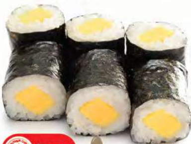
Lower in calories Contains Egg MK 10 たまご Tamago $2.39 Egg omelette