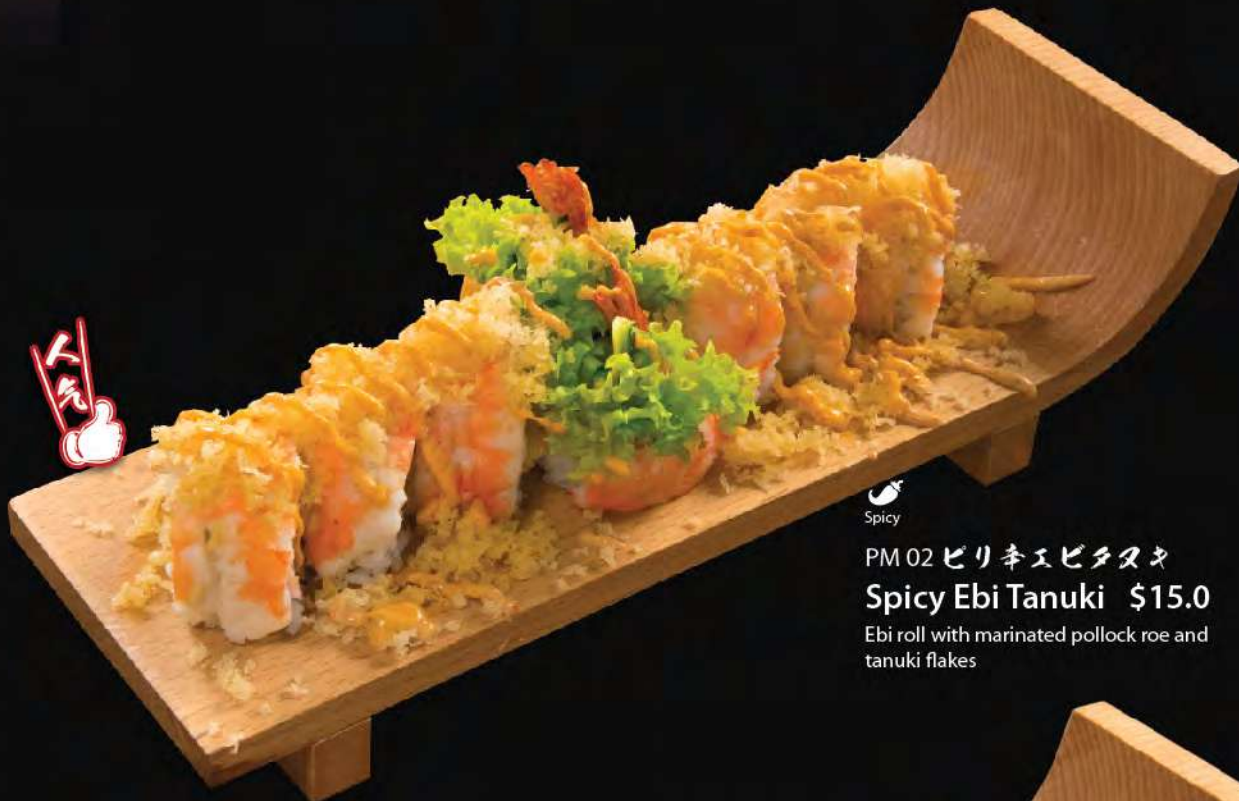
PM 02 ビリ辛エビタヌキ Spicy Ebi Tanuki $15.0 Ebi roll with marinated pollock roe and tanuki flakes