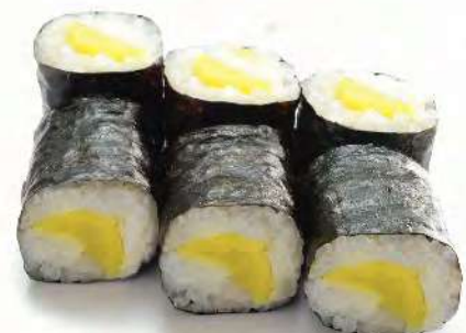
MK 15 おしんこ Oshinko $2.39 Japanese pickle