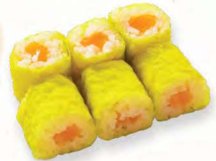
MK 09 サーモン大豆 Salmon Soybean $2.39 Salmon in green soybean