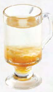
B 14 ヌズ(温/冷) Hot/Iced Yuzu $4.0 Citrus tea