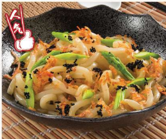
ND 04 ブチ和風おろしうどん Puchit Wafu Oroshi Udon $13.5