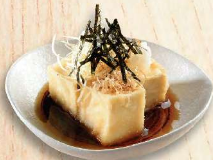
SO 13 揚げ出し豆腐 Agedashi Tofu $5.0 Japanese fried tofu with dashi broth