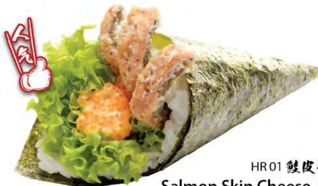
HR01 鮭皮チーズ Salmon Skin Cheese $2.39 Salmon skin with tobikko cheese