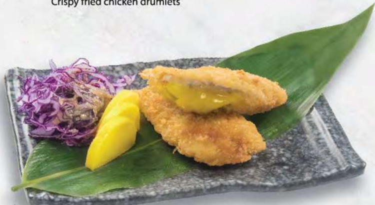
AM 04 大葉チーズ魚フライ Sakana Katsu Cheese $6.0

Tasty breaded cheese sticks fried to perfection