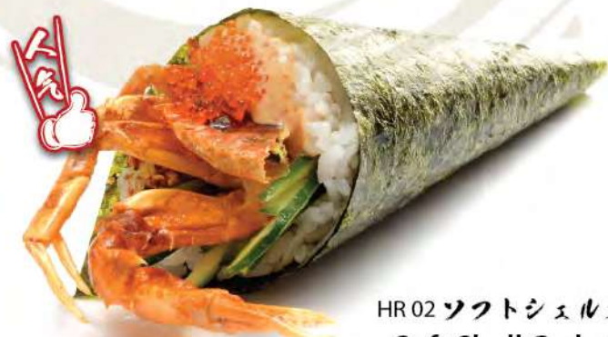
HR02 ソフトシェルクラブ Soft Shell Crab $4.39 Crispy soft shell crab with flying fish roe