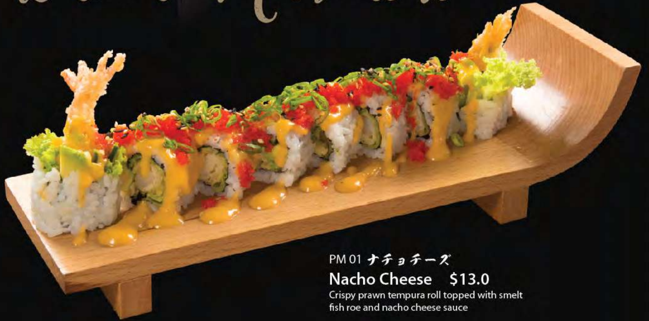
PM 01 ナチョチーズ Nacho Cheese $13.0 Crispy prawn tempura roll topped with smelt fish roe and nacho cheese sauce