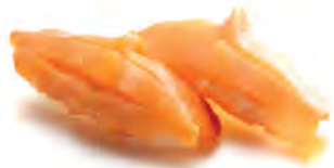
SU 12 赤貝 Akagai $6.39 Ark shell