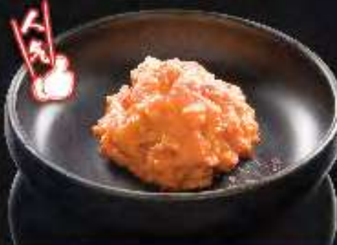
A14 ロブスターサラダ Lobster Salad $6.39 Seasoned lobster salad