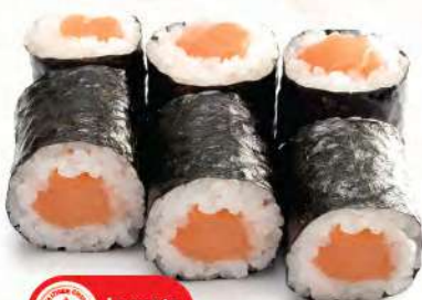
Lower in calories MK 13 サーモン Salmon $2.39