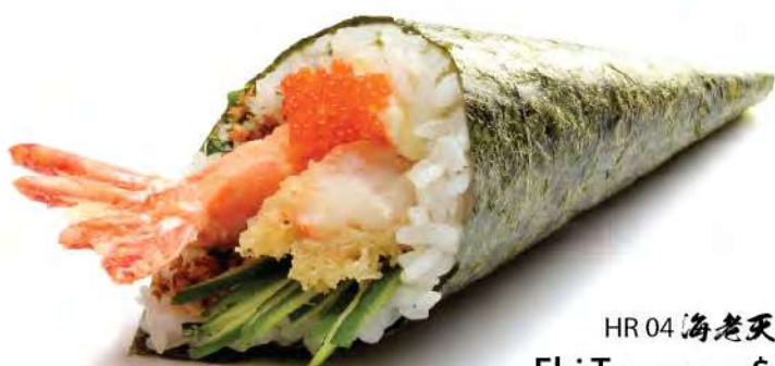
HR04 海老天ぷら Ebi Tempura $4.39 Crispy prawn tempura with flying fish roe