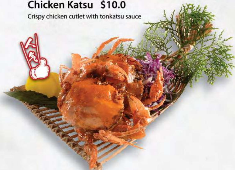
AM 08 ソフトシェルクラブ Soft Shell Crab $12.0

Crispy pumpkin croquette with tonkatsu sauce