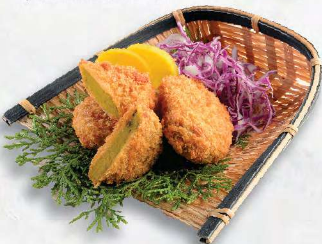
AM 07 カボチャコロッケ Pumpkin Croquette $4.0

Crispy chicken cutlet with tonkatsu sauce