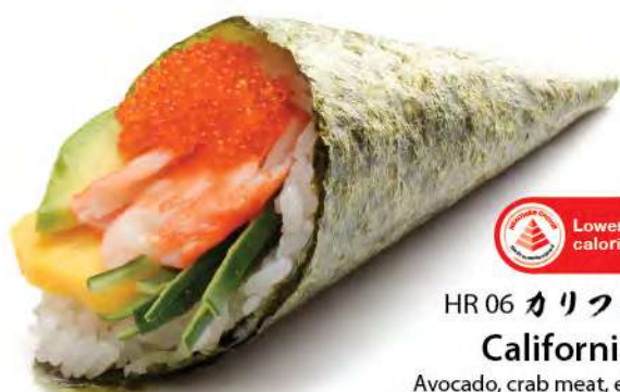
HR06 カリフォルニア California $2.39 Avocado, crab meat, egg omelette with flying fish roe