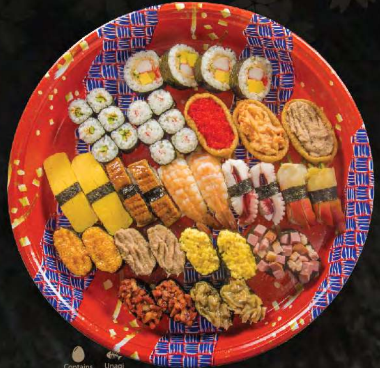
PS 02 栄風ハビネス盛り合わせB Sakae Happiness Platter B $66.0