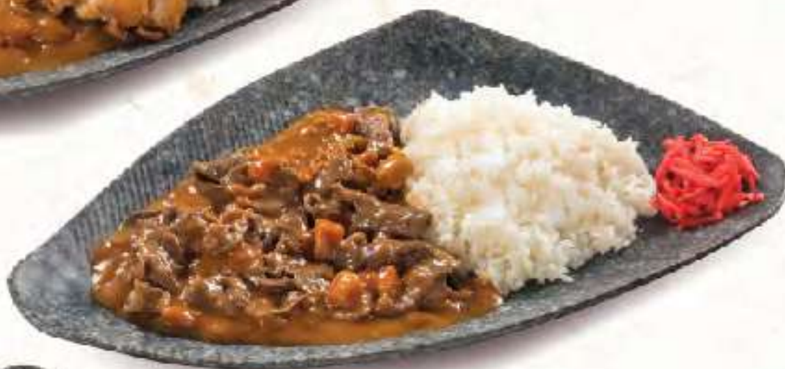
CR 03 牛う肉カレー Gyuniku Curry $14.0 Sliced beef and premium Vitamin E enriched Japanese rice