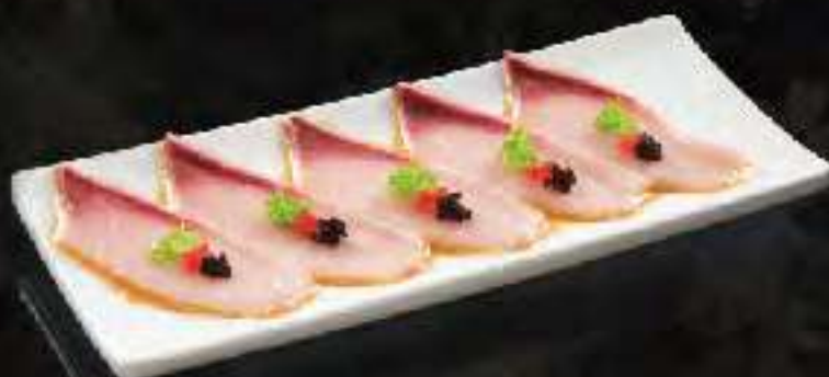
A08 ハマチ・カルパッチョ Hamachi Carpaccio $9.0 Yellowtail topped with flying fish roe, spring onions and tangy yuzu sauce