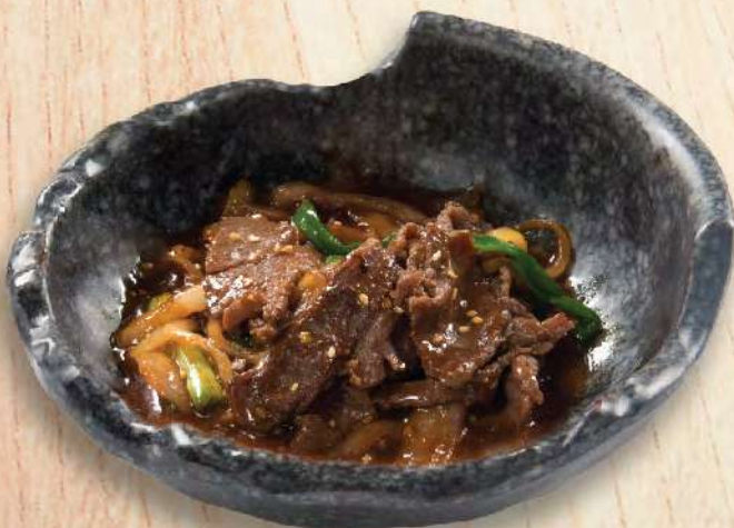
SO 05 牛焼肉 Gyu Yakiniku $12.0 Simmered sliced beef with yakiniku sauce