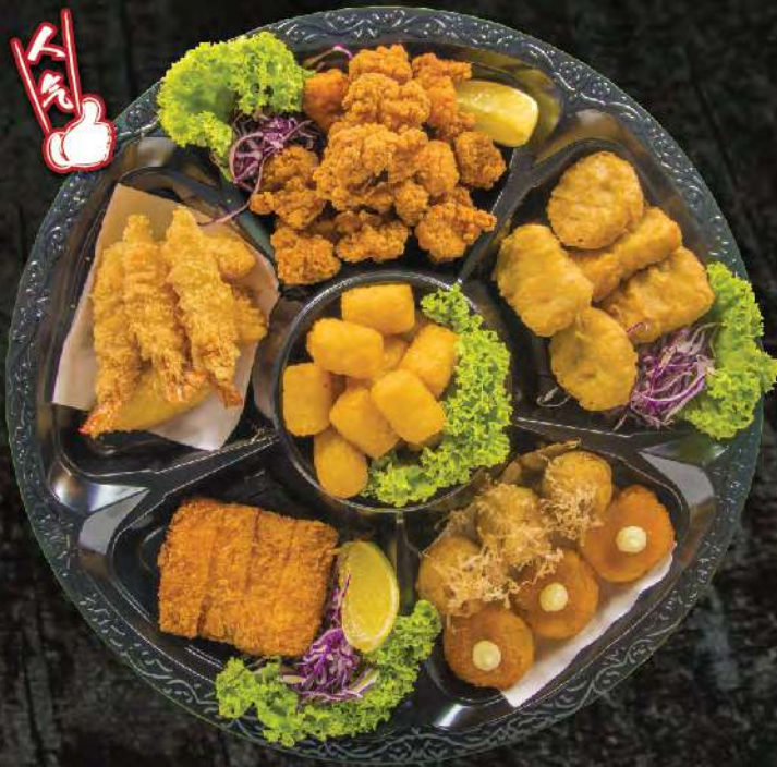
MP 02 栄風おつまみの盛り合わせ1 Sakae Snack Platter 1 $22.0