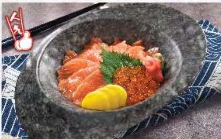
PD 12 サーモンイクラ丼 Salmon Ikura Don $16.0 Fresh salmon slices and salmon roe on premium Vitamin E enriched sushi rice