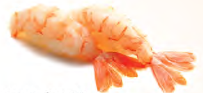
SU 07 赤エビ Aka Ebi $6.39 Giant red shrimp