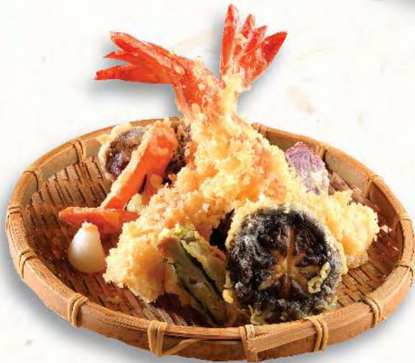
TP 02 天ぷら盛り合わせ Tempura Moriawase $12.0 Crispy prawn and vegetable tempura