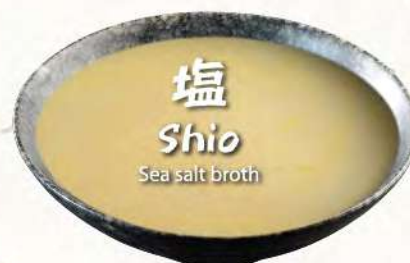
塩 Shio Sea salt broth