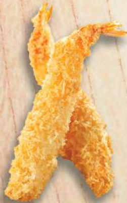
SO 16 エビフライ Ebi Fry $2.39 Crispy breaded prawn fritters