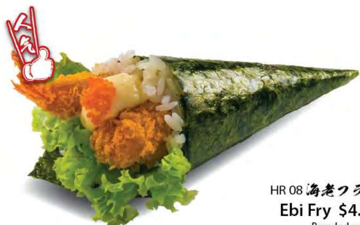
HR08 海老フライ Ebi Fry $4.39 Breaded prawn with flying fish roe