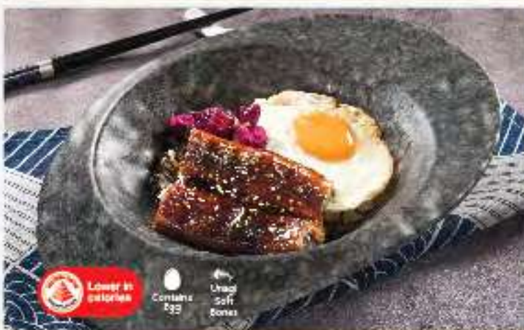
PD 10 うなぎたま丼 Unatama Don $16.0 Grilled river eel and sunny-side up on premium Vitamin E enriched Japanese rice