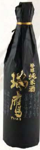
B 17 猪鷹 芳醇純米酒 Zuiyo Honjun $62.0 Junmai SMV: +6 15-16% Alc VoL 720ml Pref: Kumamoto