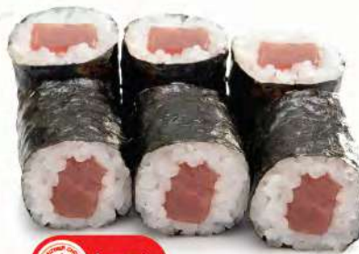
Lower in calories MK 11 テッカ Tekka $2.39 Tuna