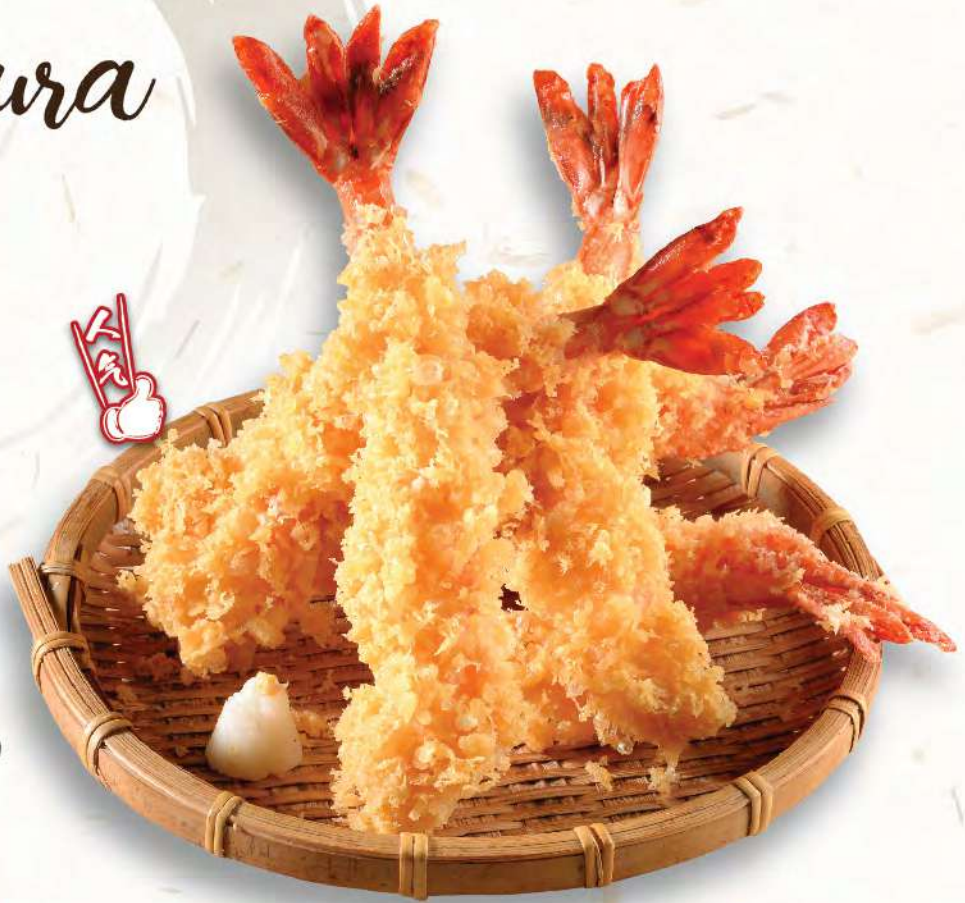
TP 01 海老天ぷら Ebi Tempura $14.0 Crispy prawn tempura