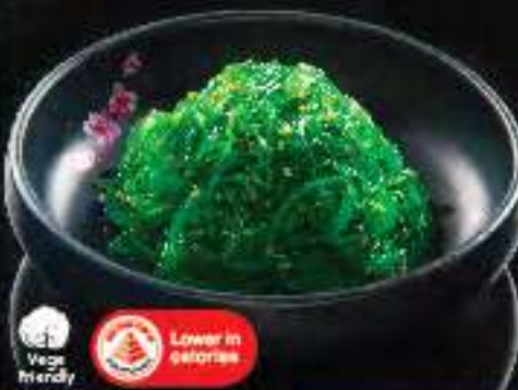
A13 中華わかめ Chuka Wakame $4.39 Seasoned seaweed