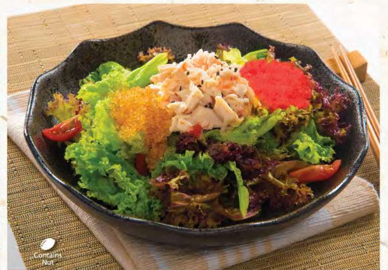
SL 05 カニサラダ Kani Salad $7.0 Crab meat, flying fish roe with assorted greens and goma dressing