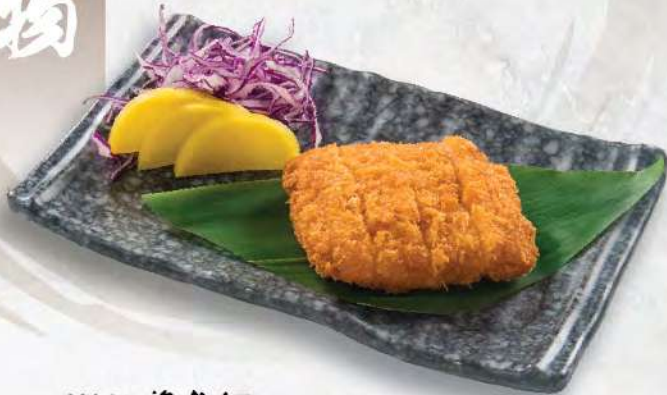
AM 01 海老カツ Katsu Prawn $4.0

Crispy breaded prawn fritters with tonkatsu sauce