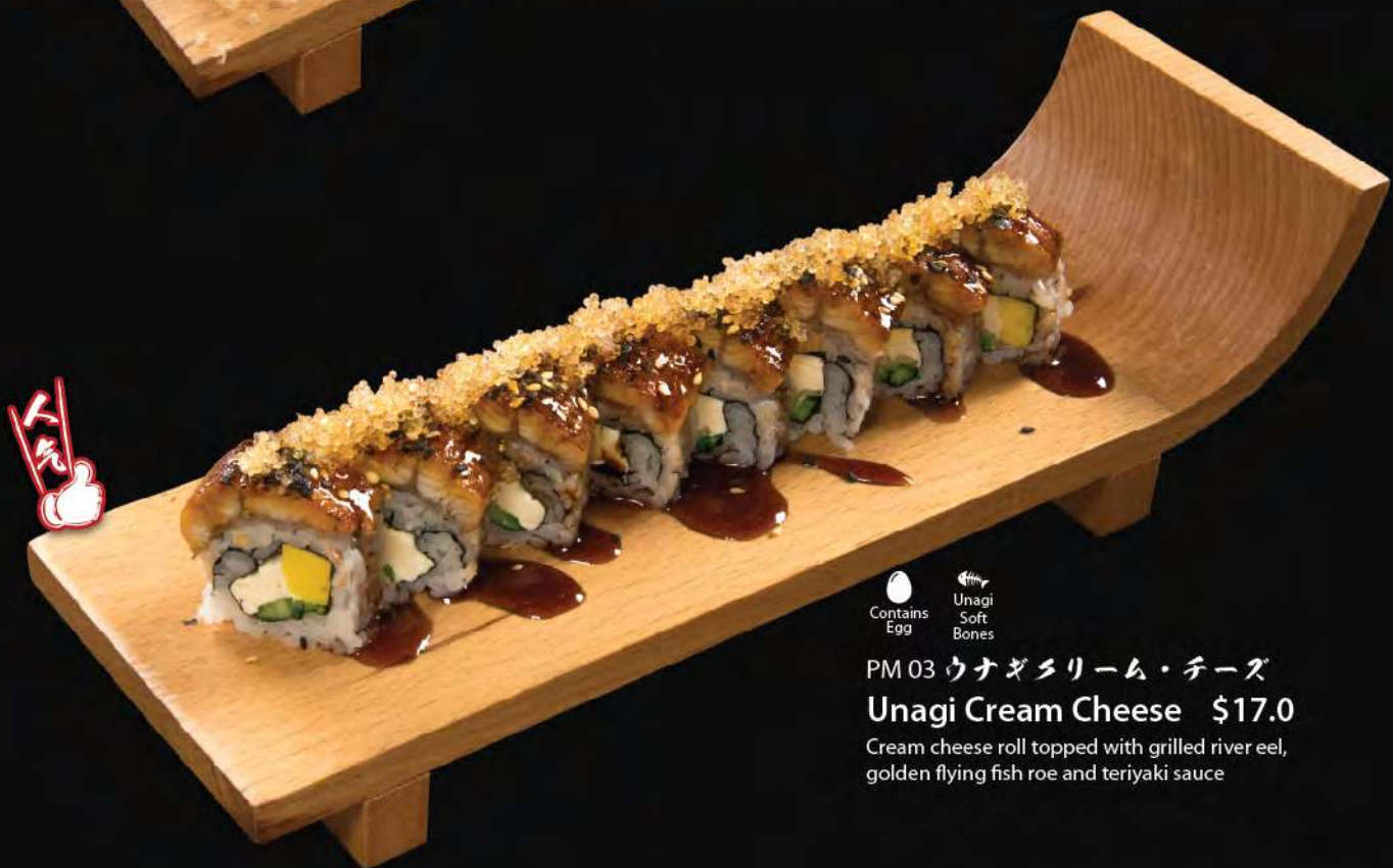
PM 03 ウナギクリーム・チーズ Unagi Cream Cheese $17.0 Cream cheese roll topped with grilled river eel, golden flying fish roe and teriyaki sauce