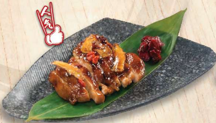
SO 01 中華風ハーブチキン Herbal Dang Gui Chicken $12.0 Chicken infused with dang gui