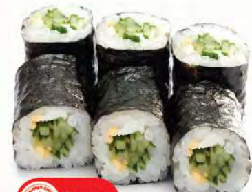
Lower in calories MK 12 カッパ Kappa $2.39 Cucumber