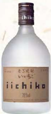
B 26 いいちこ 麦焼酎 Iichiko Mugi $66.0 Shochu 25% Alc VoL 720ml Pref: Oita