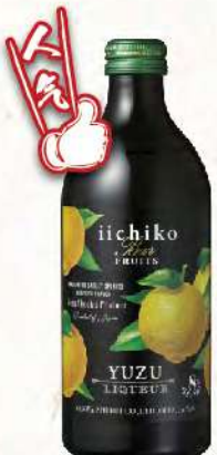
B 27 いいちこ 柚子リニューール Iichiko Yuzu $27.0 Liqueur 8% Alc VoL 375ml Pref: Oita