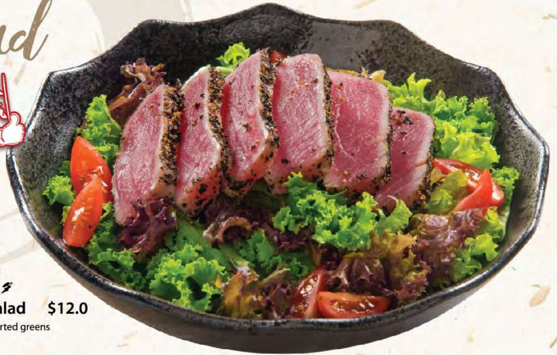
SL 01 鯖タタキサラダ Maguro Tataki Salad $12.0 Torch-seared tuna with assorted greens and wafu dressing