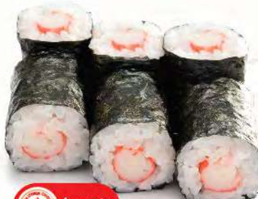
Lower in calories MK 14 カニ Kani $2.39 Crabstick