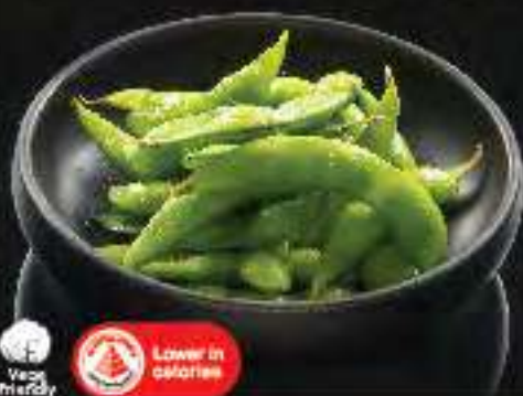
A09 枝豆 Edamame $4.39 Soybeans