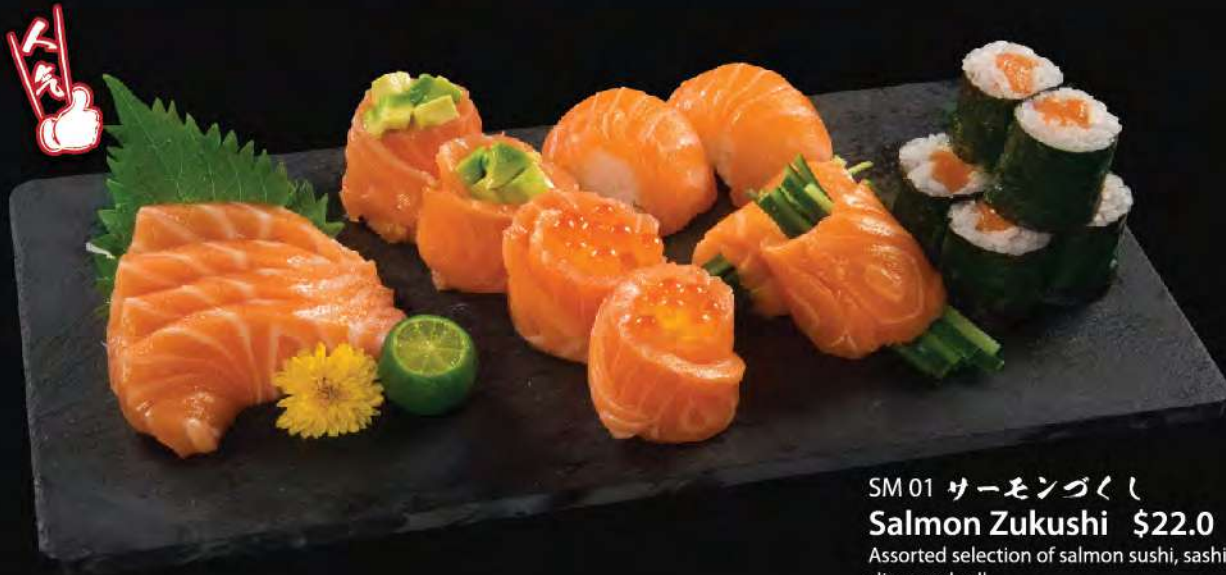
SM 01 サーモンづくし Salmon Zukushi $22.0 Assorted selection of salmon sushi, sashimi slices and roll