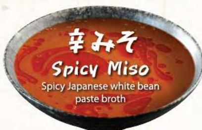
辛みそ Spicy Miso Spicy Japanese white bean paste broth