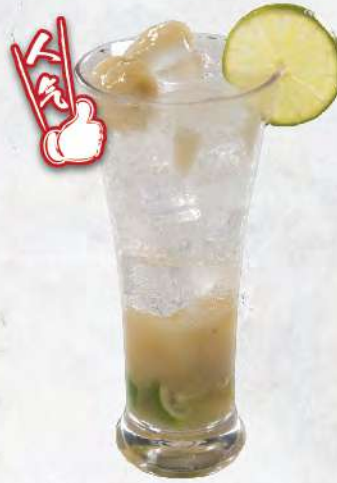
B 06 サワーソップ・ソーダ Sparkly Soursop $4.0 Fizzy soda pop with tropical fruits, sour yet sweet with soursop bits