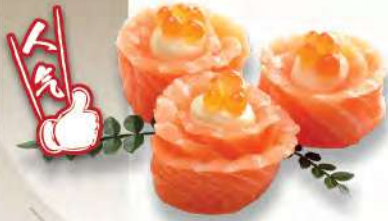
MK 01 サーモン寿司丸 Salmon Hana $6.39 Salmon with mayonnaise and salmon roe