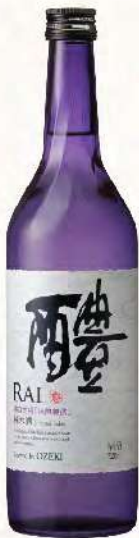
B 23 大関 純米ライ Ozeki Rai Junmai $54.0 SMV: +2 15-16% Alc VoL 720ml Pref: Hyogo