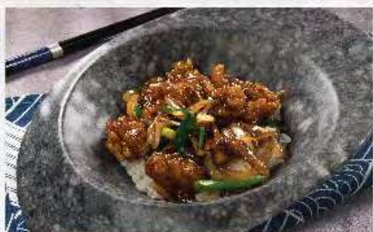
PD 09 焼肉焼きチキン丼 Teriyaki Chicken Don $12.0 Teriyaki chicken and onions on premium Vitamin E enriched Japanese rice