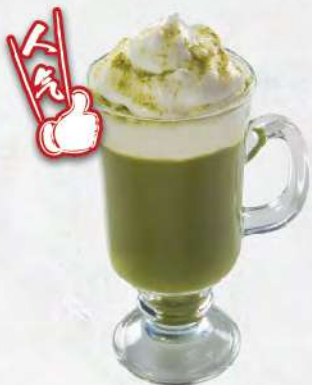
B 12 抹茶マキアート Matcha Macchiato $5.5 Hot ceremonial grade tea with rich, smooth vanilla foam