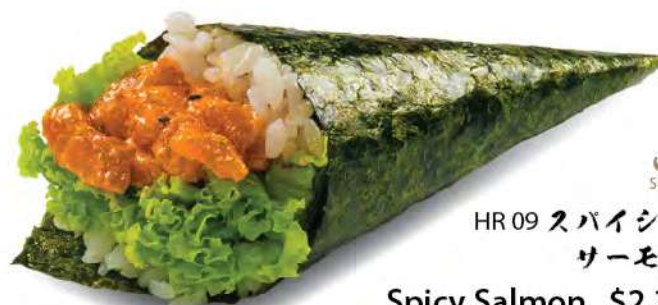
HR09 スパイシー サーモン Spicy Salmon $2.39