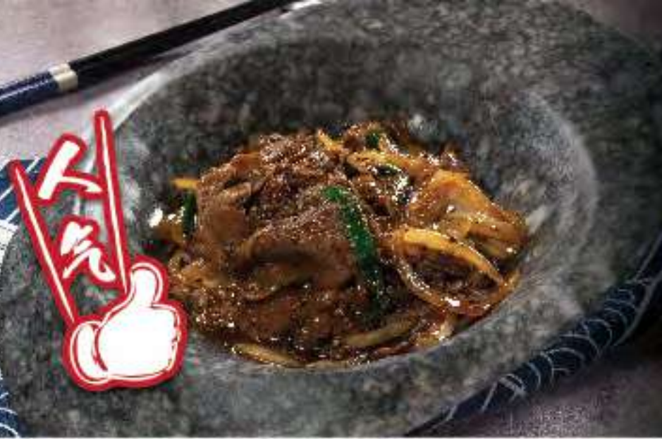
PD 05 牛肉焼肉焼き丼 Gyu Teriyaki Don $15.0 Simmered teriyaki beef slices on premium Vitamin E enriched Japanese rice