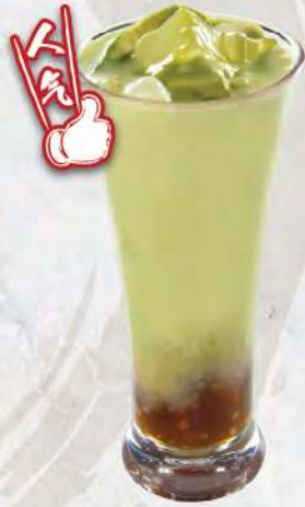
B 01 アボカド・ラテ Avocado Latte $4.5 Creamy avocado latte with earl grey jelly bits and sago