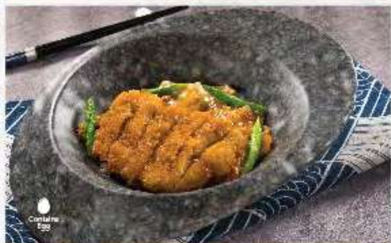
PD 11 鶏カツ丼 Chicken Katsu Don $12.0 Crispy breaded chicken cutlet with egg and onion on premium Vitamin E enriched Japanese rice