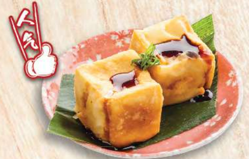
SO 12 豆腐 Fried Tofu $2.39 Fried beancurd with teriyaki sauce