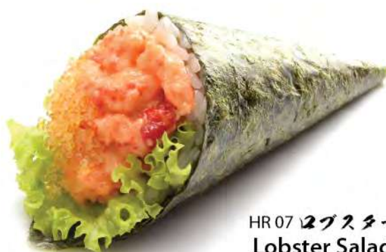
HR07 ロブスターサラダ Lobster Salad $4.39 Seasoned lobster salad with golden flying fish roe