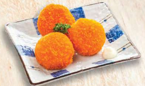
SO 15 帆立フライ Fried Hotate $2.39 Breaded scallops