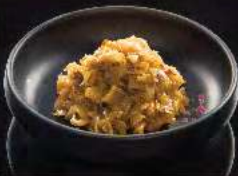
A10 中華ホタテ Chuka Hotate $4.39 Seasoned scallop