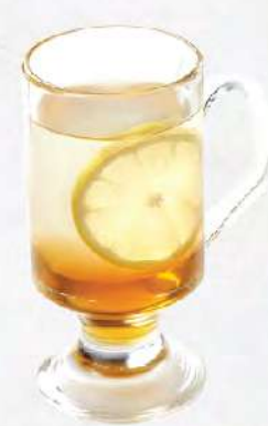
B 15 はちみつレモン(温/冷) Hot/Iced Honey Lemon $4.0 Honey lemon