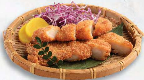
AM 06 チキンカツ Chicken Katsu $10.0

Crispy chicken cutlet with tonkatsu sauce