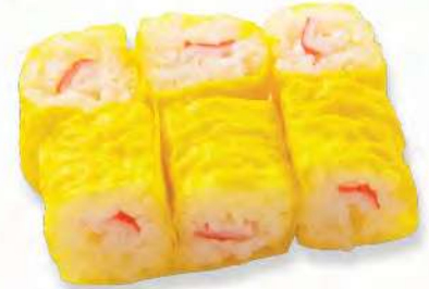
MK 06 カニ大豆 Kani Soybean $2.39 Crabstick in yellow soybean