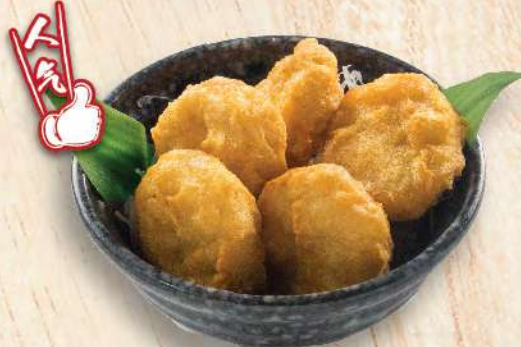
SO 11 チキンナゲット Chicken Nuggets $4.0