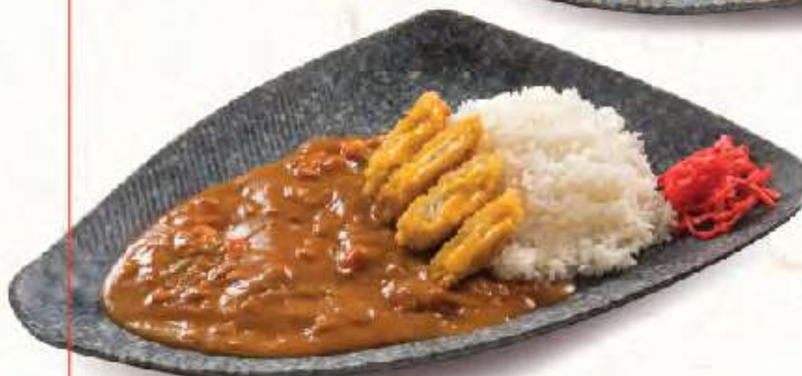
CR 04 魚フライカレー Sakana Katsu Cheese Curry $14.0 Crispy breaded fish with cheese and premium Vitamin E enriched Japanese rice