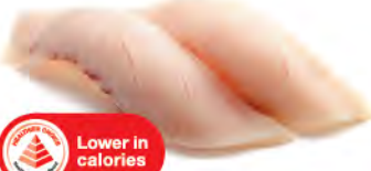
SU 09 ホッコク Hokkigai $4.39 Surf clam