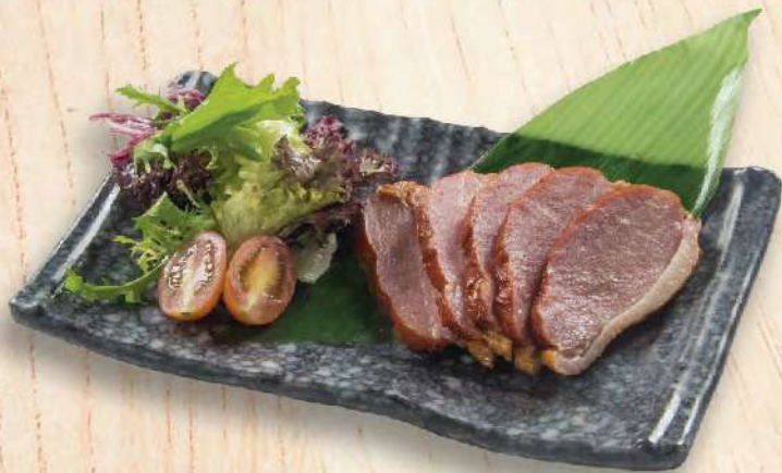
SO 03 力毛肉の煙製 Smoked Duck $4.0 Smoked duck garnished with mixed greens, cherry tomatoes and wafu sauce