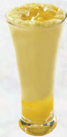
B 03 マンゴー・サゴ Mango Sago $4.5 Sweet mango blend with jelly and sago