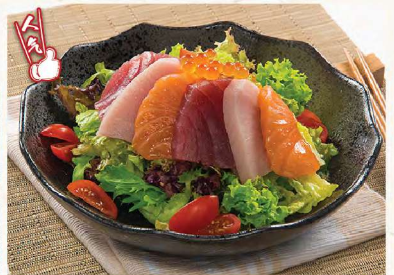
SL 03 刺身サラダ Sashimi Salad $14.0 Air-flown sashimi with assorted greens and chef's specialty sauce