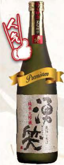
B 16 涌笑 Nanawarai Daiginjyo $120.0 (Pre-order is required) SMV: +1 15-16% Alc VoL 720ml Pref: Akita