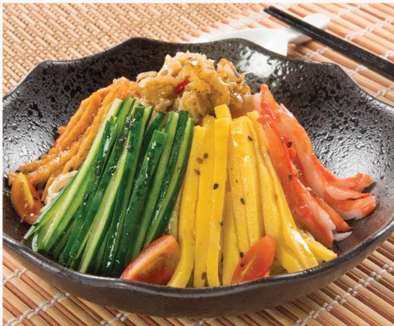
ND 06 冷やしラーメン Cold Hiyashi Ramen $12.0

Teriyaki chicken and thick wheat flour noodles in broth