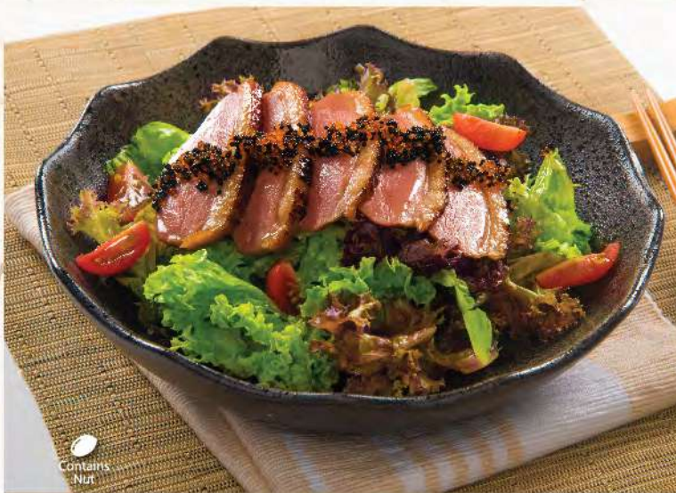
SL 04 燻製アヒルサラダ Smoked Duck Salad $9.0 Smoked duck, flying fish roe, cherry tomatoes with assorted greens and goma dressing