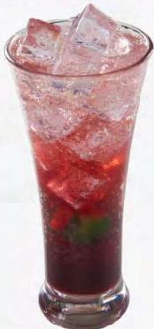
B 08 タルービー・タレーブ Groovy Grape $4.0 Fizzy soda pop bursting with fruity grape