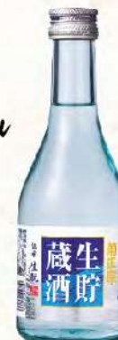
B 28 菊正宗 生貯蔵酒 Kiku-masamune $20.0 Nama Chozo SMV: +3 15-16% Alc VoL 300ml Pref: Hyogo