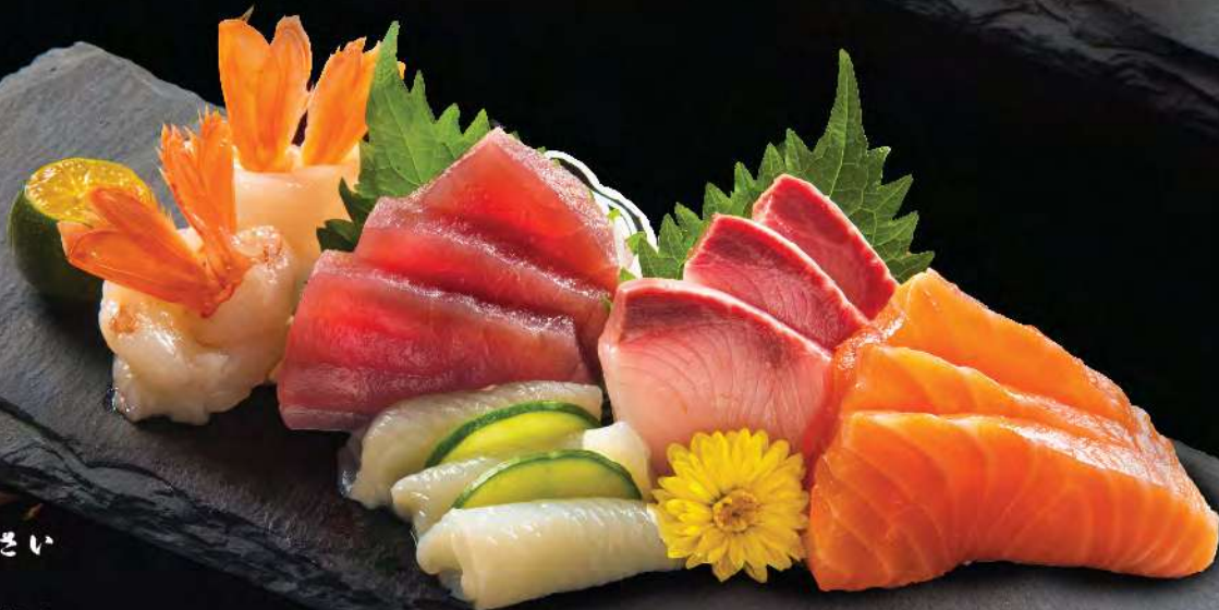
SS 02 5品お選びください Take Five $25.0 Chef's selection of assorted sashimi