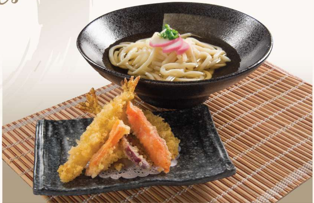
ND 02 天ぷらうどん Tempura Udon $16.0

Beef and thick wheat flour noodles in broth