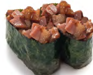
GK 11 燻製アヒル Smoked Duck $2.39