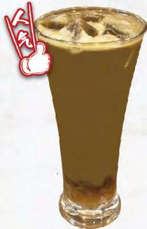
B 09 タラマラッカ・ラテ Gula Melaka Latte $4.5 Palm sugar latte with earl grey jelly bits and sago