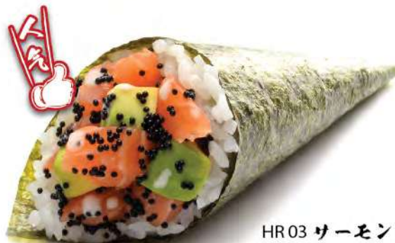
HR03 サーモンアボカド Salmon Avocado $4.39 Salmon and avocado