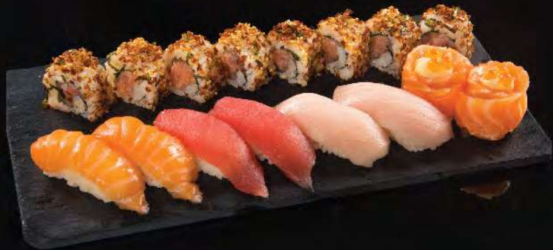
SM 03 漁夫の釣り針 Fisherman's hook $22.0 Assorted selection of fresh seafood on sushi rice