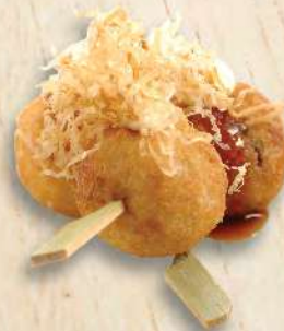
SO 17 たこ焼き Takoyaki $2.39 Octopus ball