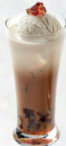
B 11 コーヒー フロート Coffee Float $4.5 Ice coffee float