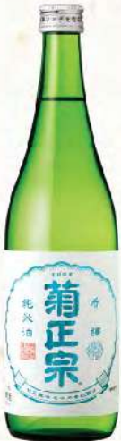
B 19 菊正宗 香醇 純米酒 Kiku Masamune $66.0 Koujyo Junmai SMV: -2 15-16% Alc VoL 720ml Pref: Hyogo