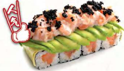
MK 05 サーモンアボカド Salmon Avocado $7.0 Salmon, avocado, black flying fish roe, cheese and caesar sauce