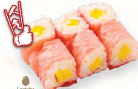
Contains Egg MK 08 たまご大豆 Tamago Soybean $2.39 Tamago in pink soybean