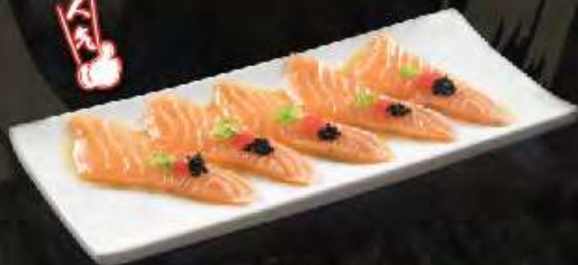
A07 サーモン カルパッチョ Salmon Carpaccio $8.0 Salmon topped with flying fish roe, spring onions and tangy yuzu sauce