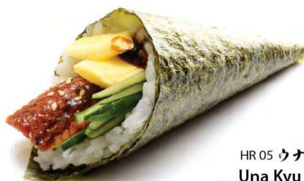
HR05 ウナキュー Una Kyu $4.39 Grilled river eel and cucumber