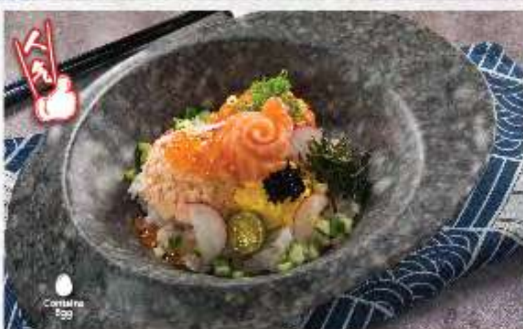
PD 08 桜丼 Sakae Don $17.0 Fresh salmon slices, salmon roe, egg mayonnaise, diced cucumbers on premium Vitamin E enriched sushi rice