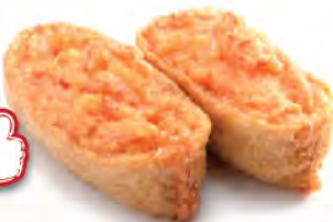
SU 21 ロブスターサラダイナリ Lobster Salad Inari $6.39 Seasoned lobster salad sweet beancurd sushi