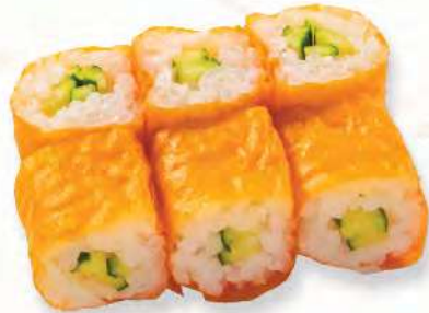
MK 07 カッパ大豆 Kappa Soybean $2.39 Cucumber in orange soybean