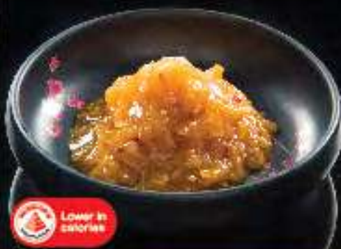
A12 中華クラゲ Chuka Kurage $4.39 Seasoned jellyfish