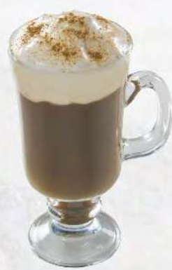
B 13 ほうじ茶マキアート Hojicha Macchiato $5.5 Hot green tea with rich, smooth vanilla foam