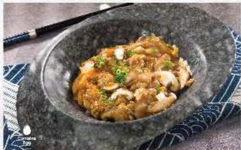
PD 13 親子丼 Oyako Don $11.0 Simmered chicken with egg and onion on premium Vitamin E enriched Japanese rice