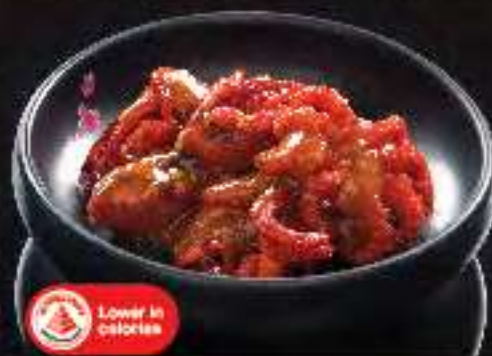
A11 中華イダコ Chuka Idako $4.39 Seasoned baby octopus