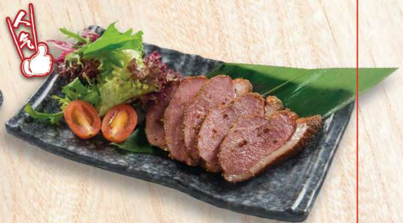
SO 02 バストラミ・ダック Pastrami duck $4.0 Black pepper smoked duck garnished with mixed greens, cherry tomatoes and wafu sauce