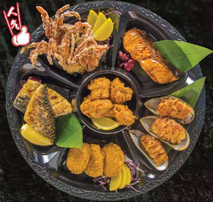
MP 03 栄風おつまみの盛り合わせ2 Sakae Snack Platter 2 $55.0