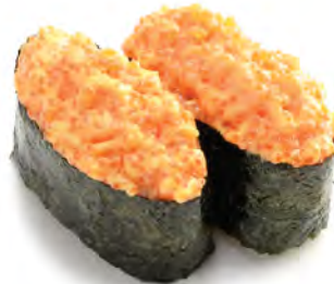
GK 04 トビッコチーズ Tobikko Cheese $4.39 Flying fish roe with cheese