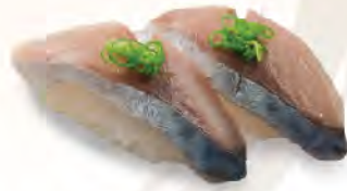
SU 01 しめ鯖 Shime Saba $4.39 Marinated mackerel