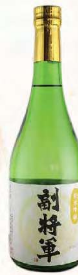
B 25 副将軍純米吟醸 Fuku Shogun $58.0 Junmai Ginjyo SMV: +3 15-16% Alc VoL 720ml Pref: Ibaraki