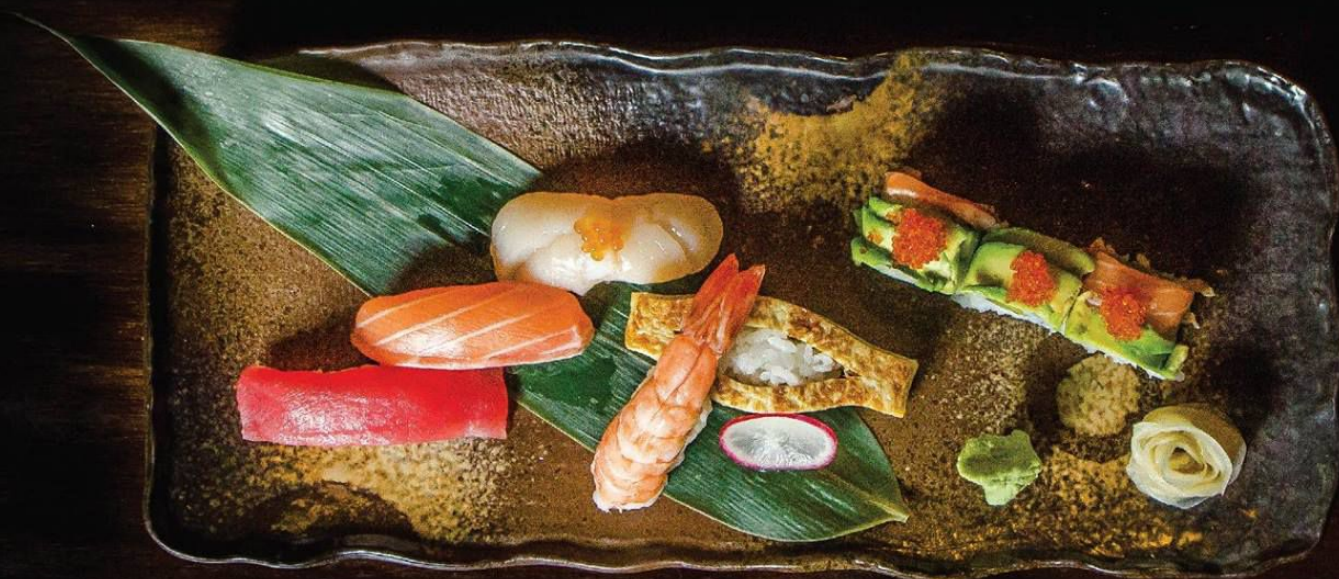
Nigiri Sushi Platter (small)