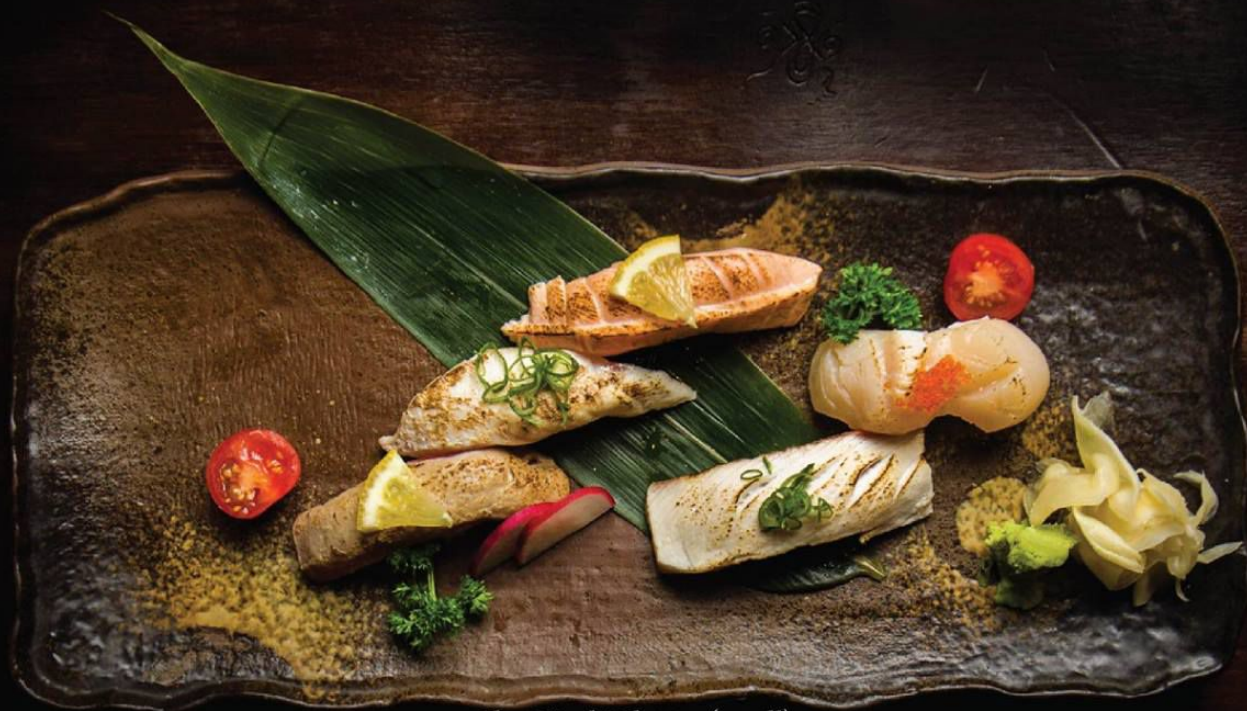
Aburi Sushi Platter (small)