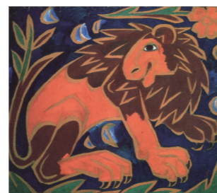
Left: spinning wheel, 19 th century Right: 'Lion' by N. Goncharova, 1911