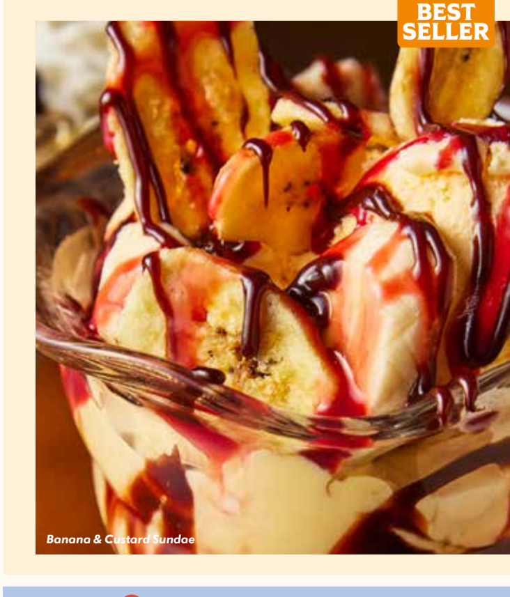
Banana & Custard Sundae

There's always room for pud. Treat yourself to something chocolate, something fruity or maybe just a few scoops of classic vanilla.