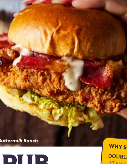
The Buttermilk Ranch

All served in a soft glazed bun with lettuce, onion and gherkin, dished up with a side of skin-on fries. (Unless otherwise stated)