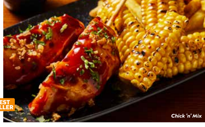
Chick 'n' Mix

Crispy breaded chicken and curry sauce with rice (925 kcal) or chips (964 kcal), peas and spring onions. Make it Veggie 733 kcal or Vegan 694 kcal