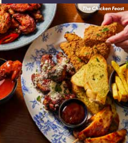
The Chicken Feast

Chicken & Waffle Fries SMALL 7.00 LARGE 10.00 Chicken goujons, bacon flavour bits, cheese sauce, maple flavoured syrup and crispy onions. 664 kcal / 1380 kcal (Large portions recommended for 2)