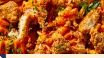
Chicken & Waffle Fries