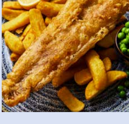
Hand-Battered Fish & Chips