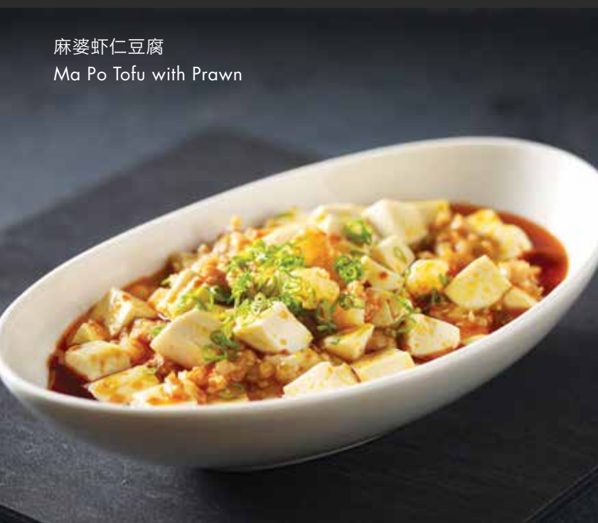
麻婆虾仁豆腐 Ma Po Tofu with Prawn