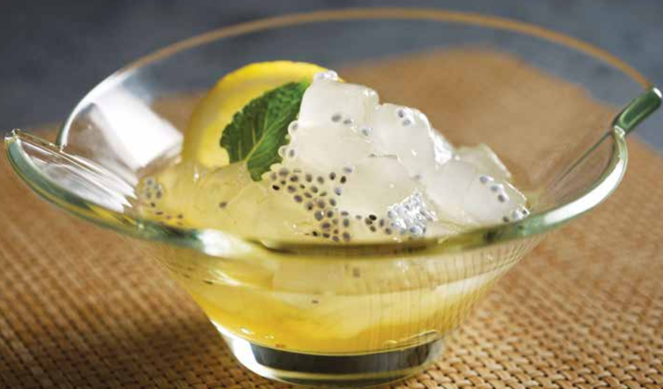
冰冻柠檬芦荟 Chilled Aloe Vera in Lemonade