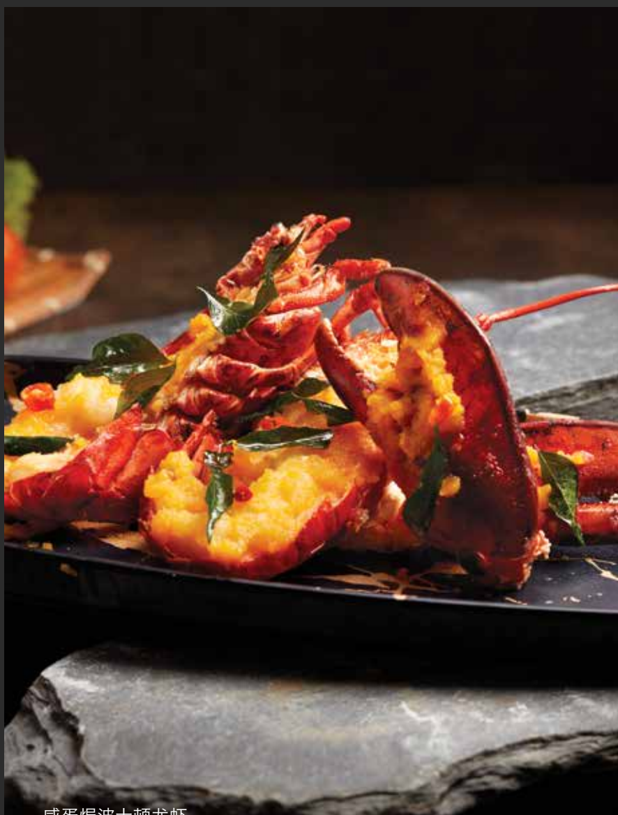
咸蛋焗波士顿龙虾 Boston Lobster tossed with Salted Egg Yolk