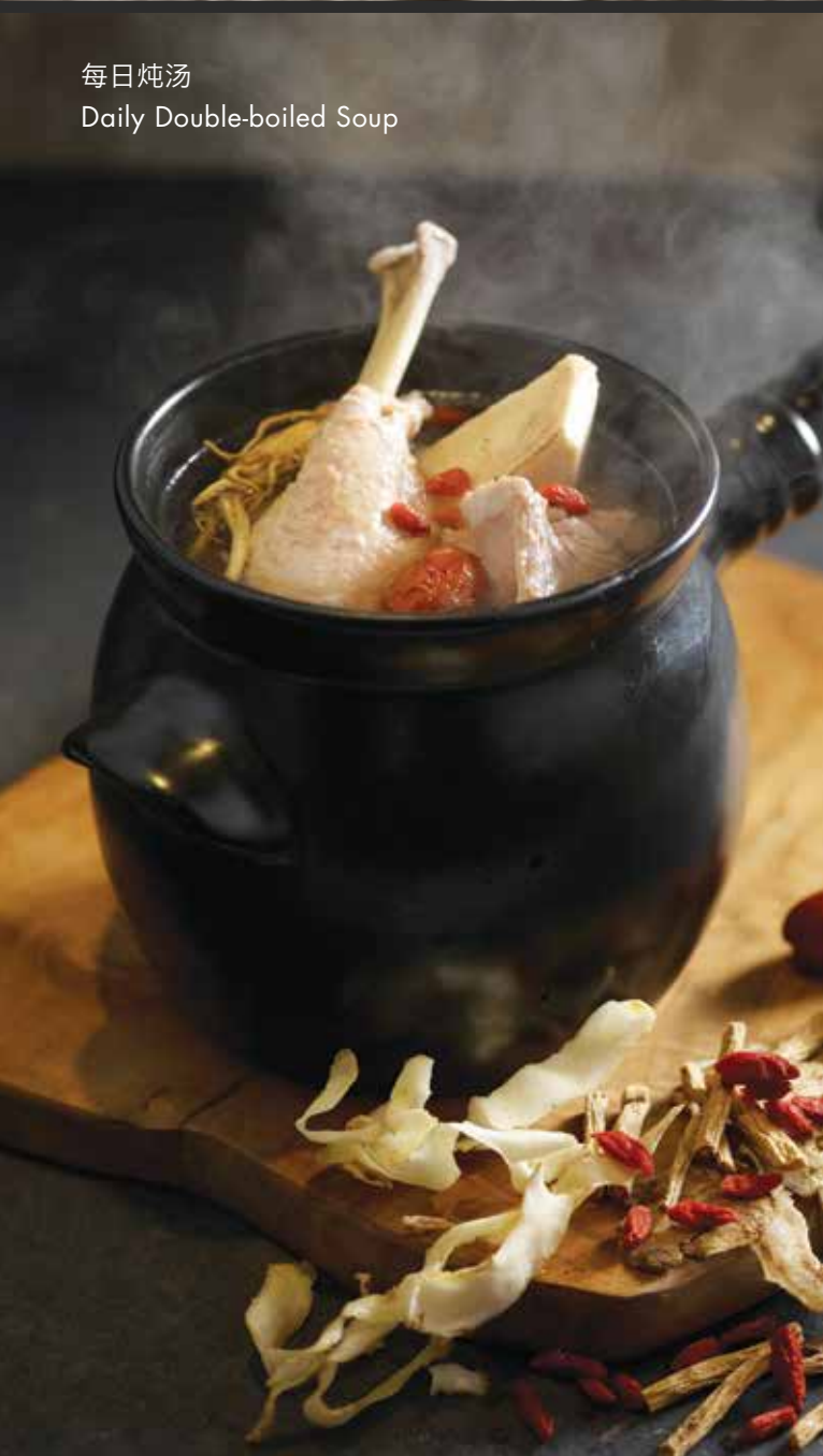
每日炖汤 Daily Double-boiled Soup