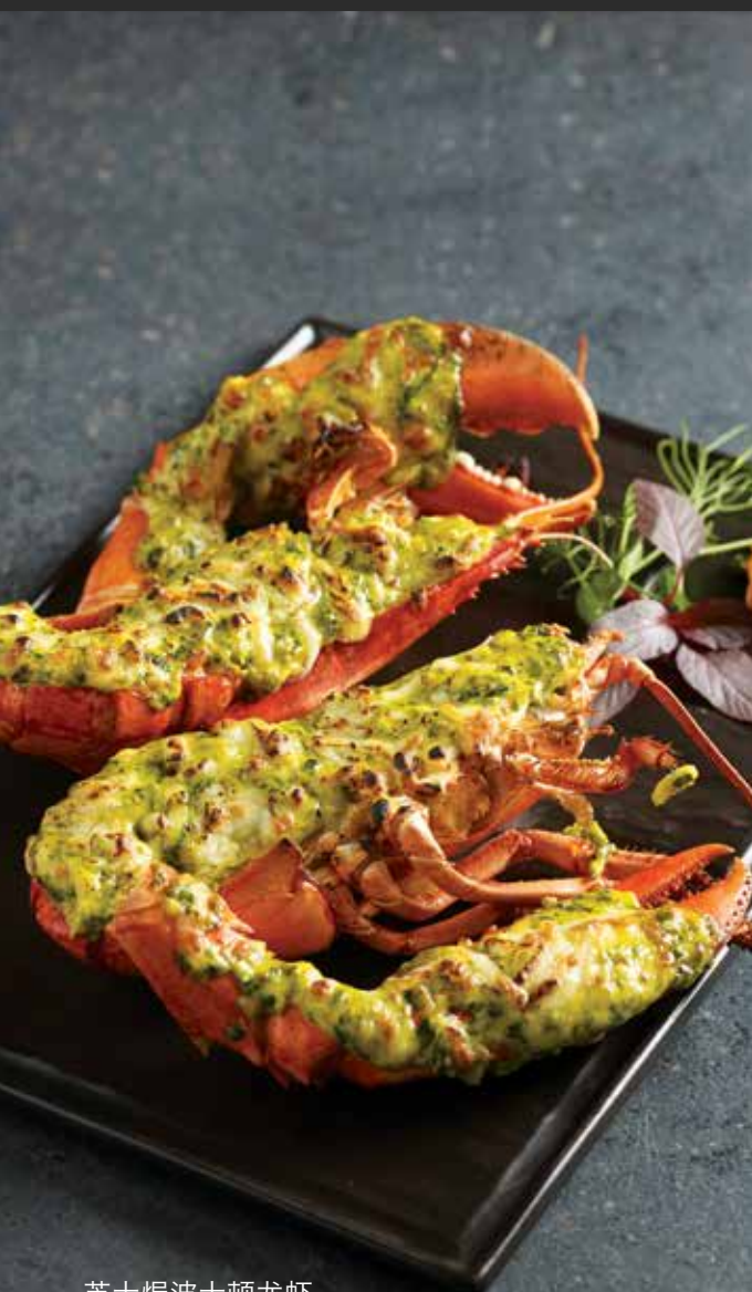
芝士焗波士顿龙虾 Baked Boston Lobster with Cheese