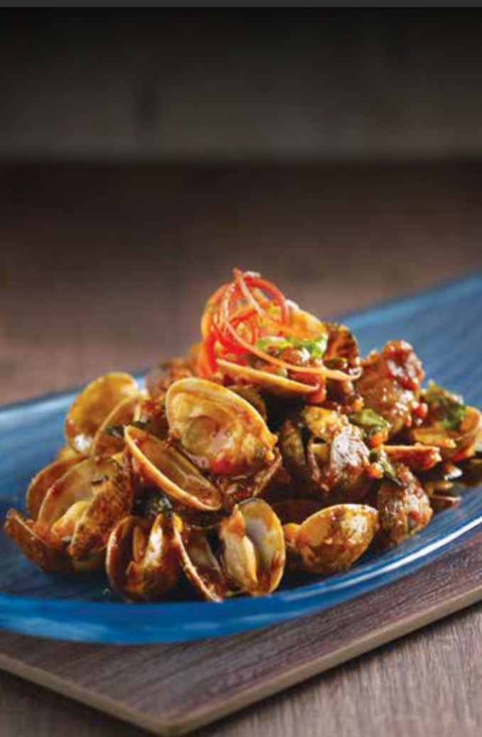
甘香炒日本龙牙蚌 Stir-fried Japanese Live Clam with Spicy Garlic Sauce