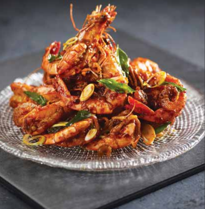
甘香炒老虎虾 Stir-fried Tiger Prawn with Spicy Garlic Sauce