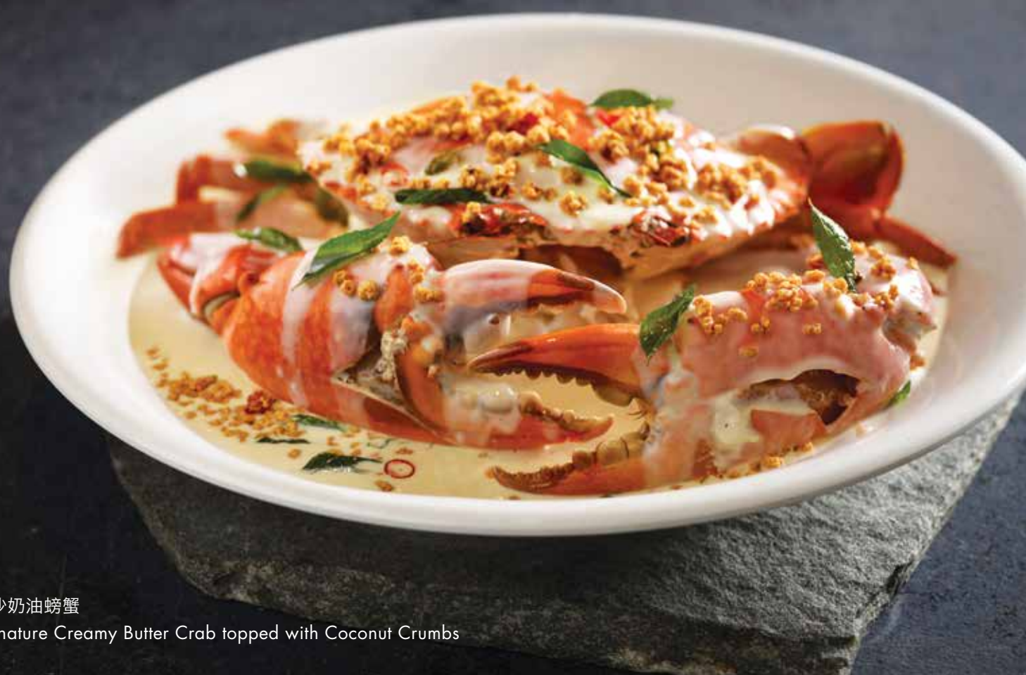
金沙奶油螃蟹 Signature Creamy Butter Crab topped with Coconut Crumbs