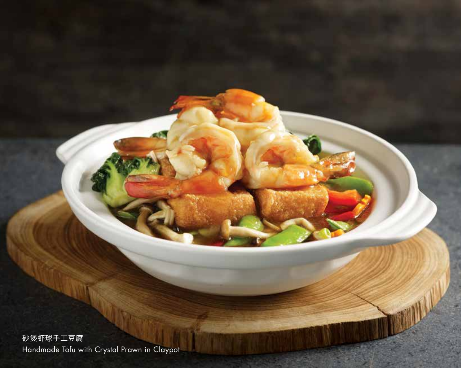
砂煲虾球手工豆腐 Handmade Tofu with Crystal Prawn in Claypot