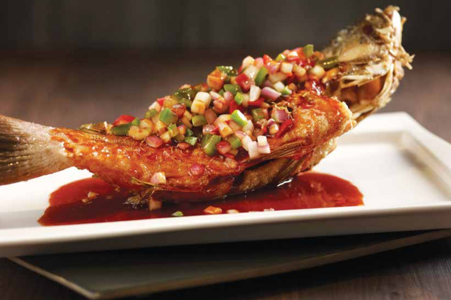
糖醋炸西星斑 Deep-fried Star Grouper in Sweet and Sour Sauce