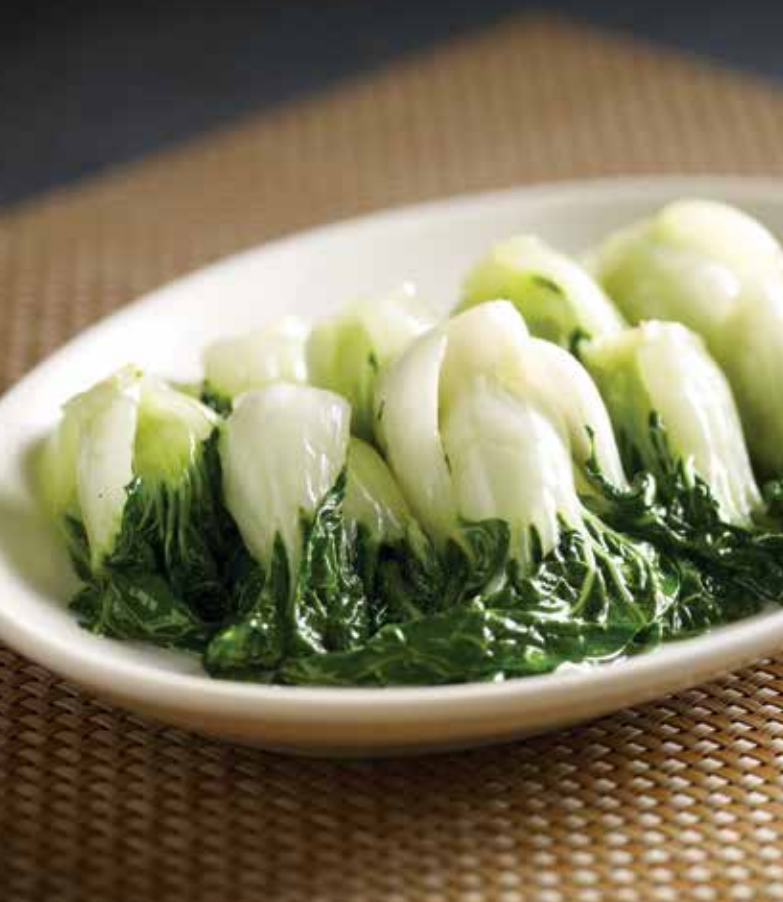
白灼奶白菜 Poached Baby Cabbage