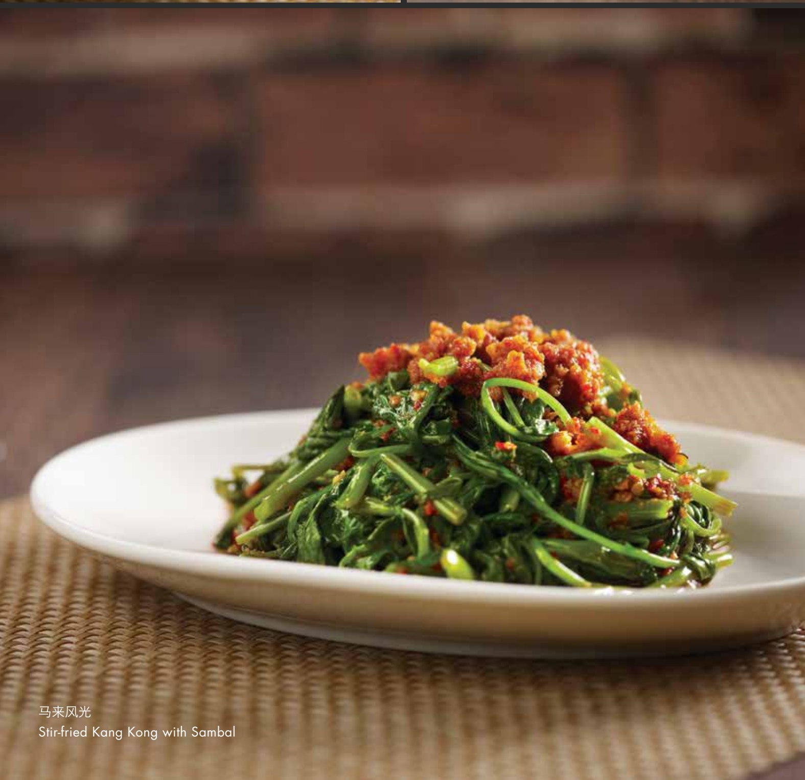
马来风光 Stir-fried Kang Kong with Sambal