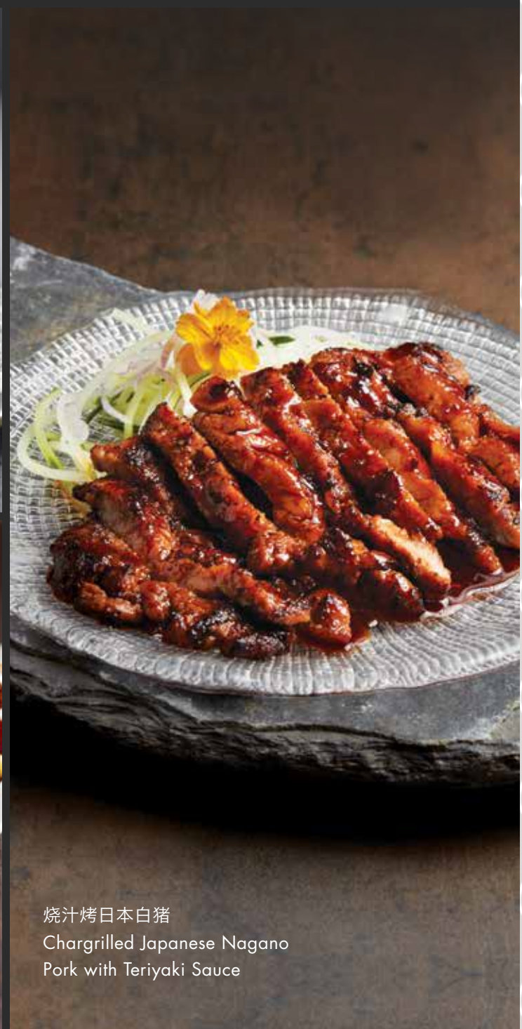
烧汁烤日本白猪 Chargrilled Japanese Nagano Pork with Teriyaki Sauce