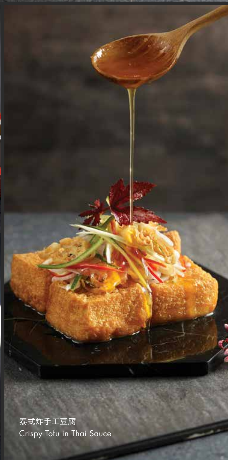
泰式炸手工豆腐 Crispy Tofu in Thai Sauce