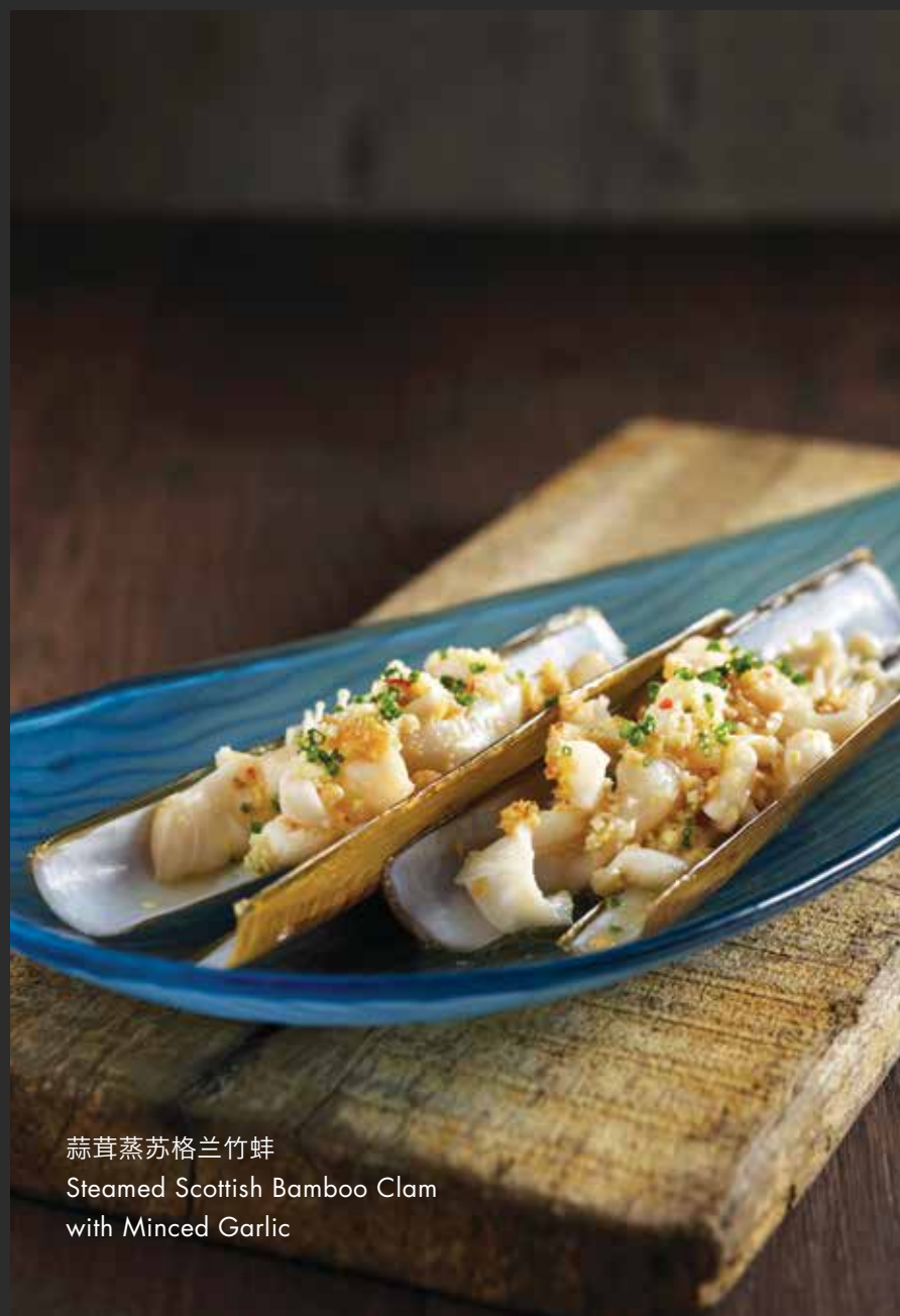
蒜茸蒸苏格兰竹蚌 Steamed Scottish Bamboo Clam with Minced Garlic