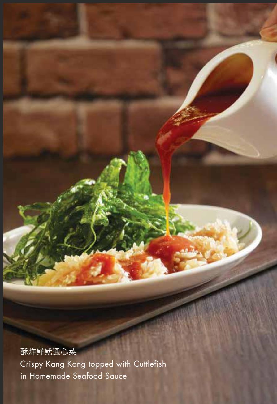
酥炸鲜鱿通心菜 Crispy Kang Kong topped with Cuttlefish in Homemade Seafood Sauce