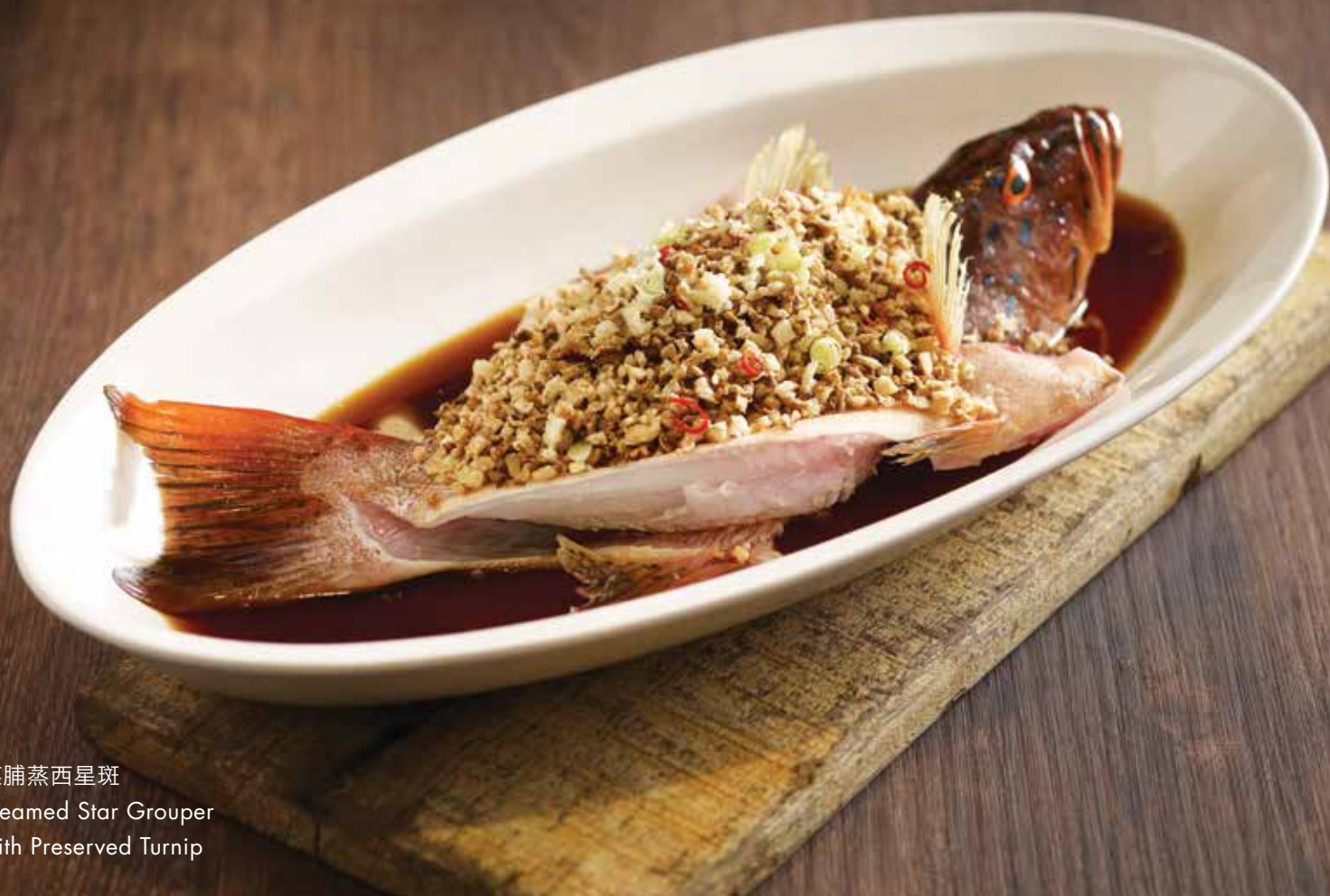
菜脯蒸西星斑 Steamed Star Grouper with Preserved Turnip