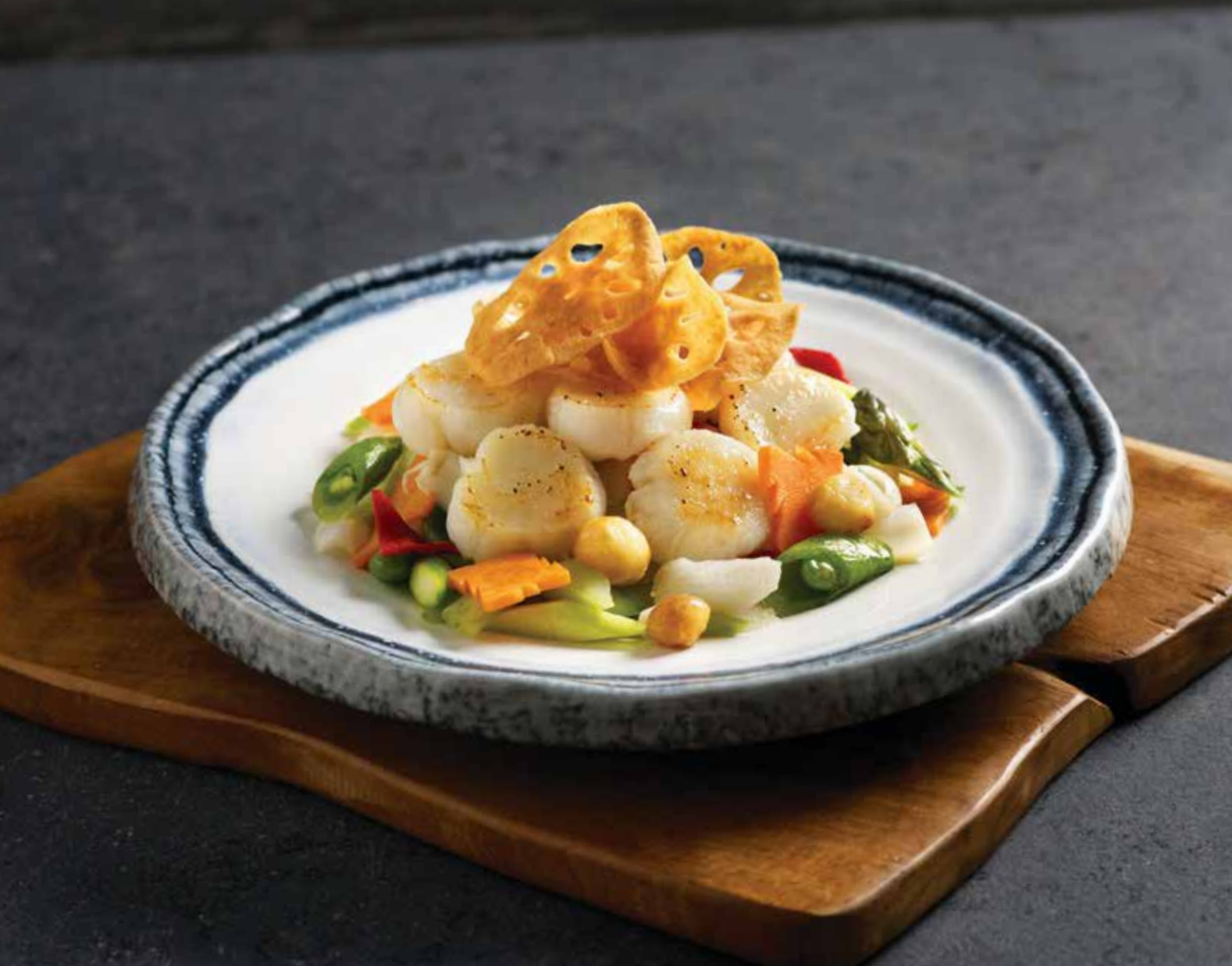
甜脆八景炒帶子 Stir-fried Assorted Vegetable with Scallop