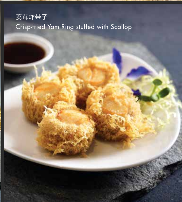
荔茸炸带子 Crisp-fried Yam Ring stuffed with Scallop