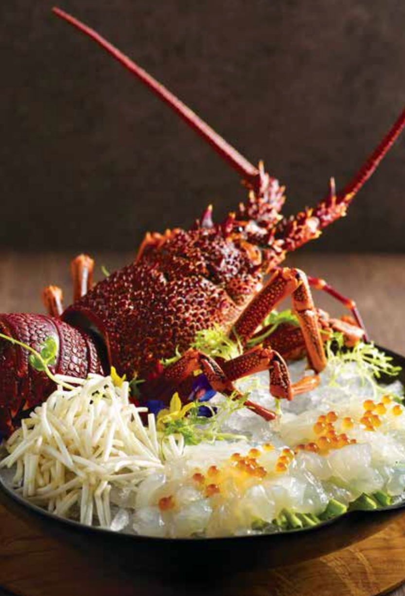
澳洲龙虾刺身 Australian Lobster Sashimi