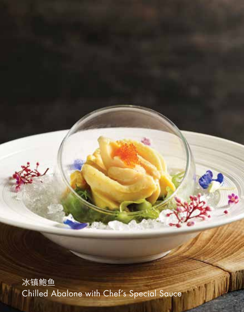
冰镇鲍鱼 Chilled Abalone with Chef's Special Sauce