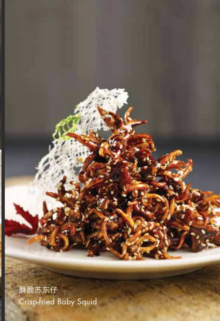
酥脆苏东仔 Crisp-fried Baby Squid