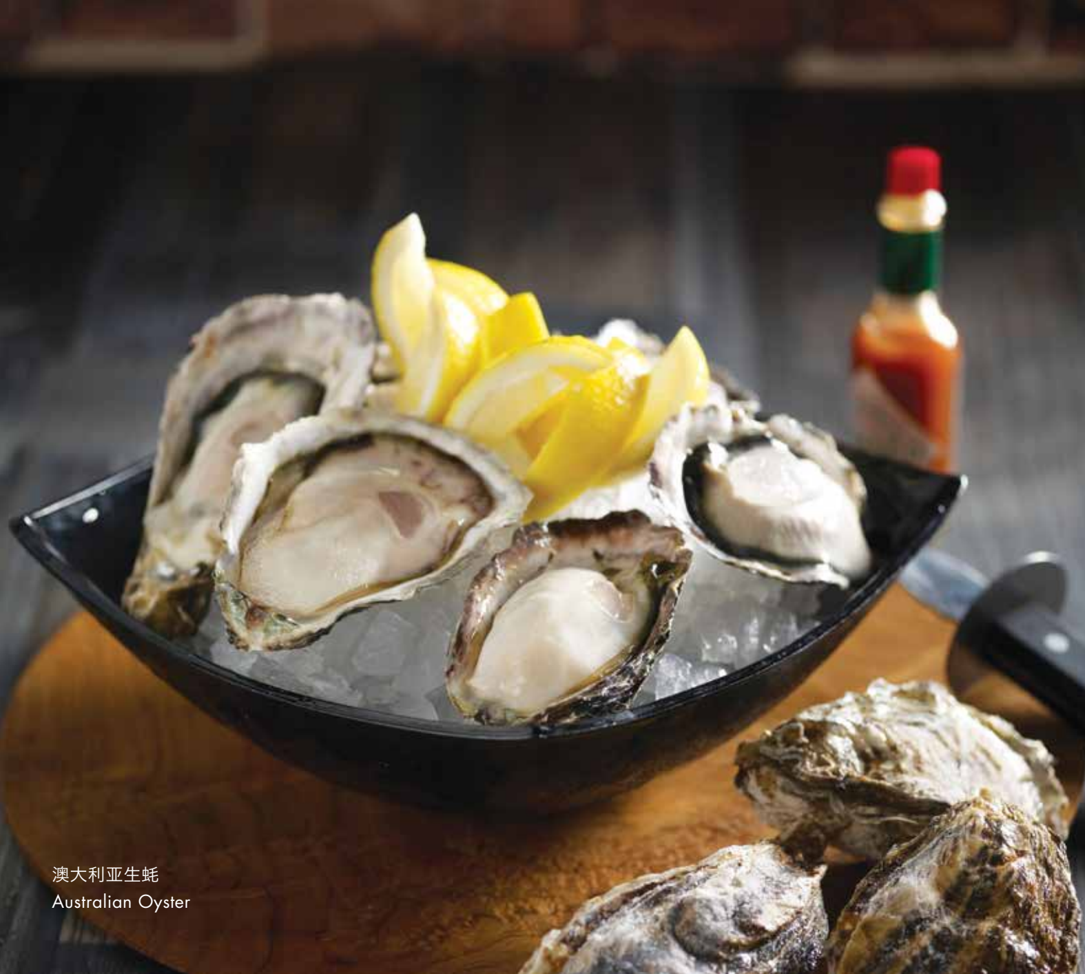
澳大利亚生蚝 Australian Oyster