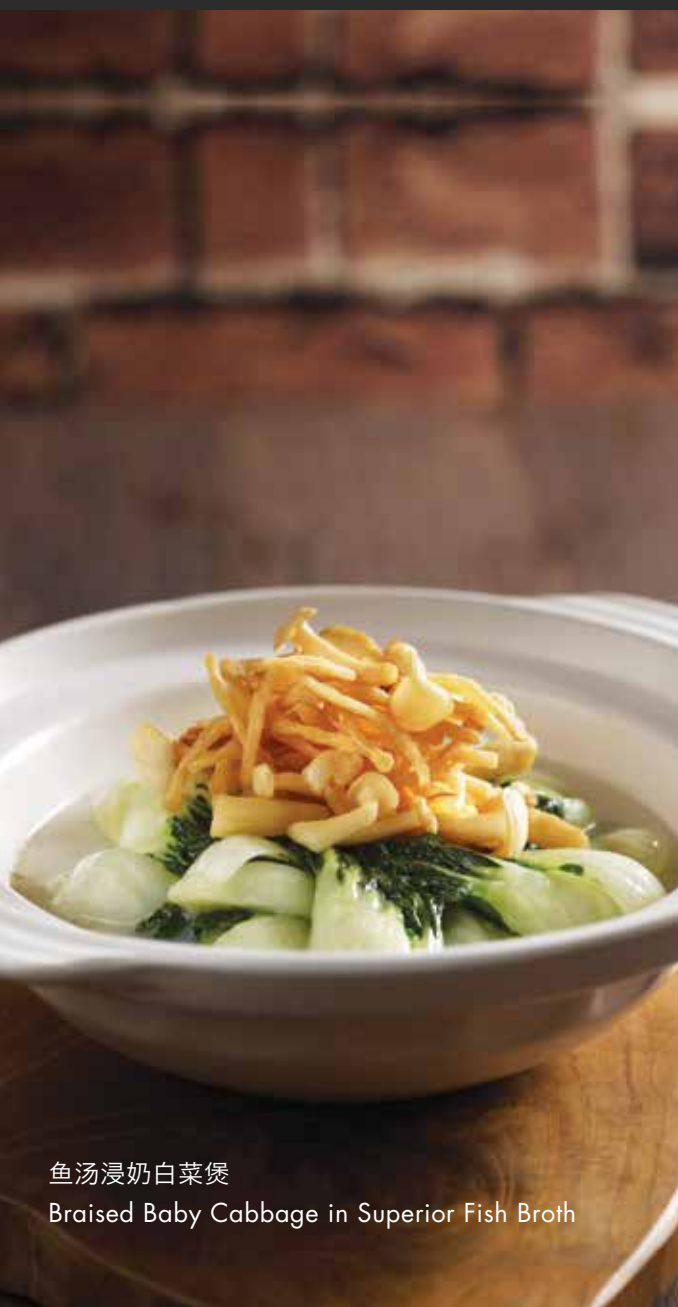
鱼汤浸奶白菜煲 Braised Baby Cabbage in Superior Fish Broth