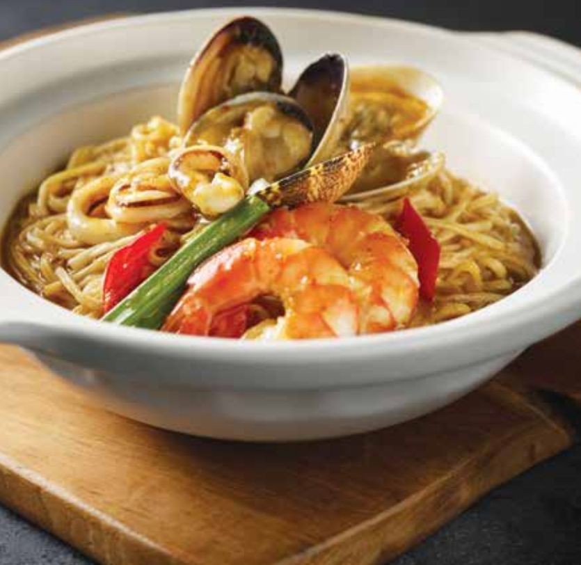
砂煲海鲜焖伊面 Stewed Ee-Fu Noodle with Seafood in Claypot