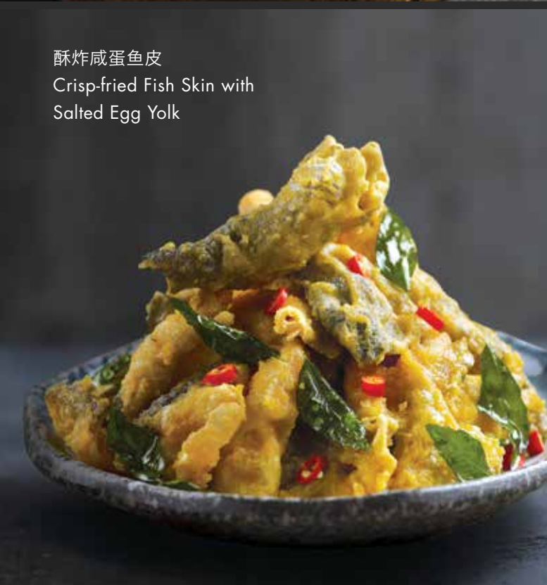
酥炸咸蛋鱼皮 Crisp-fried Fish Skin with Salted Egg Yolk