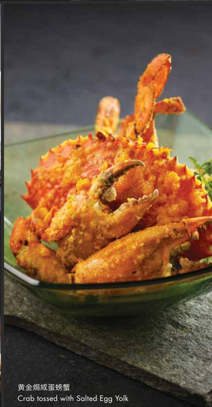
黄金焗咸蛋螃蟹 Crab tossed with Salted Egg Yolk