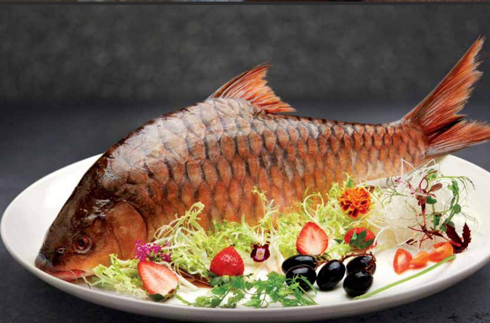
野生忘不了 Wild Empurau Fish