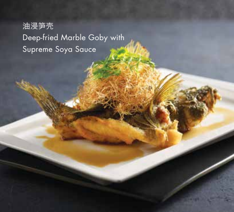
油浸笋壳 Deep-fried Marble Goby with Supreme Soya Sauce