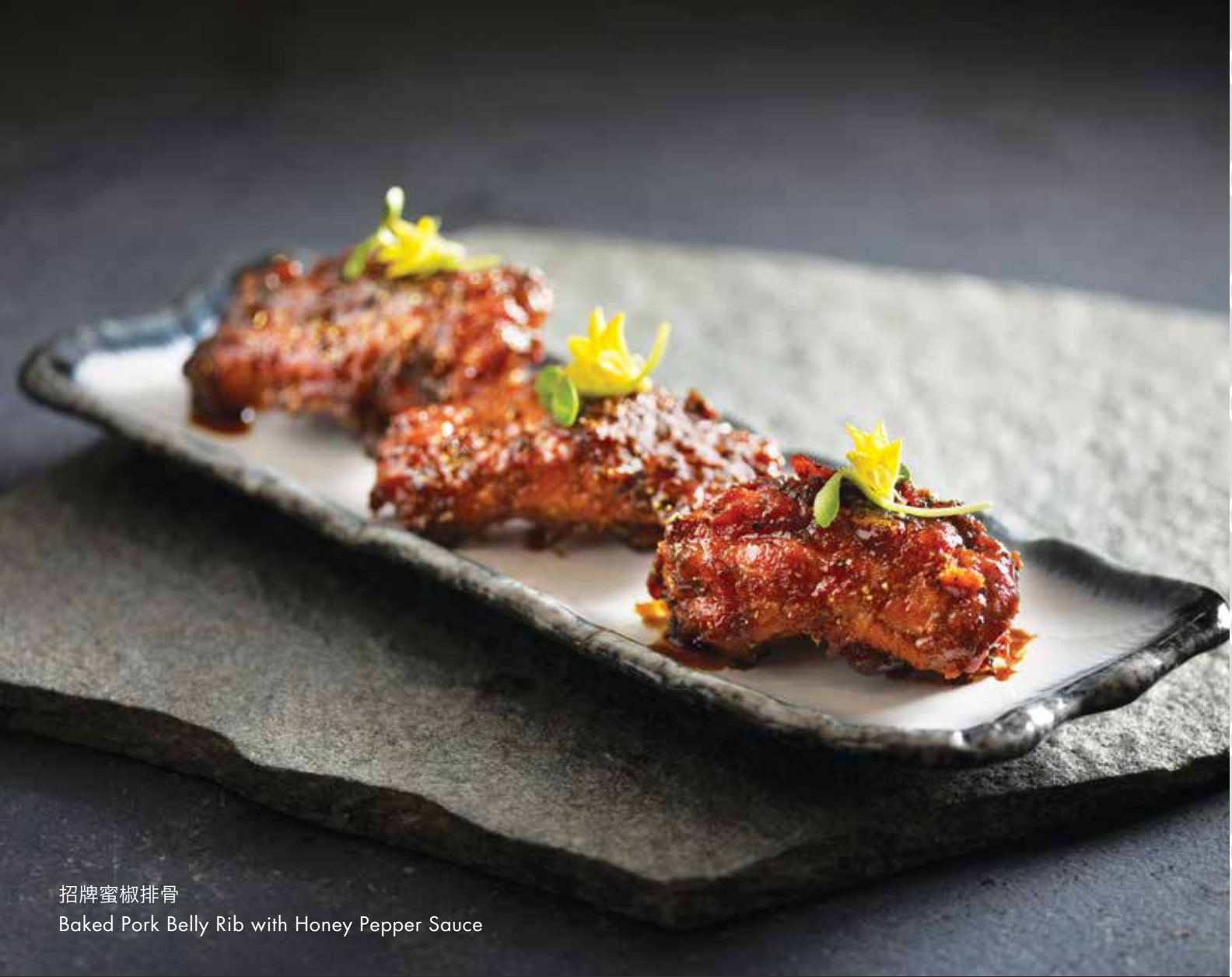
招牌蜜椒排骨 Baked Pork Belly Rib with Honey Pepper Sauce