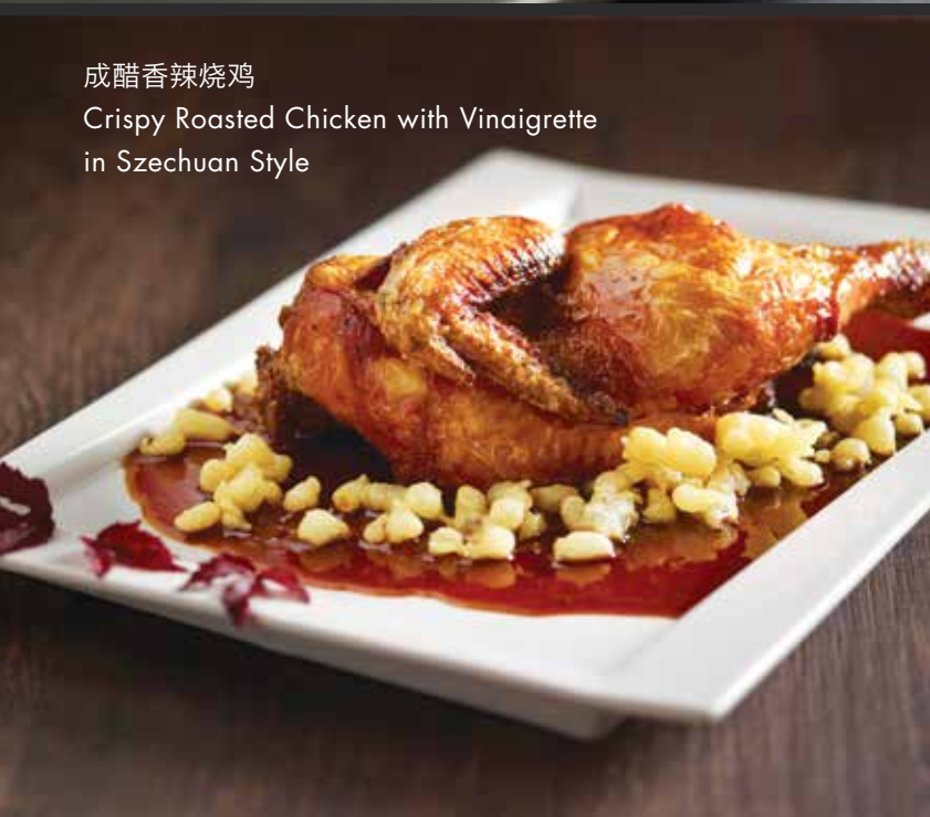
成醋香辣烧鸡 Crispy Roasted Chicken with Vinaigrette in Szechuan Style