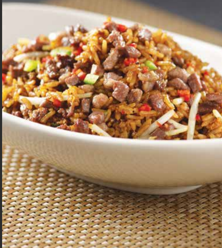
牛魔皇炒饭 Black Pepper Beef Fried Rice