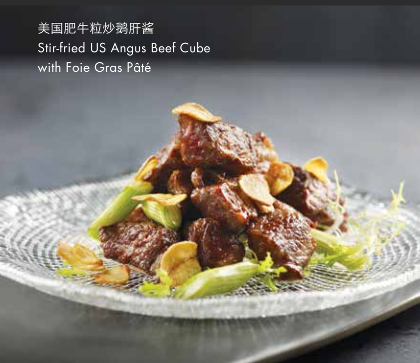
美国肥牛粒炒鹅肝酱 Stir-fried US Angus Beef Cube with Foie Gras Pâté