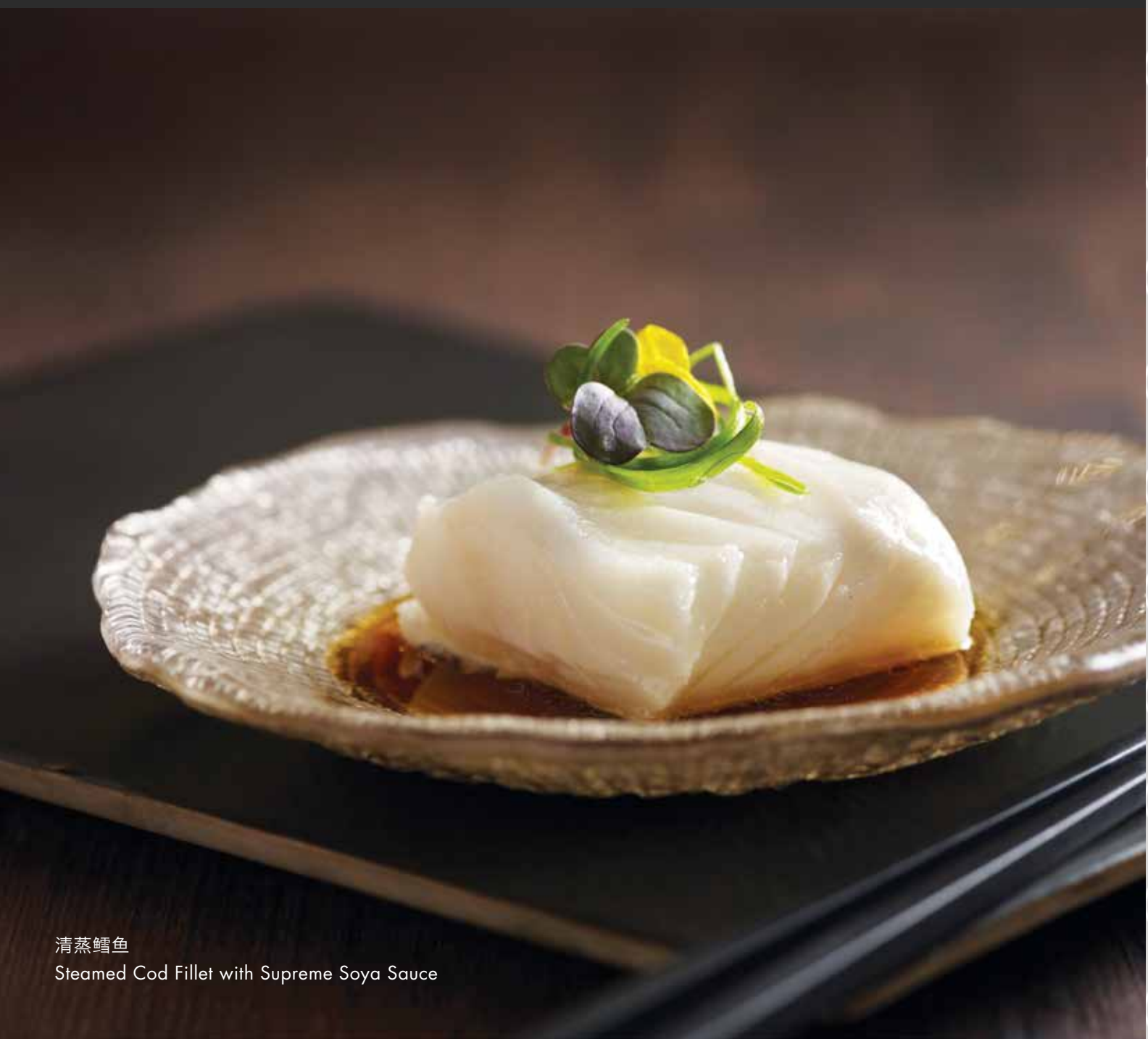
清蒸鳕鱼 Steamed Cod Fillet with Supreme Soya Sauce