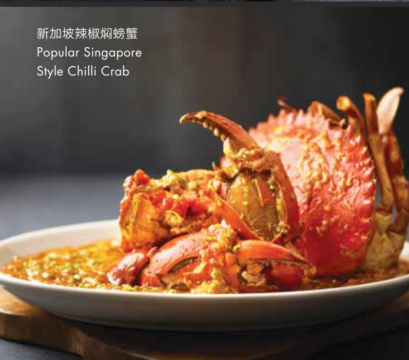
新加坡辣椒焗螃蟹 Popular Singapore Style Chilli Crab