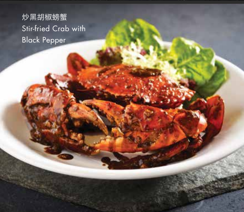
炒黑胡椒螃蟹 Stir-fried Crab with Black Pepper