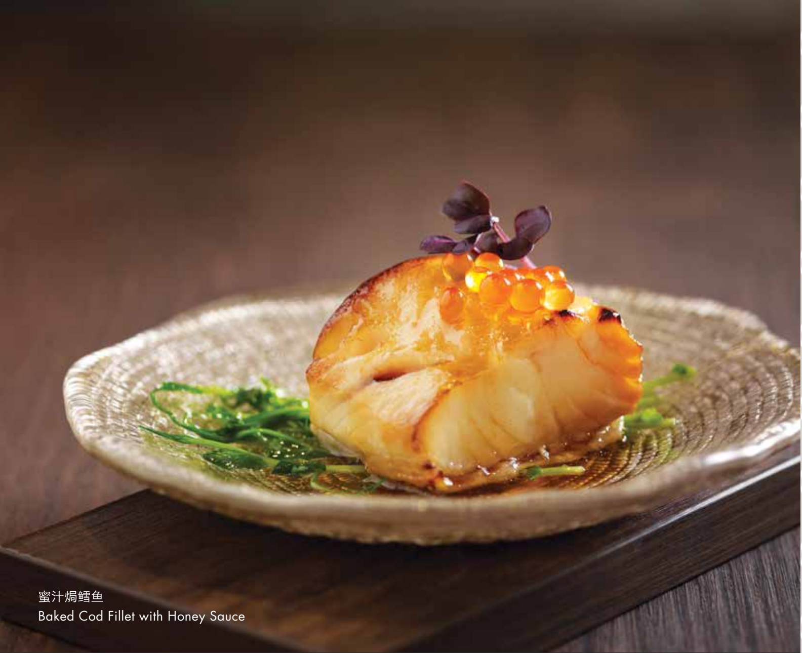
蜜汁焗鳕鱼 Baked Cod Fillet with Honey Sauce