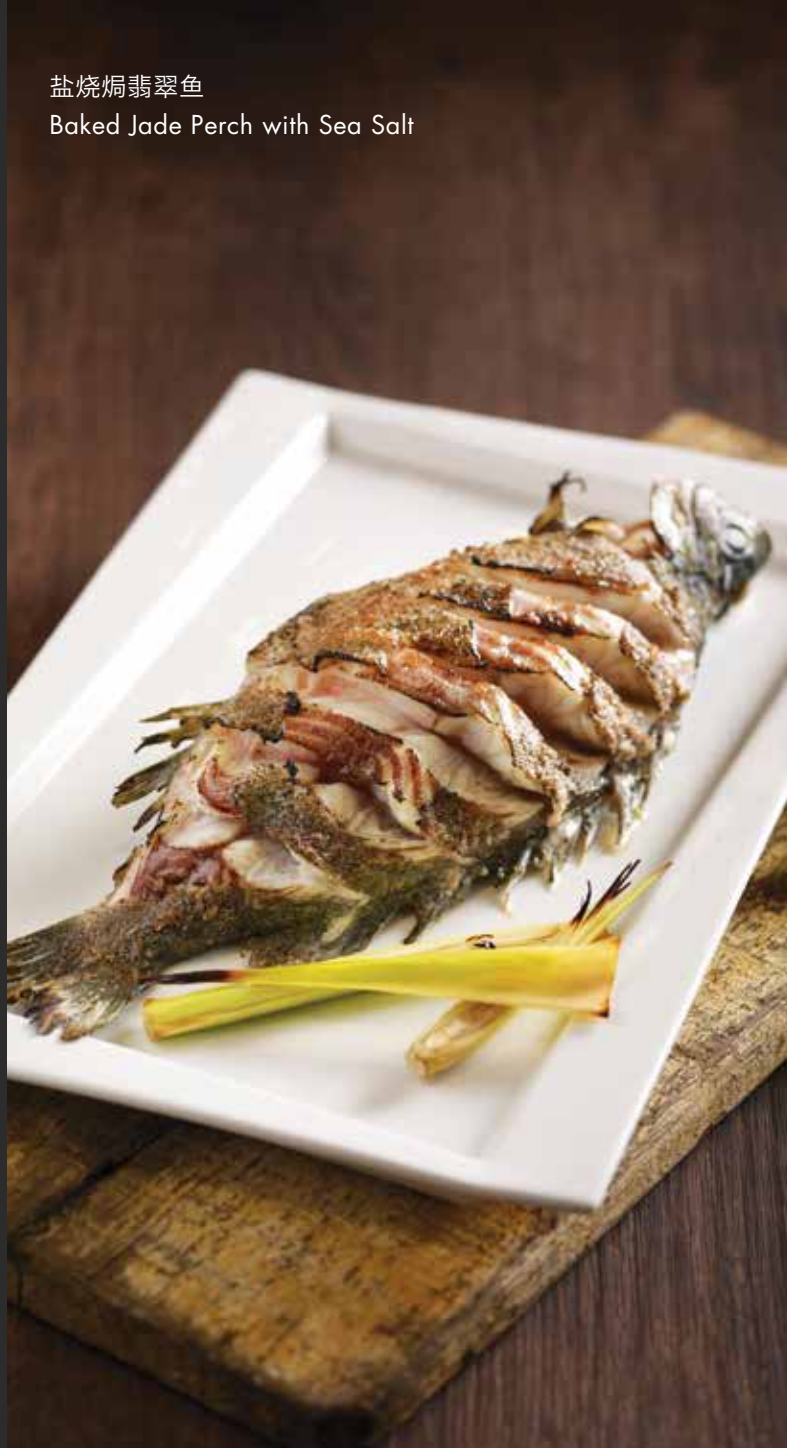
盐烧焗翡翠鱼 Baked Jade Perch with Sea Salt