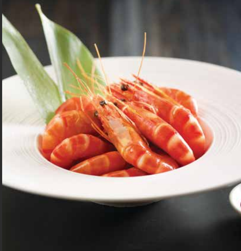
白灼老虎虾 Poached Tiger Prawn