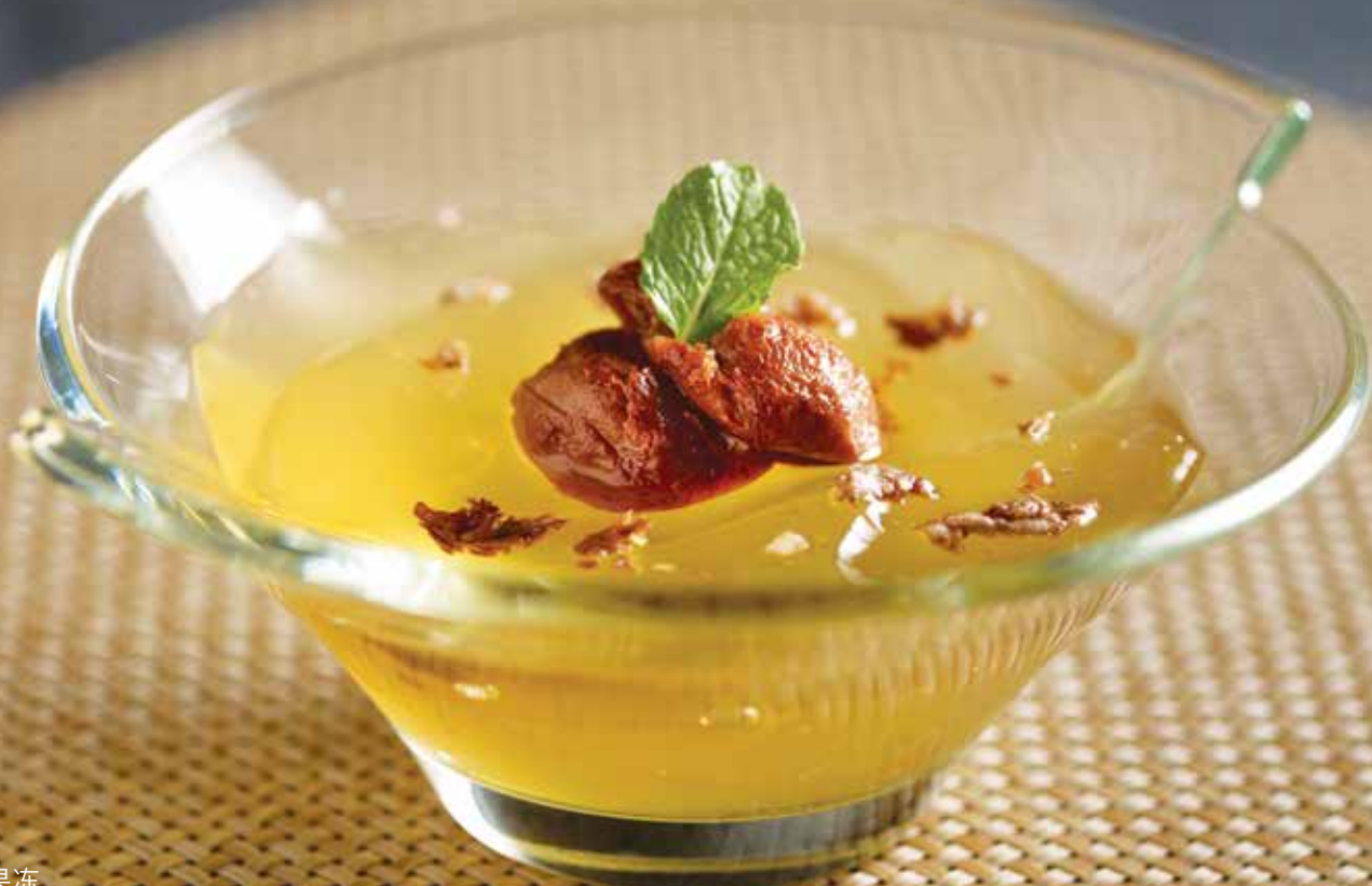
话梅香茅果冻 Chilled Lemongrass Jelly in Lemonade and Sour Plum Juice