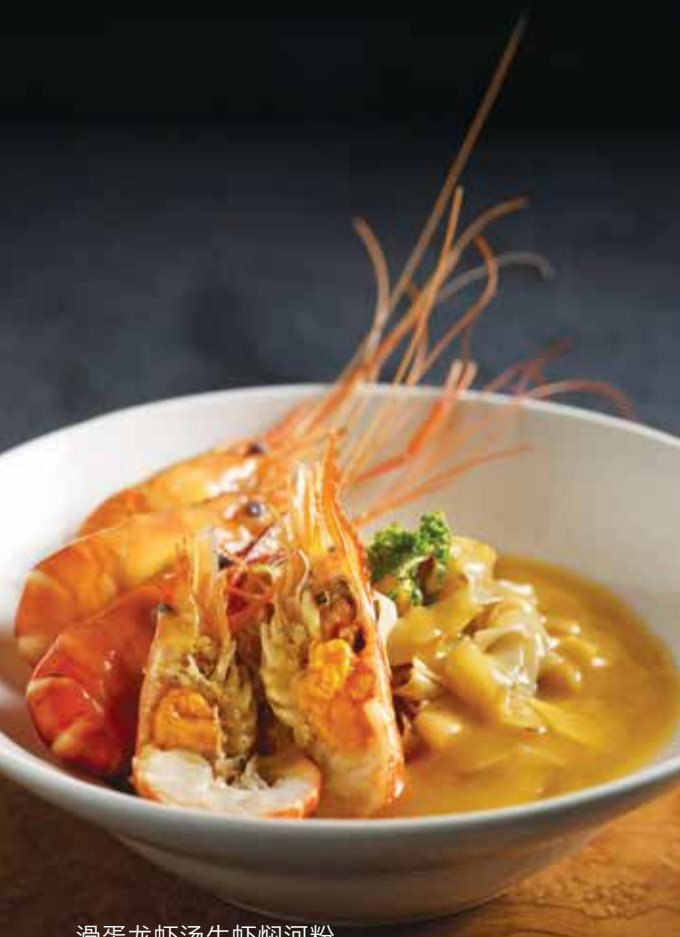
滑蛋龙虾汤生虾焖河粉 Braised Hor Fun with Prawn in Lobster Broth