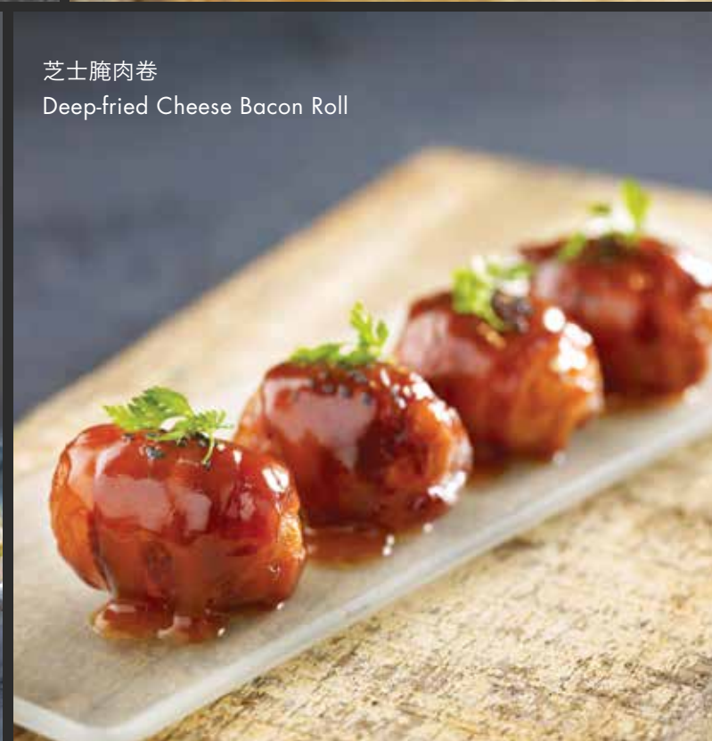
芝士腌肉卷 Deep-fried Cheese Bacon Roll