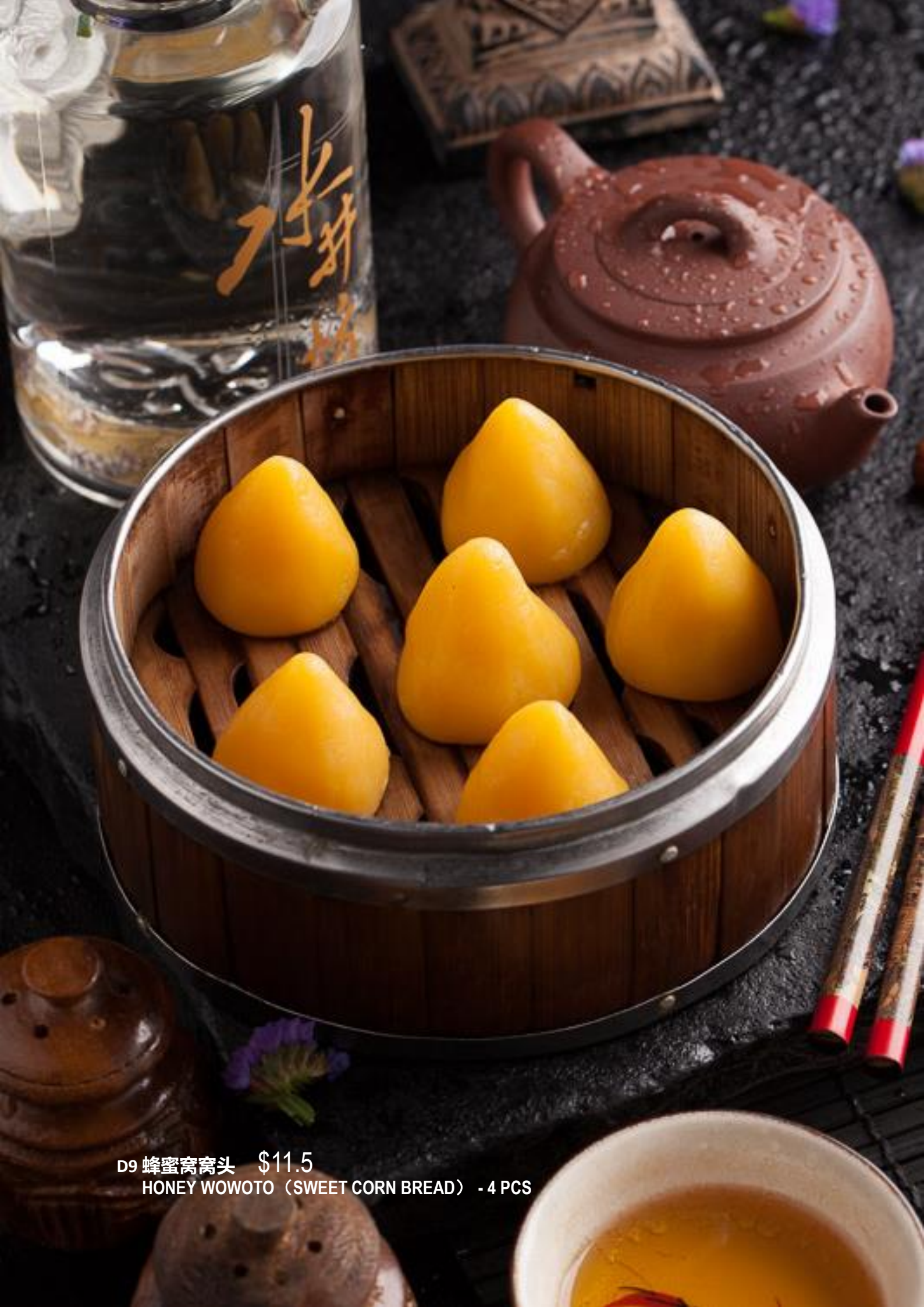
D9 蜂蜜窝窝头 $11.5 HONEY WOWOTO (SWEET CORN BREAD) - 4 PCS