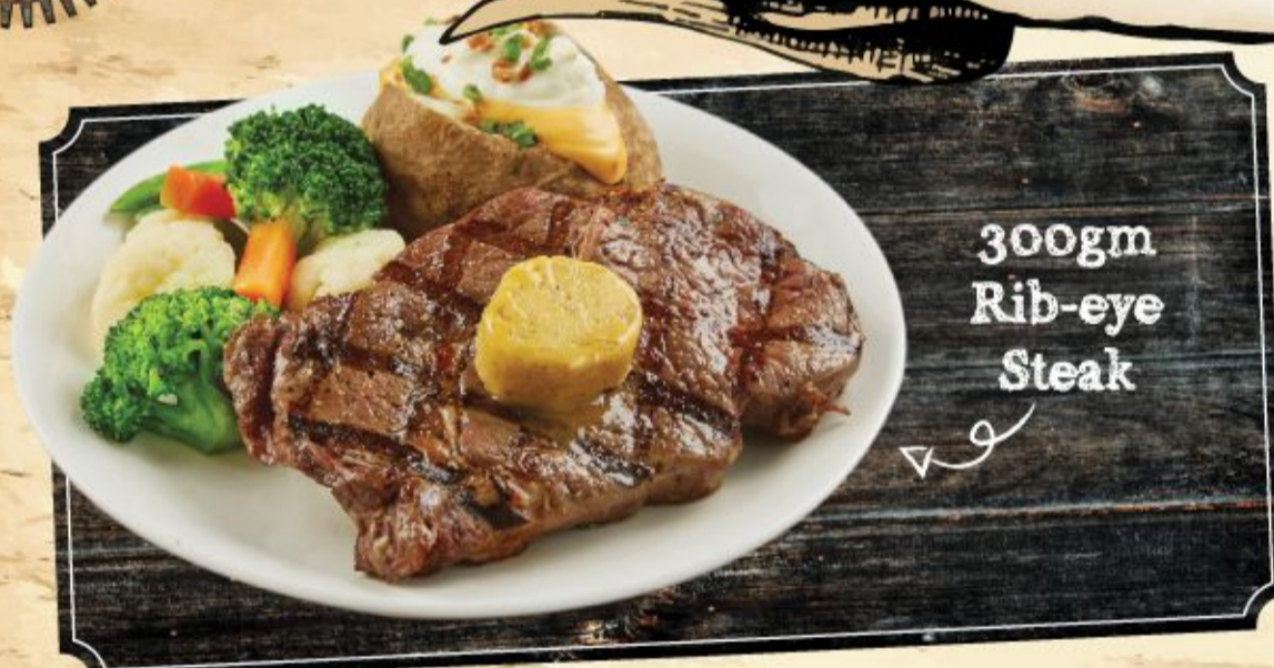
300g Rib-eye Steak

300g Rib-eye Steak ♣ 36.9 The steak-lover's choice, char-grilled to order & topped with Merlot garlic butter. Served with French Fries & Garden Veggies.