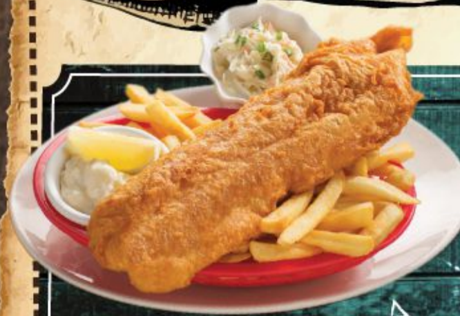
Beer-Battered Fish Fillets