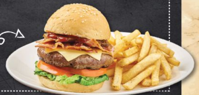
Smokehouse Bacon Cheeseburger

New Brand Spanking New! ★ It's Oinkingly Good! 🌿 Meat-free! ♣ Contains Beef!