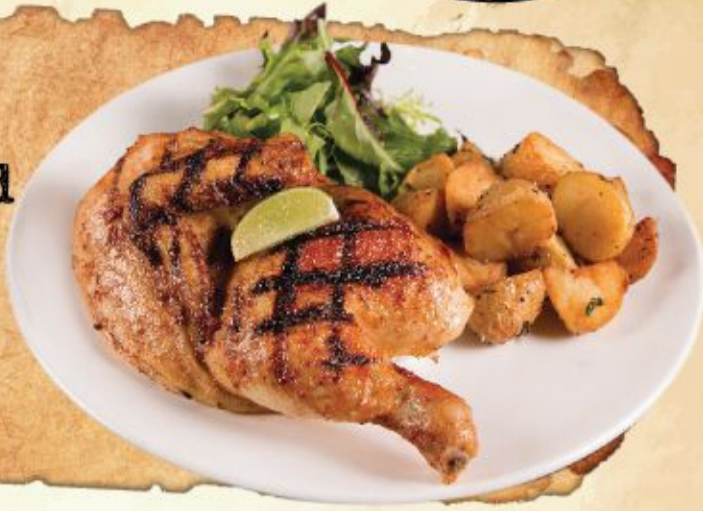
Tequila Spiked Chicken

Tequila Spiked Chicken ★ 24.9 Half chicken marinated with spicy Tequila, lime, paprika & char-grilled to aromatic perfection. Served with Roasted Potatoes & Side Salad.