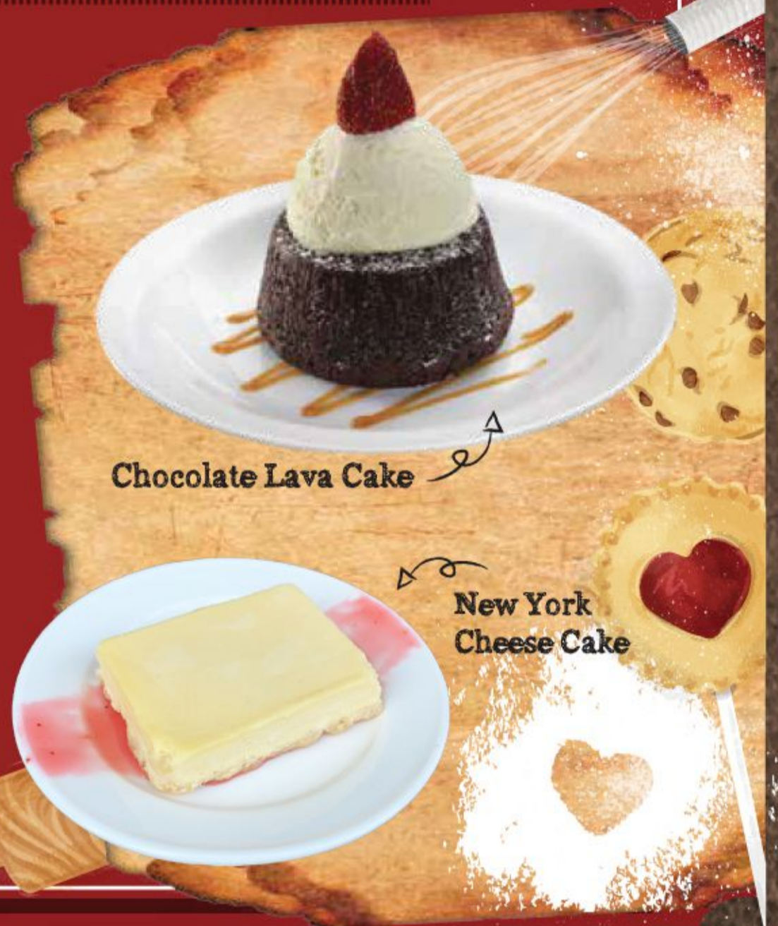
Chocolate Lava Cake

Ice Cream Sundae 6.9 Vanilla ice cream topped with choice of caramel, strawberry or chocolate sauce.