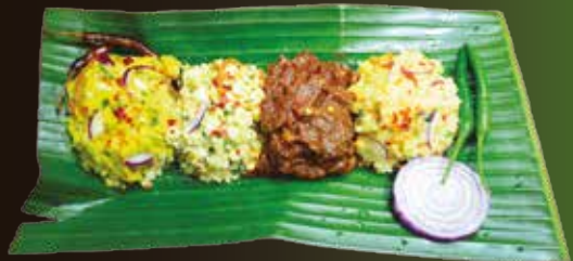
Bhortha Plater £9.95

Mix Bhortha, Deem Bhortha, Shutki Bhortha Aloo Bhortha