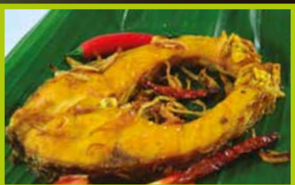
Rohu Fish Fry £5.50