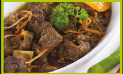
Beef Bhuna £8.50

Beef with bone cooked with garam masalla, medium hot, fairly dry.