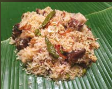
Kachi Biriyani £8.95