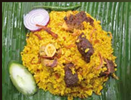
Special Bhuna Khechuri £8.95