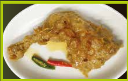
Chicken Rost £4.95