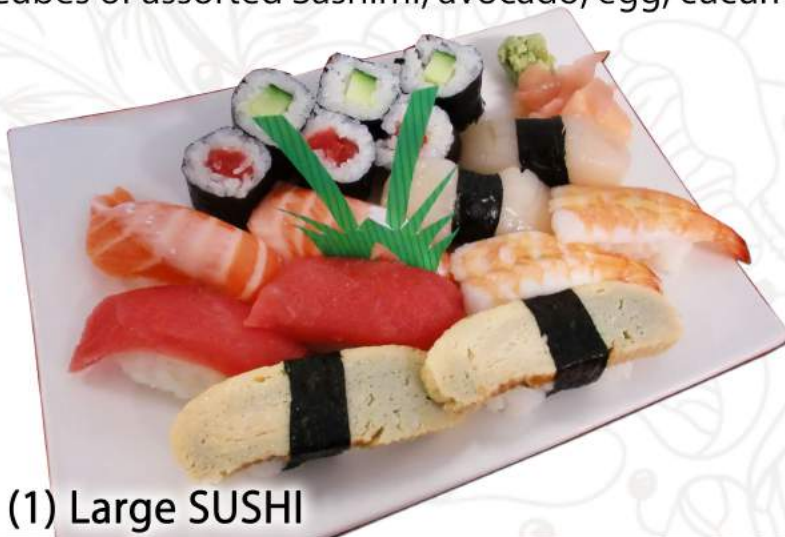
(1) Large SUSHI