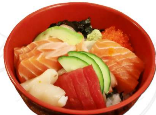
(3) CHIRASHI SUSHI

(Cubes of assorted Sashimi, avocado, egg, cucumber on Sushi Rice)