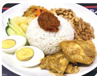
M62 Curry Chicken