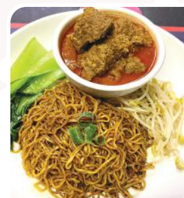
L55 Beef Rendang