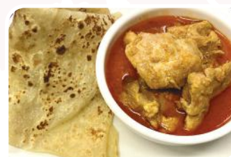
D26 Curry Chicken