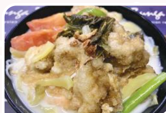
F33 Fish Head