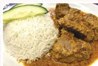
B9 Beef Rendang