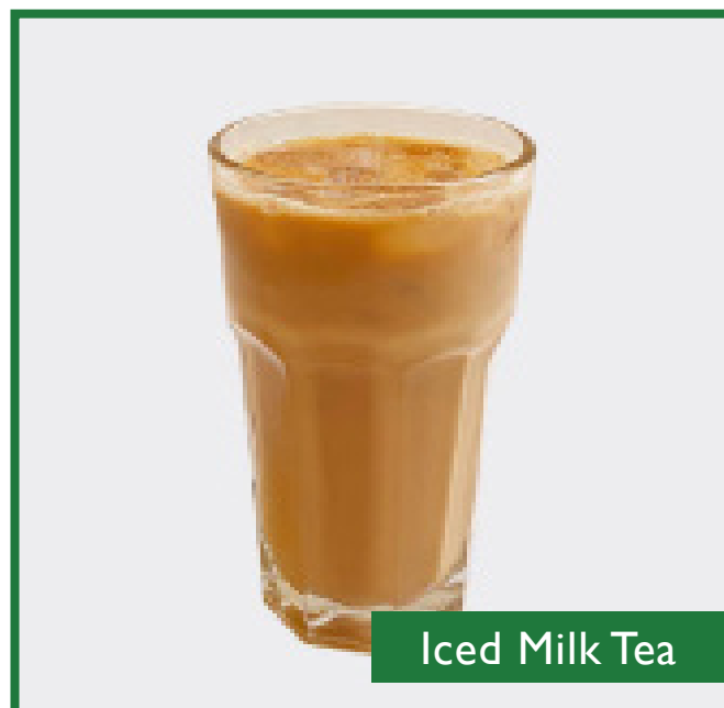
Iced Milk Tea

Prices are subject to 7% GST & 10% service charge.