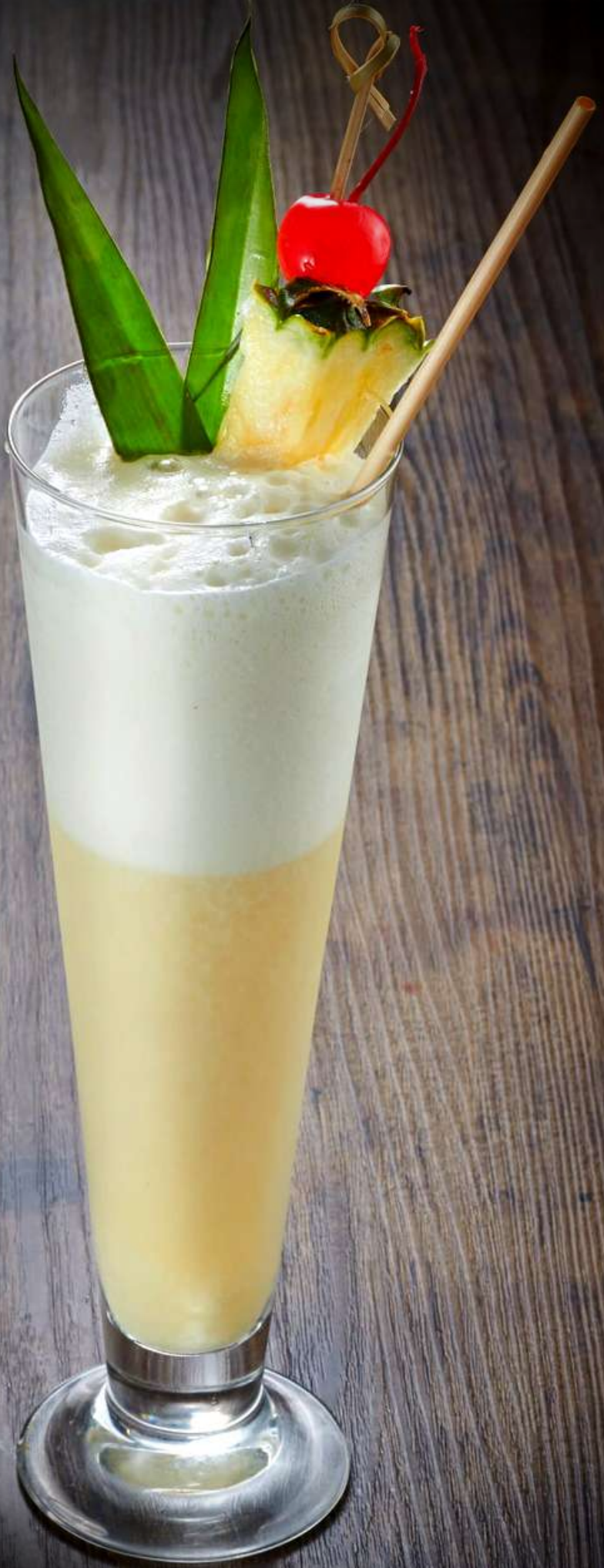
PINA COLADA | 21 WHITE RUM | COCONUT RUM | PINEAPPLE