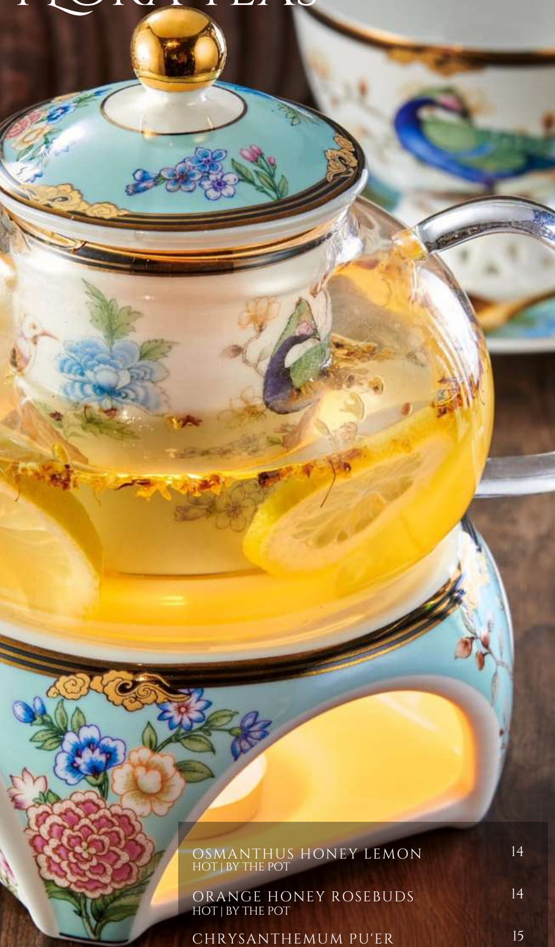
Osmanthus Honey Lemon