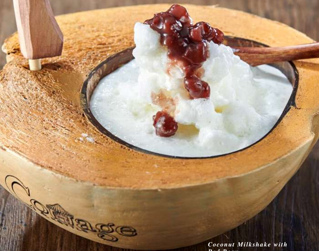
Coconut Milkshake with Red Bean