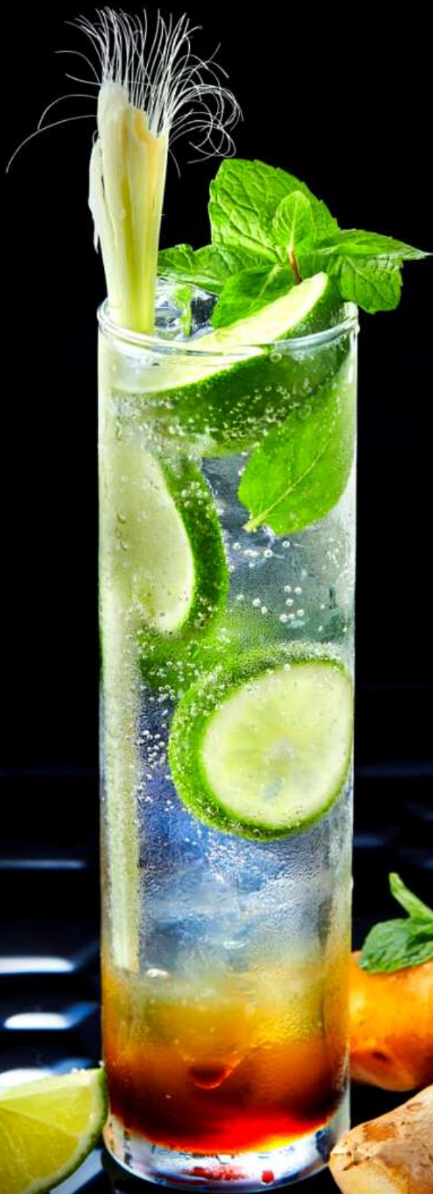
GINGER WALRUS SPLASH | 21 WHITE RUM | GINGER LEMONGRASS MUSCOVADO | LIME & MINT LEAVES | SODA