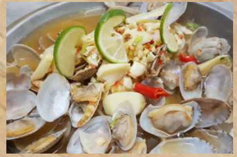
Thai Style Spicy & Sour Lala