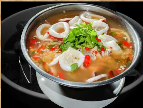
Steam Spicy Squid Soup 泰式蒸苏东汤 (S) 18.90 (L) 36.90