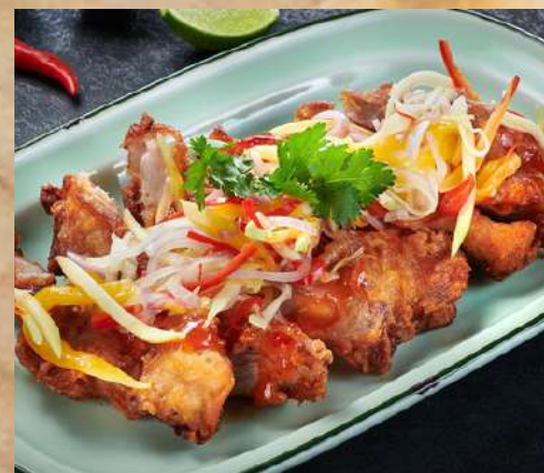
Deep Fried Chicken with Mango Salad