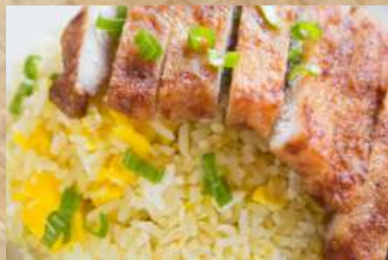
Egg Fried Rice with Spicy Chicken 鸡蛋炒饭与辣鸡