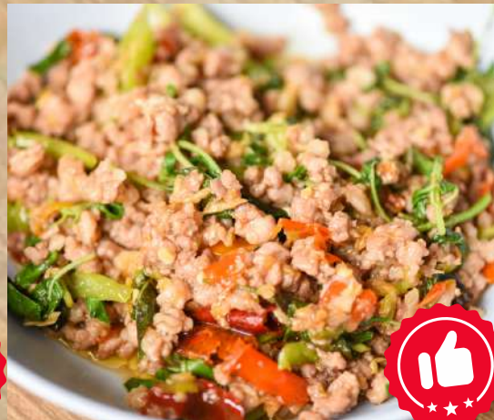
Thai Basil Pork Minced 泰式九层塔炒肉碎