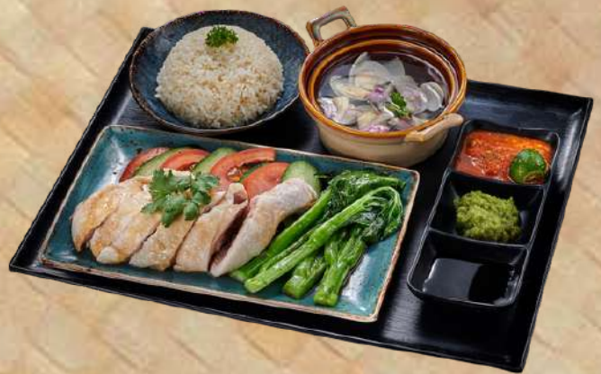
Hainanese Chicken Rice w Clam Soup 海南鸡饭蛤蜊汤 26.90