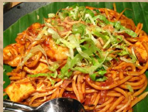
Seafood Mee Goreng 海鲜马来炒面