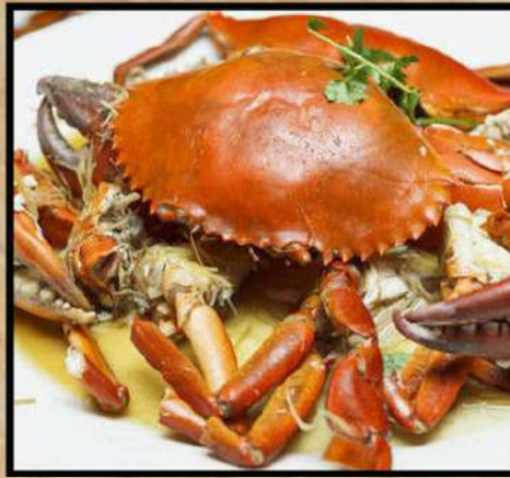
Steam Baked Crab 蒸焗螃蟹