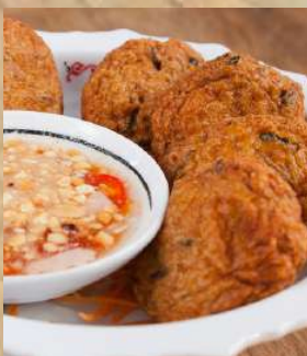
Thai Fish Cake 泰式鱼饼 16.90