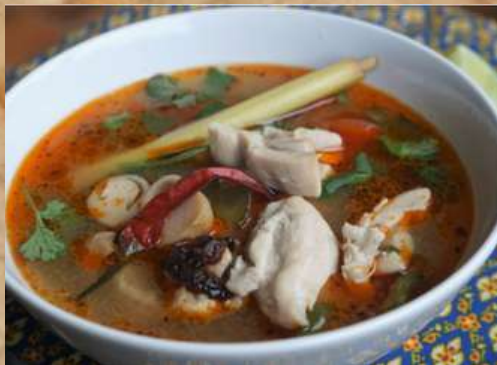
Chicken Tomyum Soup