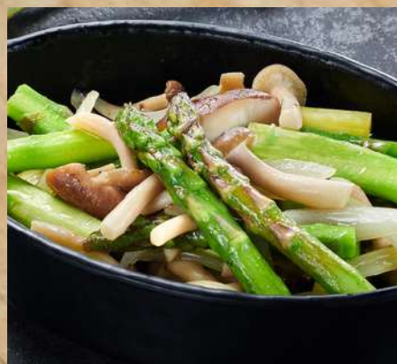
Stir-fried Asparagus & Mushrooms 香菇炒芦笋