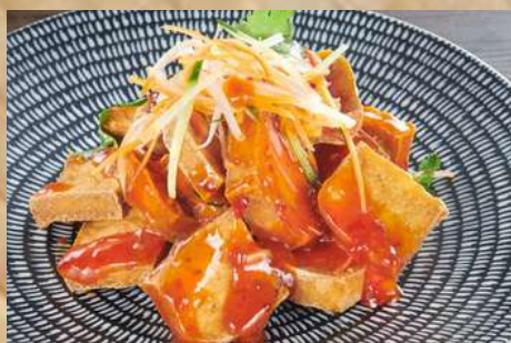
Fried Tofu with Sweet & Spicy Sauce 泰式炸豆腐 (S) 12.90 (L) 18.90