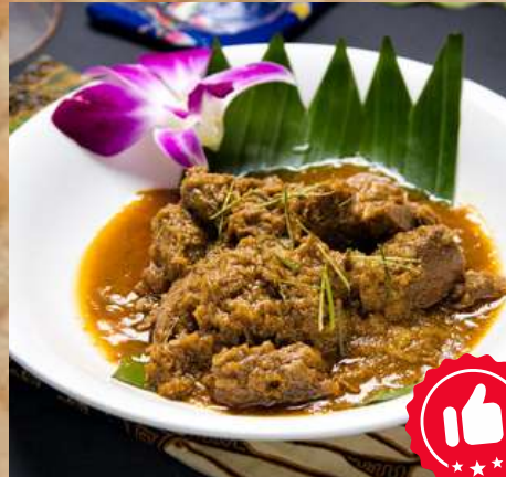
Peranakan Beef Rendang 人当牛肉