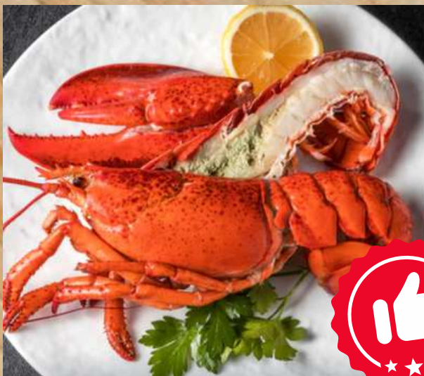
Cold Boston Lobster with Dipping Sauce 冷盘波士顿龙虾