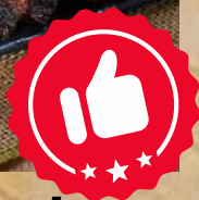
Signature Pork Tomahawk 14 Days Dry-aged Pork 招牌烤战斧 (腌制14天) 89.90