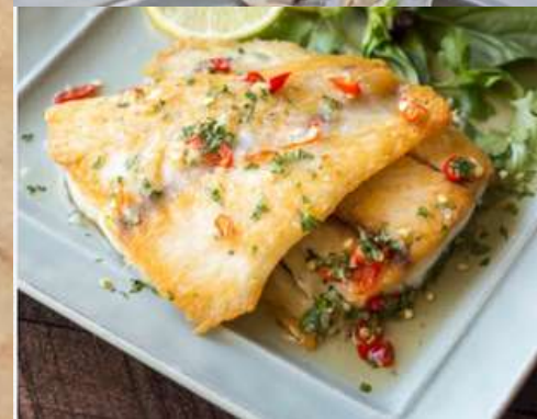
Fried Barramundi with Thai Fish Sauce 泰式鱼露炸澳洲肺鱼