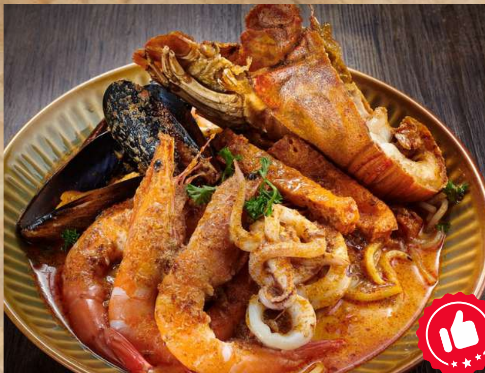
Singapore Laksa with Slipper Lobster 新加坡叻沙琵琶龙虾面