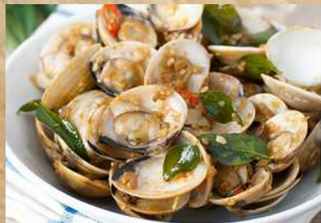
Garlic Butter Lala