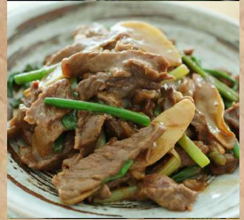
Ginger & Onion Beef 姜葱炒牛肉