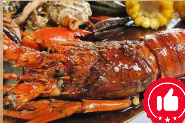
Black Pepper Lobster 黑胡椒澳洲龙虾