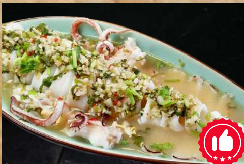
Thai Style Spicy & Sour Whole Squid 泰式苏东