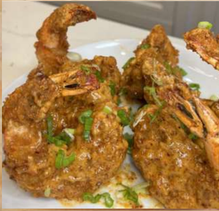
Salted Egg Jumbo Prawn