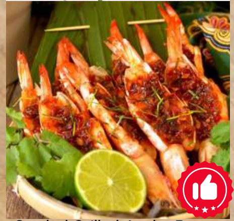
Sambal Grilled Jumbo Prawn