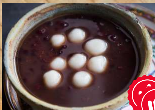
Red Bean Soup with Peanut Mochi 8.90