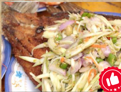
Fried Barramundi with Mango Salad 泰式芒果沙拉炸澳洲肺鱼