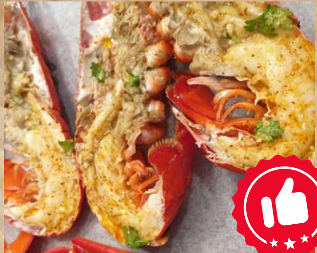
Creamy Cheese Lobster 奶油芝士波士顿龙虾