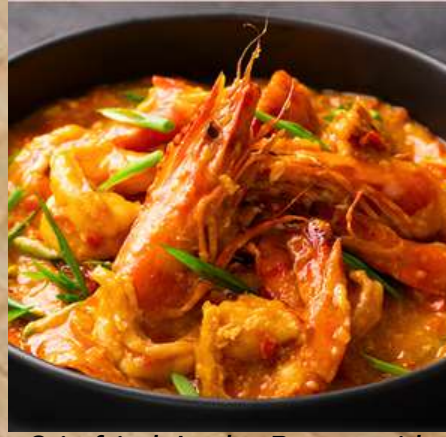
Stir-fried Jumbo Prawn with Singapore Chili Crab Sauce