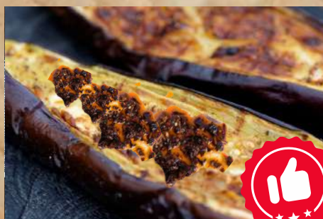
Grilled Spicy Eggplant 烤辣椒茄子 (S) 16.90 (L) 32.90