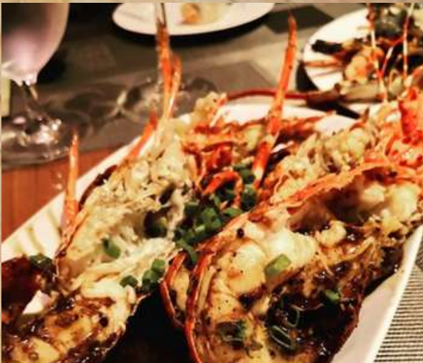
Black Pepper Boston Lobster 黑胡椒波士顿龙虾