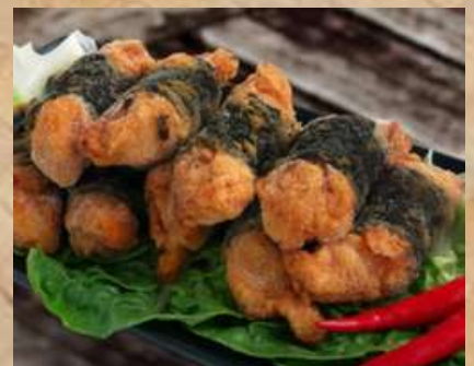
Deep Fried Seaweed Chicken 紫菜鸡 (S) 12.90 (L) 18.90