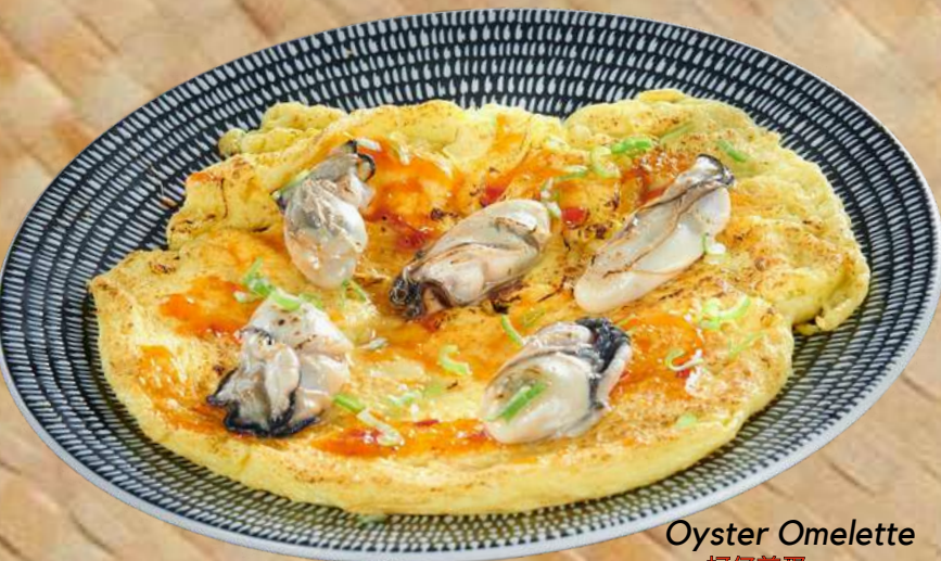
Oyster Omelette 蚵仔煎蛋