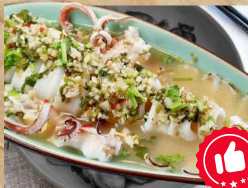
Steamed Whole Squid in Thai Style Spicy & Sour 泰式苏东 32.90