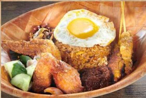
Sambal Fried Rice 叁巴炒饭 (鸡翅膀和沙爹)