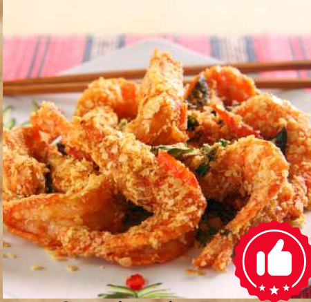
Cereal Jumbo Prawn