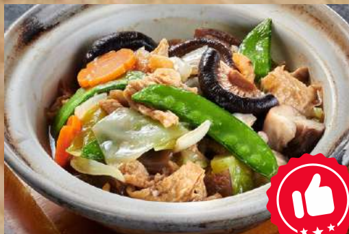
Tofu Mixed Vegetable 杂菜豆腐 (S) 16.90 (L) 32.90