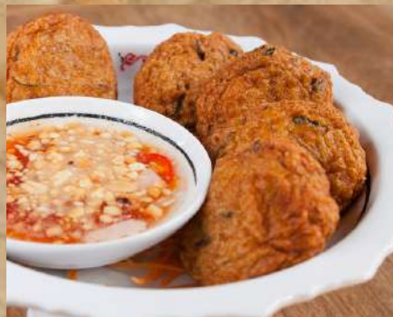
Thai Fish Cake 泰式鱼饼 16.90