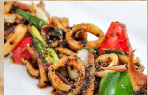
Stir-Fry Black Pepper Squid 黑胡椒炒苏东