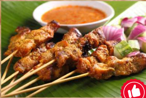
Pork/Chicken Satay 24.90 (1 Dozen) 传统腌制沙爹 (鸡肉/猪肉)