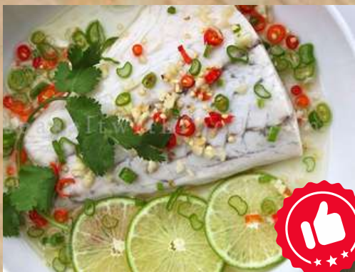
Steam Barramundi with Garlic, Lime & Chilli 泰式蒸澳洲肺鱼