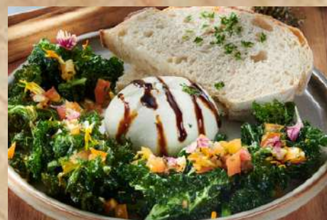
Burrata Cheese with Kale Chips & Sourdough 芝士与橄榄菜 18.90