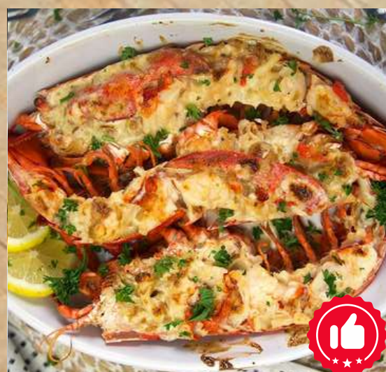
Creamy Butter Cheese Slipper Lobster