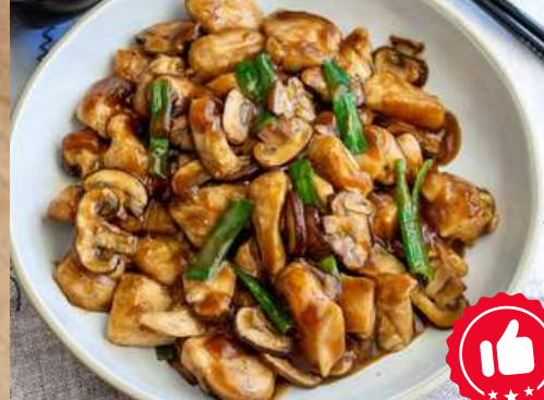
Stir-fried Onion & Mushroom Chicken 洋葱蘑菇炒鸡丁