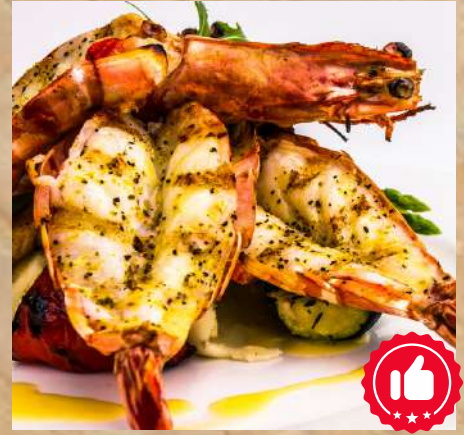
Garlic Butter Jumbo Prawn