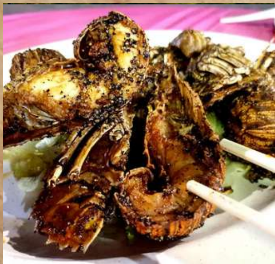
Black Pepper Slipper Lobster