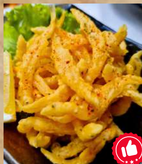
Crispy Whitebaits 炸小白鱼 16.90