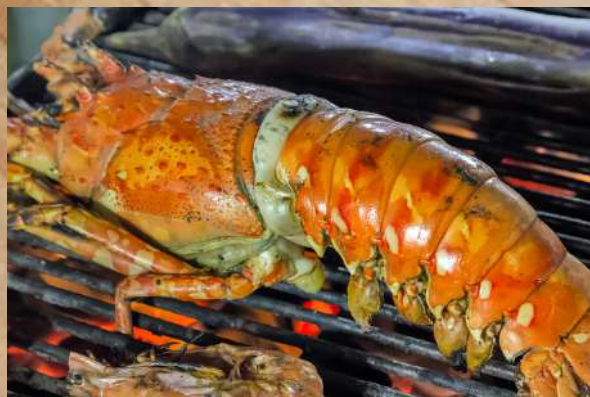
Grilled Lobster 烤澳洲龙虾