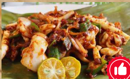
Stir-fry Sambal Squid 叁巴苏东