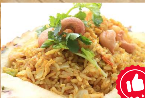
Vegetarian Pineapple Fried Rice 凤梨炒饭 (S) 16.90 (L) 32.90