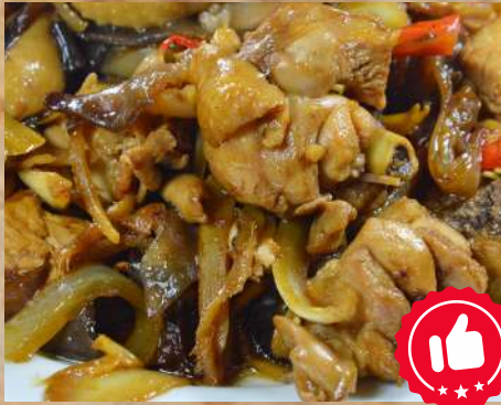
Stir-fried Ginger & Onion 姜葱鸡