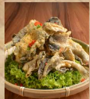
Salted Egg Fish Skin 16.90 咸蛋鱼皮