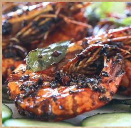
Black Pepper Jumbo Prawn