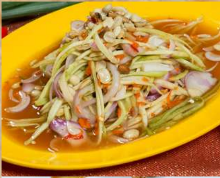
Thai Mango Salad 泰式芒果沙拉 (S) 14.90 (L) 22.90