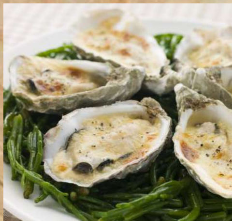
Oyster Mornay* 烘烤芝士生蚝