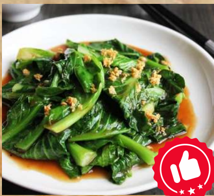
Stir-fried Baby Kailan 蒜蓉炒小芥兰