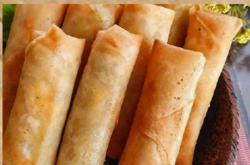
Fried Springrolls 素春卷 (S) 12.90 (L) 18.90