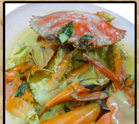
Creamy Butter Cheese Crab * 奶油芝士蟹