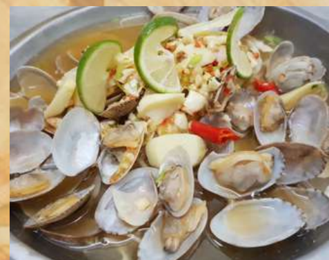
Steamed Clams in Thai Style Spicy & Sour 泰式拉拉 (S) 18.90 (L) 36.90