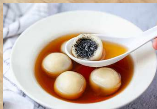
Ginger Tea with Black Sesame Mochi 8.90