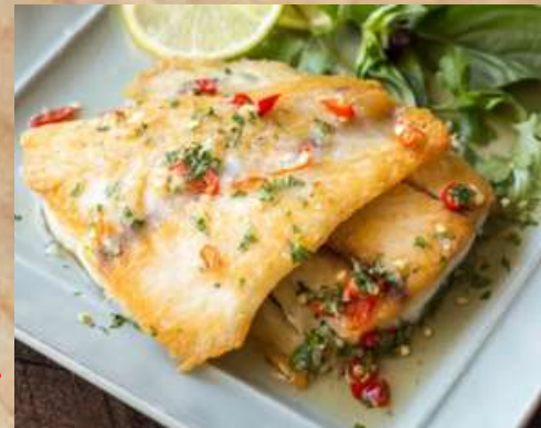
Fried Barramundi with Thai Fish Sauce 泰式鱼露炸澳洲肺鱼