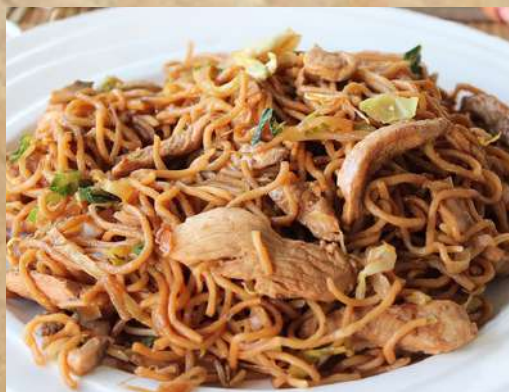
Chicken Mee Goreng 马来炒面