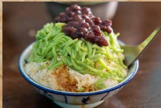
Coconut Cendol with Gula Melaka 9.90