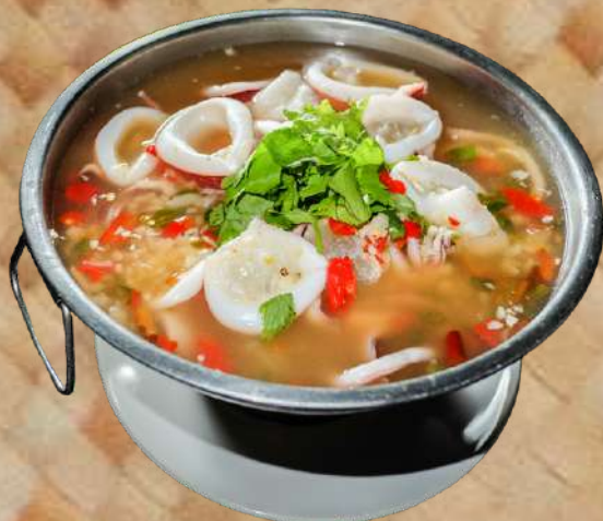
Steam Spicy Squid Soup 泰式蒸苏东汤