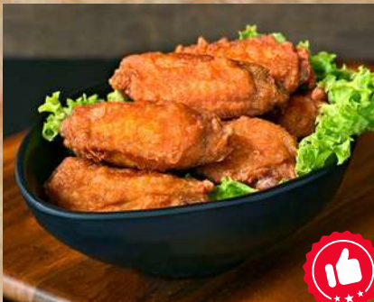
Prawn Paste Chicken 虾酱鸡 16.90