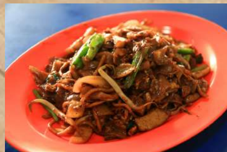
Vegetarian Fried Kway Teow 炒河粉 (S) 16.90 (L) 32.90