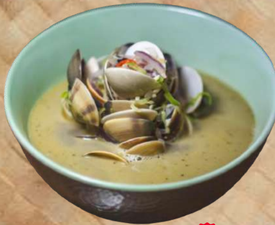
Clam Soup 蛤蜊汤