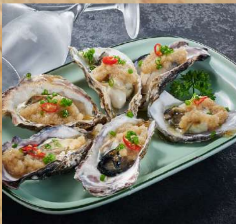
Steamed Oyster with Garlic* 蒜蓉生蚝