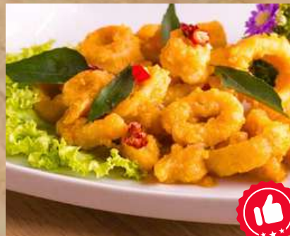
Salted Egg Calamari 咸蛋炸苏东 16.90