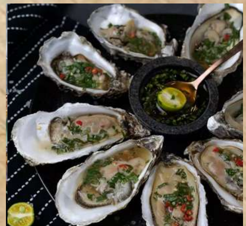
Thai Style Oyster* 泰式生蚝