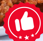
Deep Fried Garlic Pork