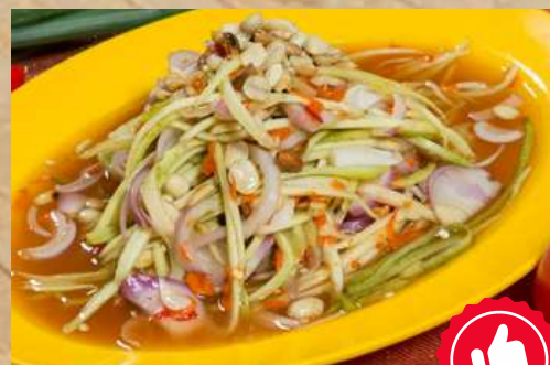
Thai Mango Salad 泰式芒果沙拉 (S) 14.90 (L) 22.90