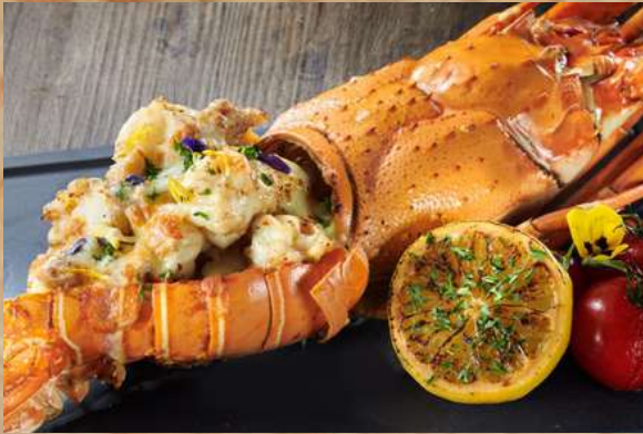
Lobster Thermidor 奶油芝士烤澳洲龙虾