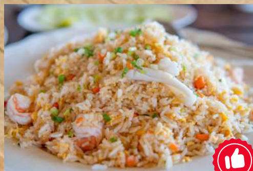
Seafood Fried Rice 海鲜炒饭