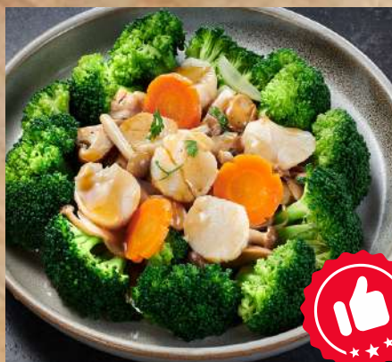
Stir-fried Broccoli w Mushroom & Scallop 西兰花炒带子