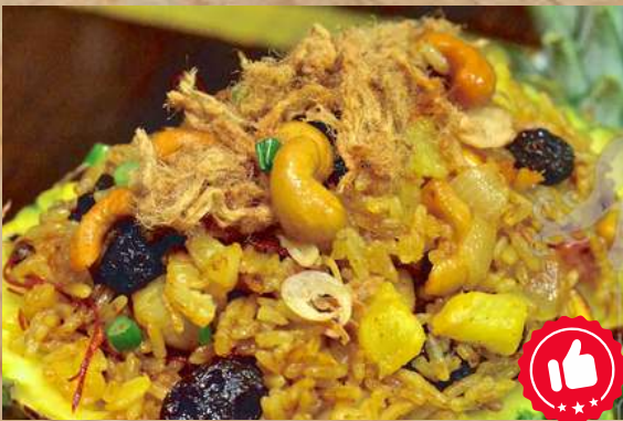
Pineapple Fried Rice with Chicken Floss 凤梨鸡肉松炒饭