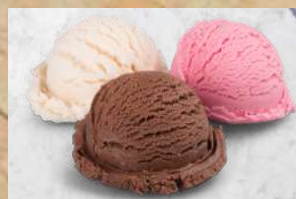
Scoop of Ice Cream *Ask for Available Flavors* 3.00