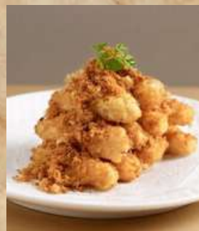
Crispy Eggplant Chicken Floss 16.90 香脆炸茄子与肉松