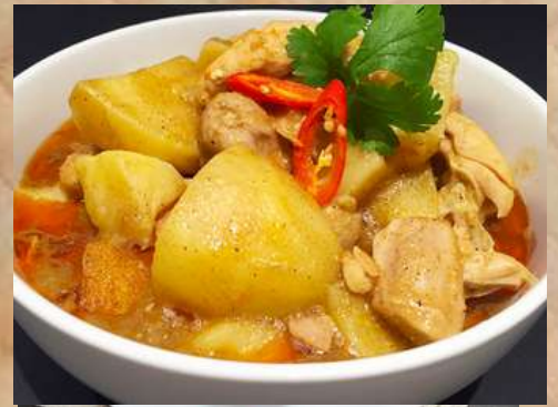
Peranakan Chicken Curry 娘惹咖喱鸡