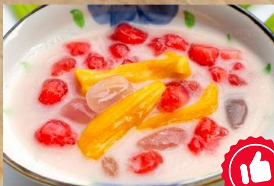
Thai Red Ruby 12.90