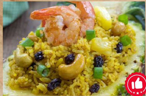
Seafood Pineapple Fried Rice with Chicken Floss 海鲜凤梨鸡肉松炒饭