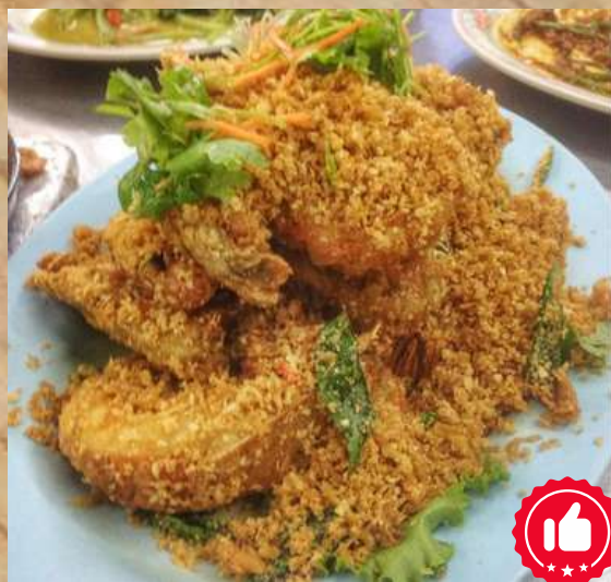
Cereal Slipper Lobster