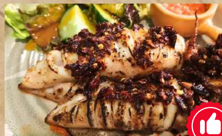
Grilled Spicy Whole Squid 特制辣椒苏东