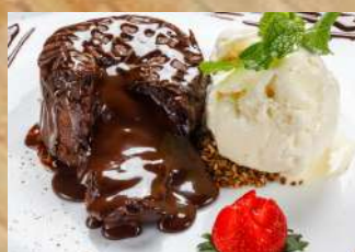
Chocolate Lava Cake with Vanilla Ice Cream 14.90