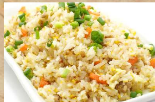
Egg Fried Rice 蛋炒饭