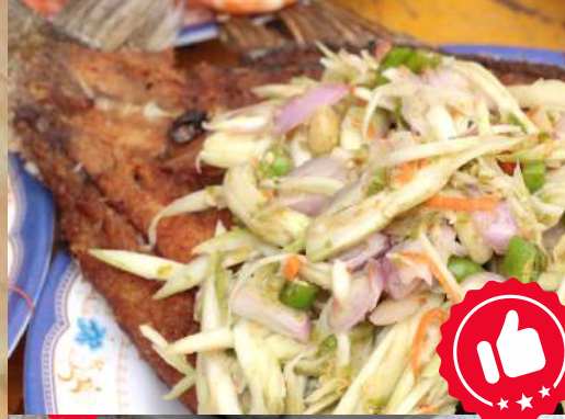
Fried Barramundi with Thai Mango Salad 泰式芒果沙拉炸澳洲肺鱼