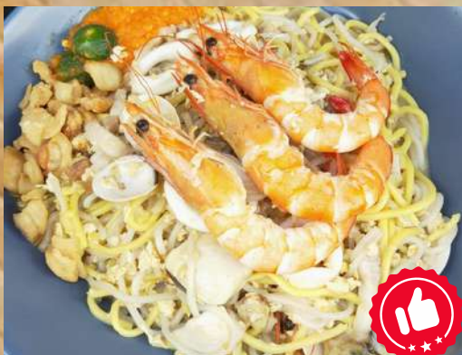
Seafood Hokkien Noodle 海鲜福建面