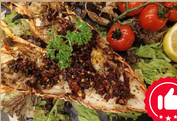
Oven Baked Lobster with Special Spicy Sauce 特制辣椒烤澳洲龙虾