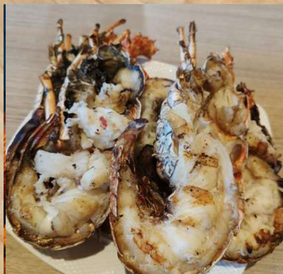
Grilled Slipper Lobster with Special Spicy Sauce