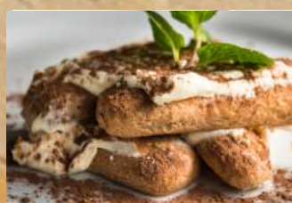
Tiramisu With Alcohol 14.90 Non Alcohol 12.90