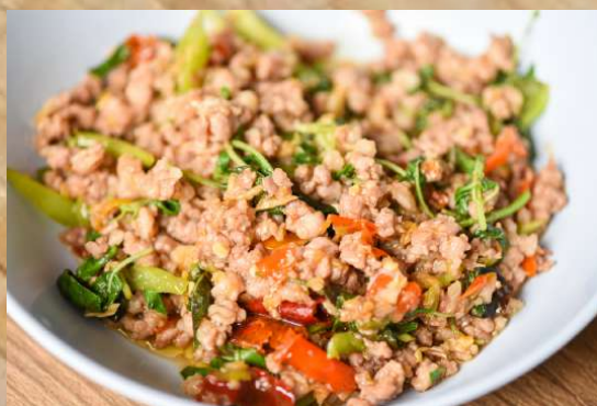
Thai Basil Pork Minced