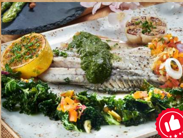
Oven Baked Barramundi 烘烤澳洲肺鱼