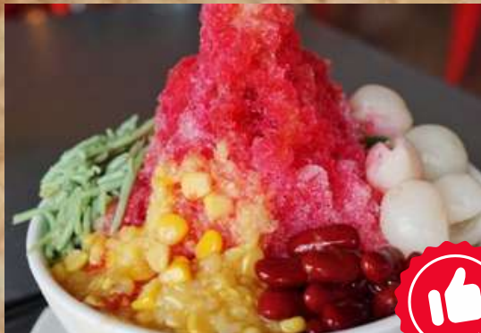
Singapore Ice Kachang 10.90