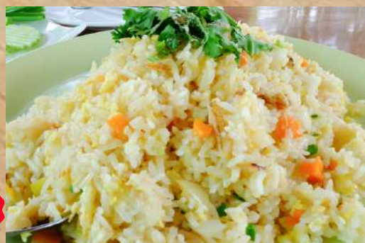
Vegetarian Egg Fried Rice 蛋炒饭 (S) 14.90 (L) 26.90