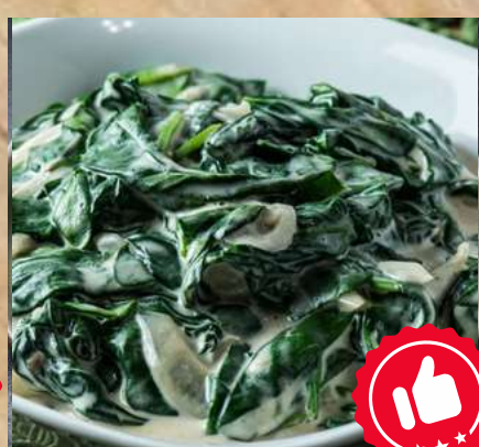
Creamed Spinach 奶油菠菜