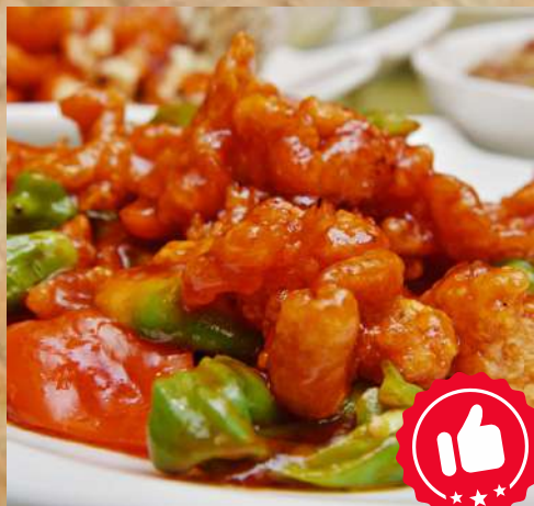
Sweet & Sour Pork 酸甜咕嚕肉 (猪肉)