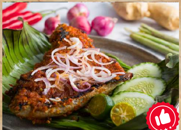
Grilled Sambal Stingray 烤参巴黄貂鱼