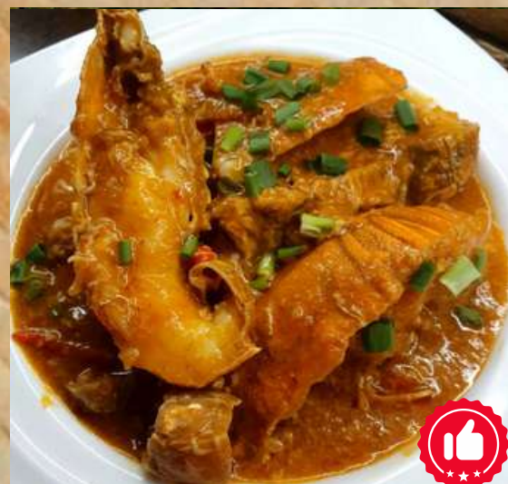
Singapore Chili Crab Slipper Lobster