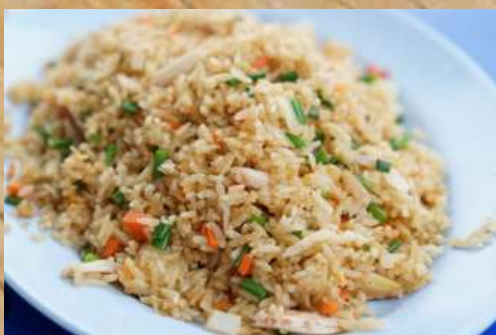
Crabmeat Fried Rice 蟹肉炒饭