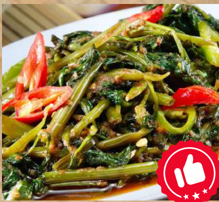
Sambal Kangkong 叁巴炒空心菜