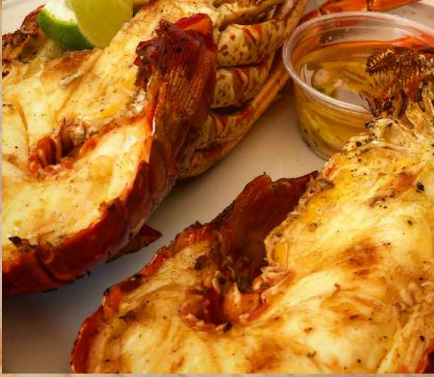
Grilled BBQ Boston Lobster 烤波士顿龙虾