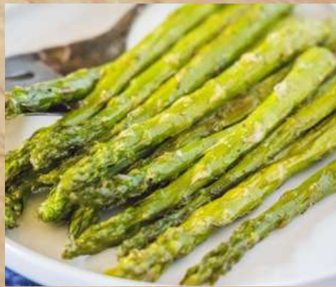
Baked Asparagus 烘烤芦笋