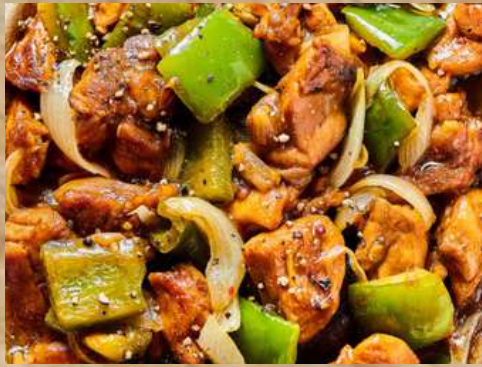
Black Pepper Chicken 黑胡椒鸡丁