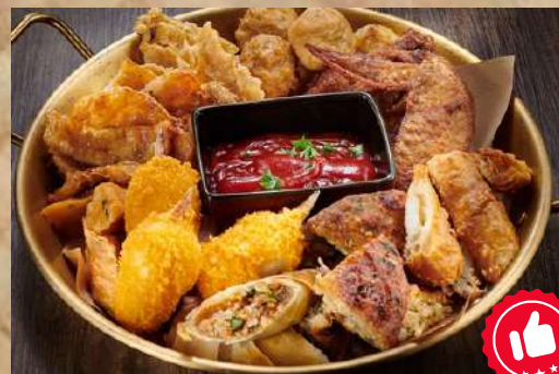
Traditional Peranakan Platter "Ngoh Hiang" 32.90 五香拼盘