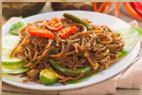
Vegetarian Mee Goreng 素马来面 (S) 16.90 (L) 32.90