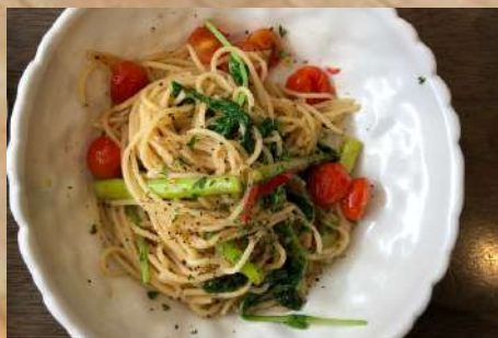
Vegetarian Aglio Olio Spaghetti 蒜蓉意大利面 (S) 16.90 (L) 32.90