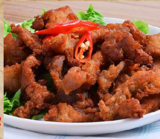
Deep Fried Garlic Pork 泰式炸蒜头猪肉