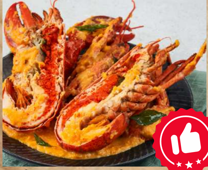
Laksa Boston Lobster 新加坡叻沙士顿龙虾