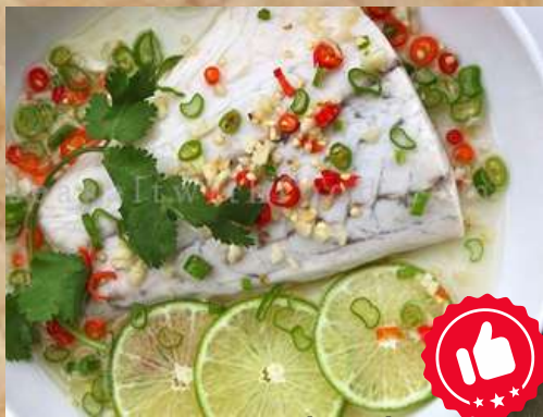
Steam Barramundi with Garlic, Lime & Chilli 泰式蒸澳洲肺鱼