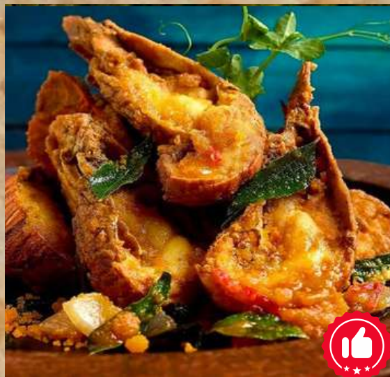
Salted Egg Slipper Lobster