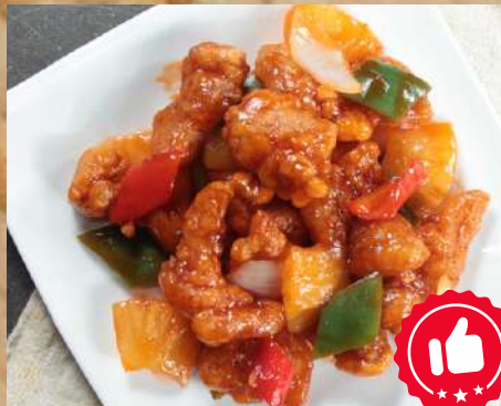
Sweet & Sour Chicken 酸甜鸡丁