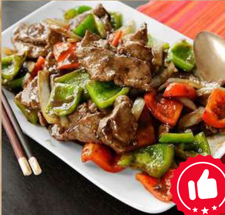
Black Pepper Beef 黑胡椒炒牛肉