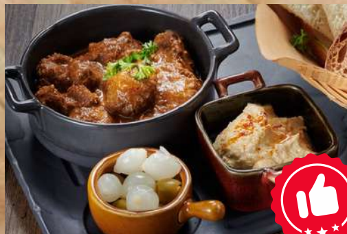
Vegetarian Beef Rendang with Humus & Assorted Bread 素人当与烘烤面包 28.90