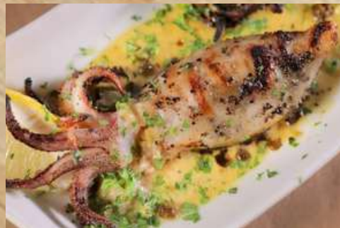
Garlic Butter Whole Squid 蒜蓉奶油苏东