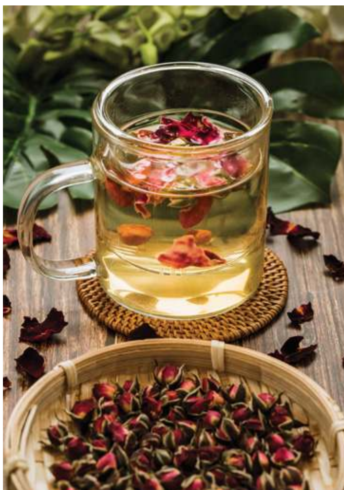
金边玫瑰枸杞茶 Yunnan Rose Tea With Goji Berries