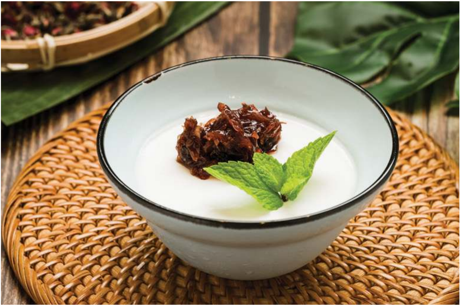
玫瑰鲜奶冻 Milk Pudding with Rose Jam