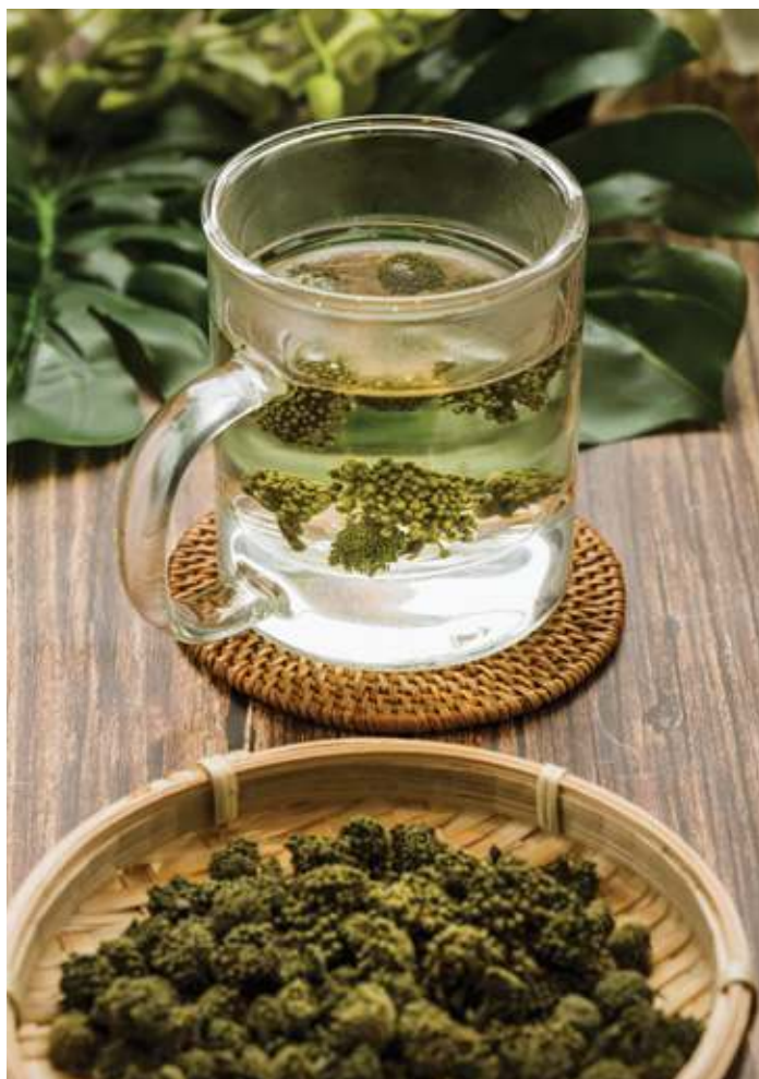
三七花茶 Yunnan San Qi Tea