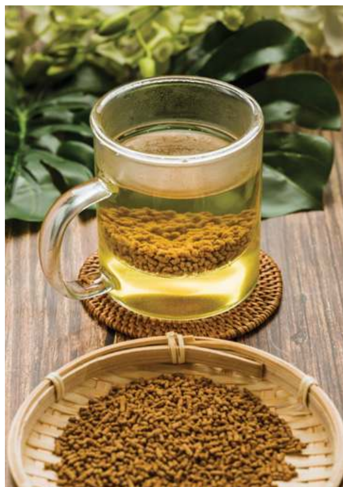
黄金苦荞茶 Golden Buckwheat Tea