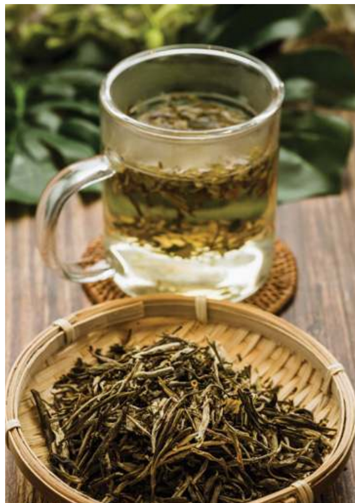
糯米香茶 Sticky Rice Green Tea