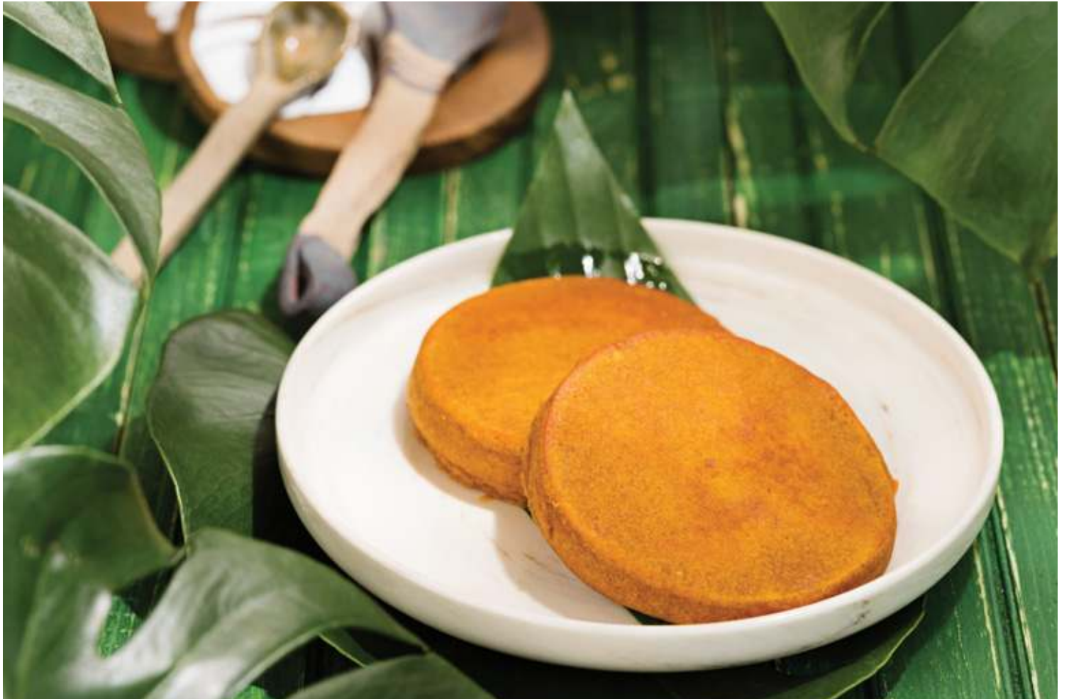
苦荞粑粑 (3片) Homemade Buckwheat cake (3Pcs)