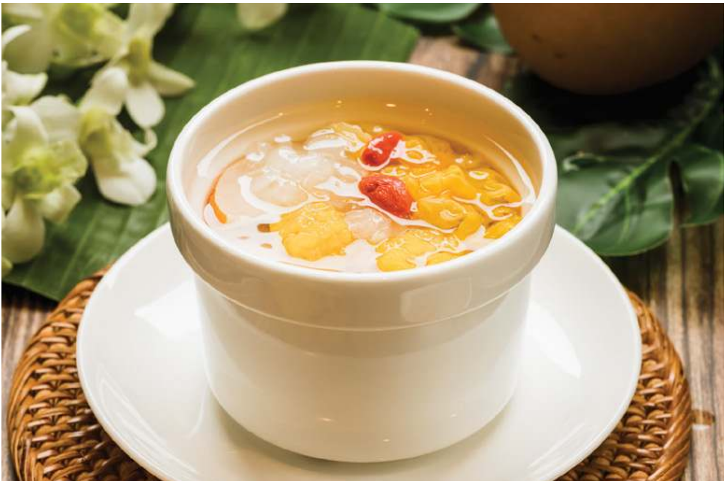
金耳木瓜盅 Double Boiled Papaya with Golden Fungus