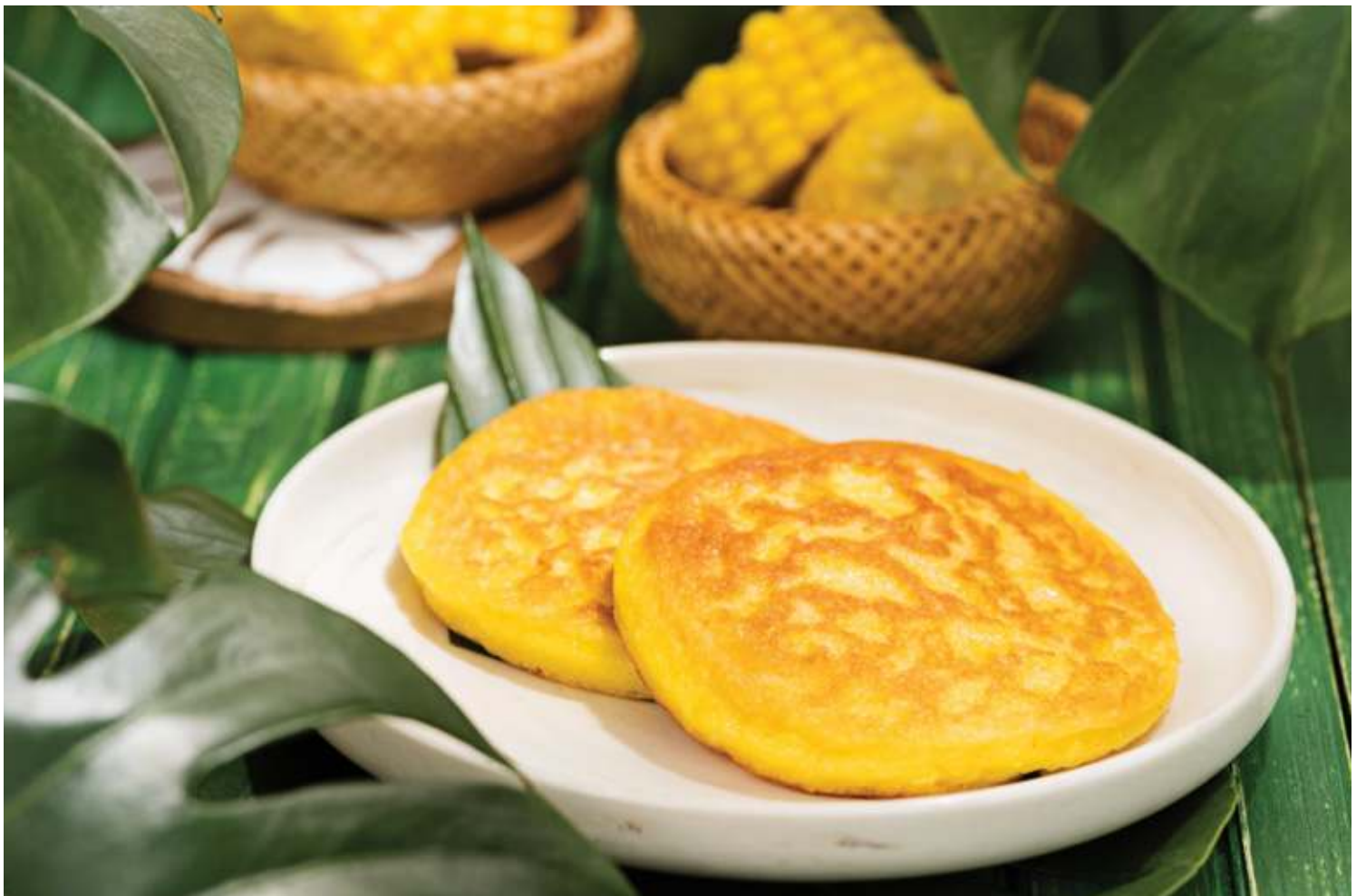
玉米粑粑 (3片) Homemade Corn Cake (3Pcs)