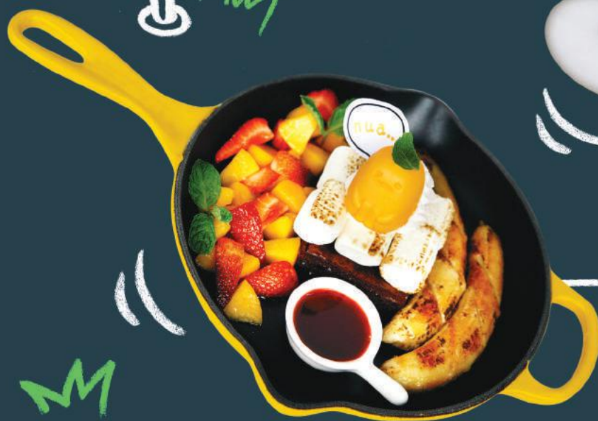
5 MORE MINUTES BREAKFAST PAN $19.5

Caramel flan with premium vanilla soft serve, caramelised bananas, apple crumble and a crisp sesame orange tuile. Doesn't Gudetama look sweet?