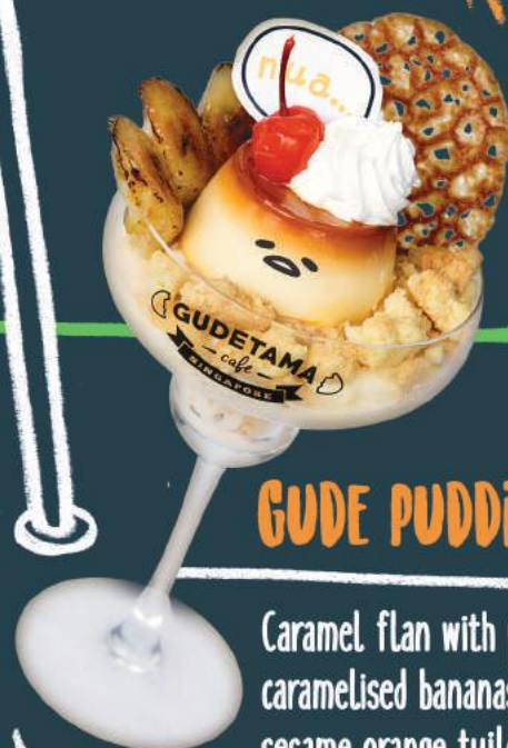
GUDE PUDDING $16.9

Caramel flan with premium vanilla soft serve, caramelised bananas, apple crumble and a crisp sesame orange tuile. Doesn't Gudetama look sweet?