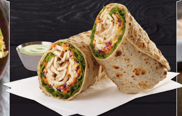
Chicken Kofta Wrap