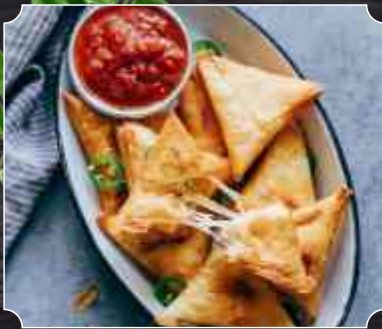
Cheesy Samosa Jalapeño