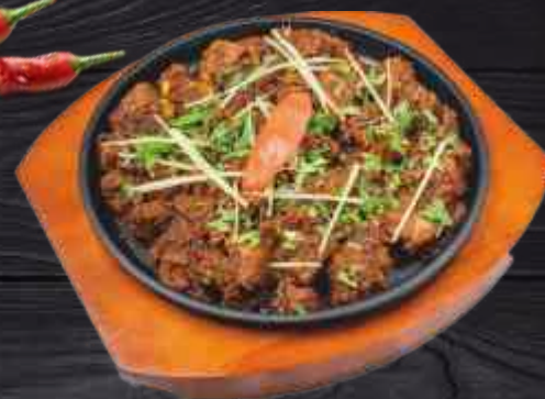
Laal Maas Rajasthani