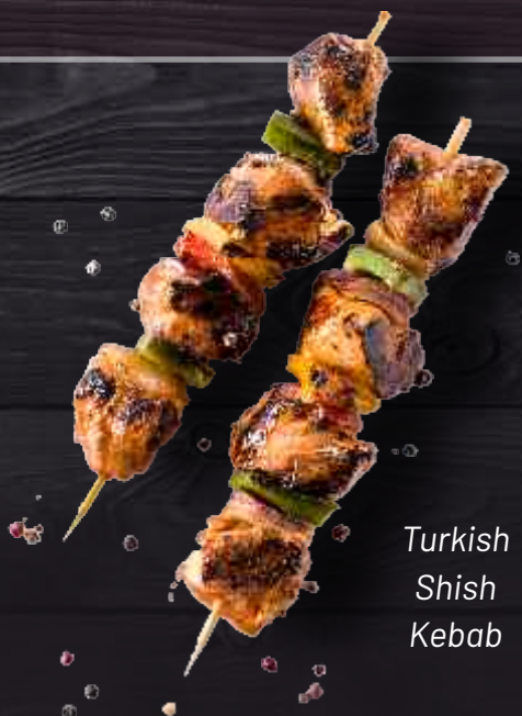
Turkish Shish Kebab