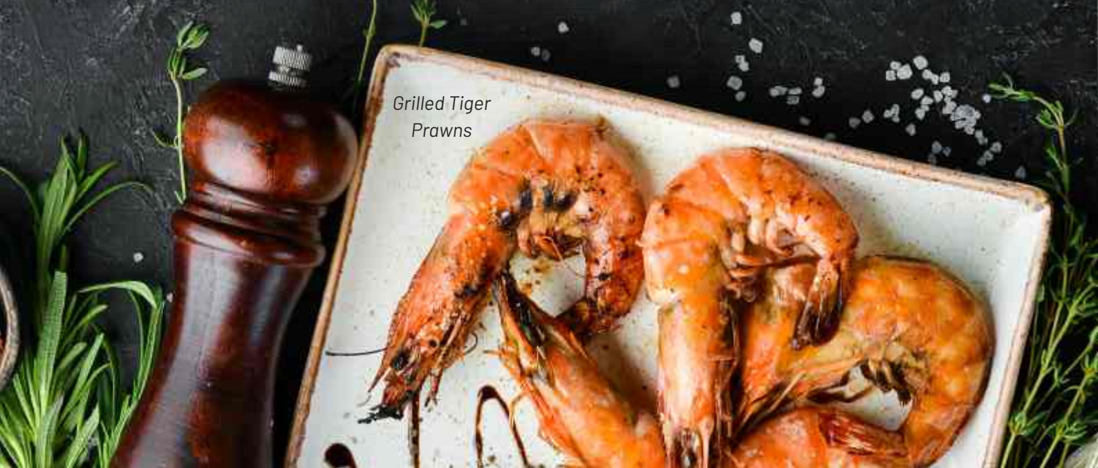
Grilled Tiger Prawns