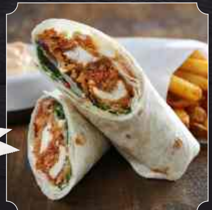
Shish Tawook Wrap