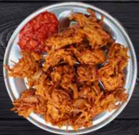
Mix Vegetable Pakora