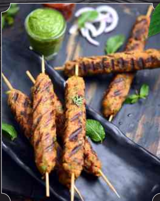
Mutton Sheekh Kebab