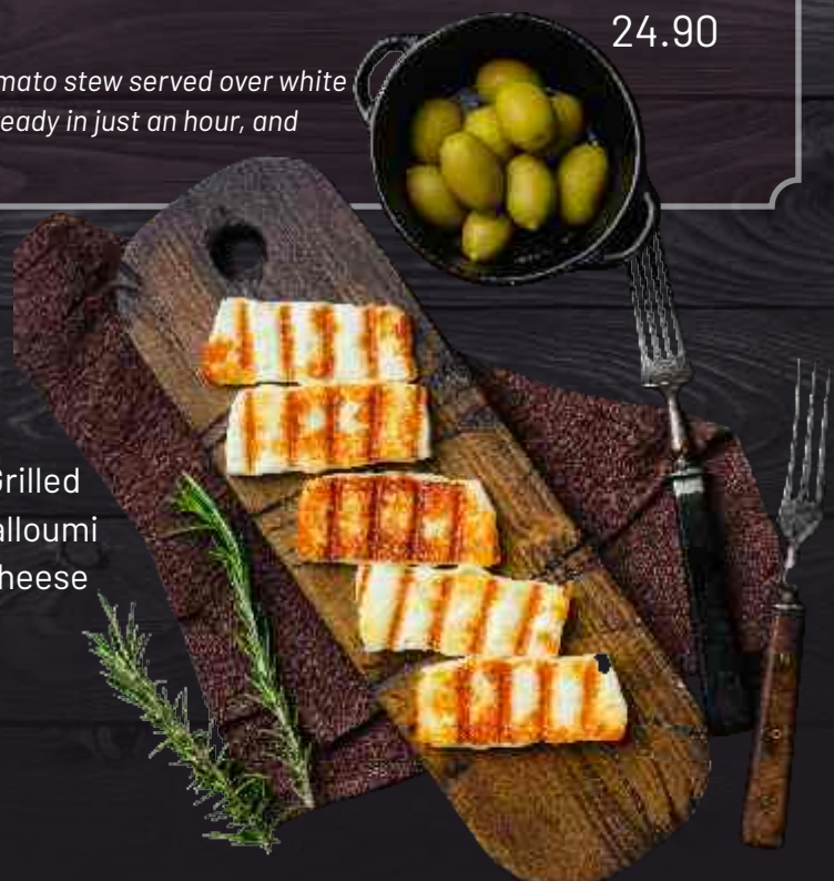
Grilled Halloumi Cheese