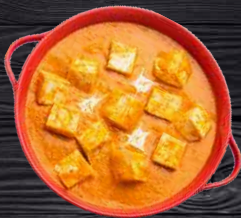
Paneer Butter Masala