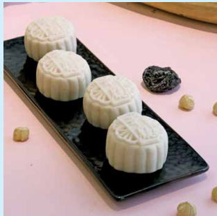
Sweet Sour Plum with Roasted Organic Hazelnut Mini Snowskin Mooncakes