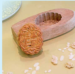
Seeds of Harmony Traditional Baked Mooncake