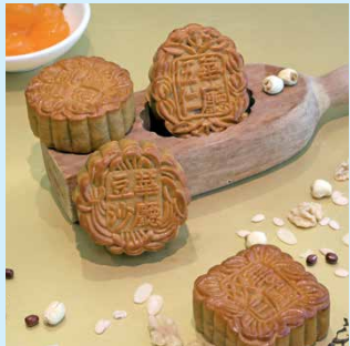
Assorted Traditional Baked Mooncakes

Relish sweet get-togethers over a symphony of baked and snowskin mooncake delicacies made with natural ingredients, deftly perfected by Hua Ting's culinary experts.