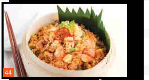
44 CƠM CHIÊN HẢI SẢN / BÒ ★ Vietnamese Fried Rice w Seafood / Beef / Chicken 10.8