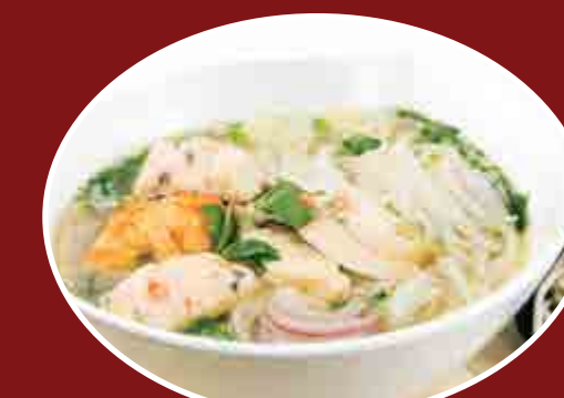
24 PHỞ GÀ 10.8 Pho Chicken Noodle Soup w Prawn Cakes & Chicken Fillet