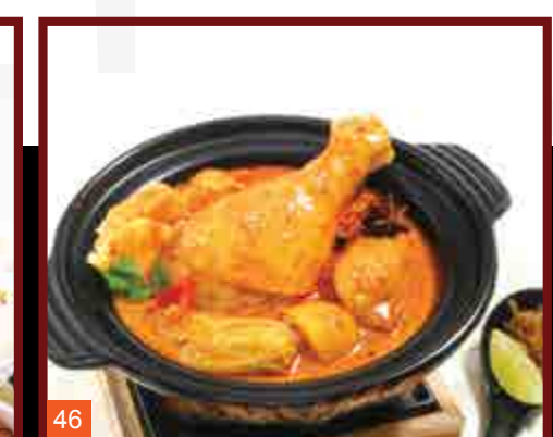
46 CÀ RY GÀ BÁNH MÌ ★ 10.8 Vietnamese Curry Chicken w Bread / Rice