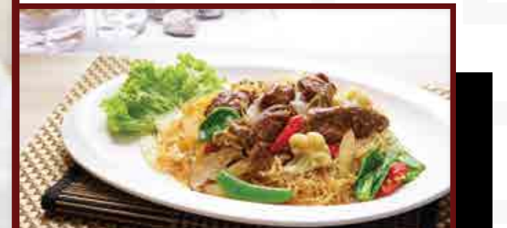
31 MIẾN XÀO ★ Fried Lemongrass Glass Noodle w Vegetables 10.8 w Seafood / Beef / Chicken 11.8