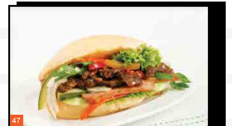
47 BÁNH MÌ ★ Baguette w Vegetables 6.5 Beef / Chicken 7.5

Looking for a quick bite? Grab a refreshing & extraordinary taste of Vietnamese Baguette.