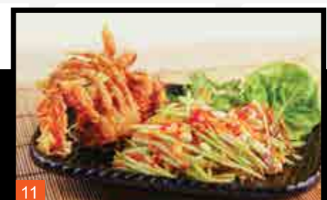
11 GỎI XOÀI CUA LỘT 13.5 Mango & Papaya Salad w Softshell Crab