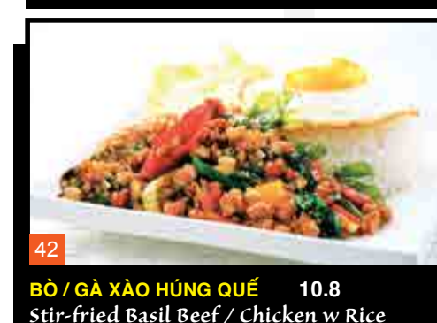
42 BÒ / GÀ XÀO HÚNG QUẾ 10.8 Stir-fried Basil Beef / Chicken w Rice