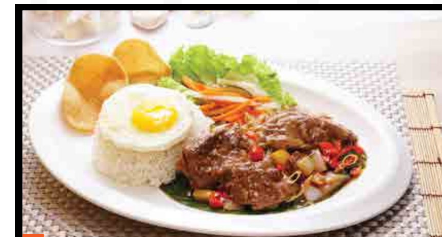
40 BÒ / GÀ NƯỚNG SA ★ 12.5 Grilled Lemongrass Beef w Rice