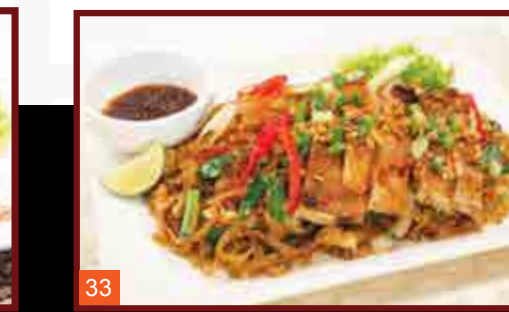
33 PHỞ XÀO ★ Fried Pho Noodle w Vegetables 10.8 Seafood / Beef / Chicken 11.8