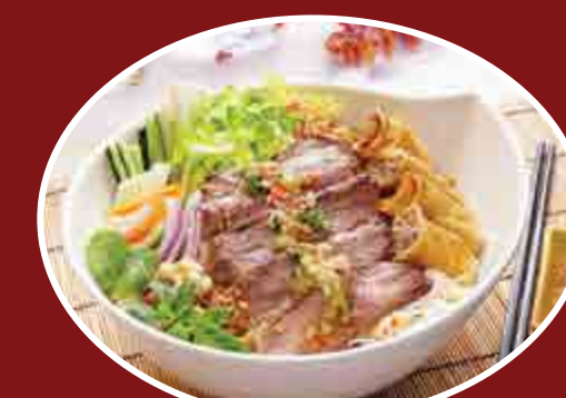
25 BÚN CHẢ BÒ VIÊN ★ 16.8 Bun Noodle w Flame Seared Marbled Sirloin Beef & Fried Spring Rolls