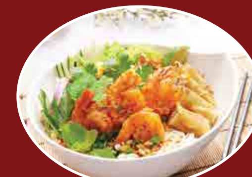
27 BÚN CHẢ GIÒ TÔM CHIÊN BỘT 12.5 Bun Noodle w Chilli Garlic Prawn & Fried Spring Rolls