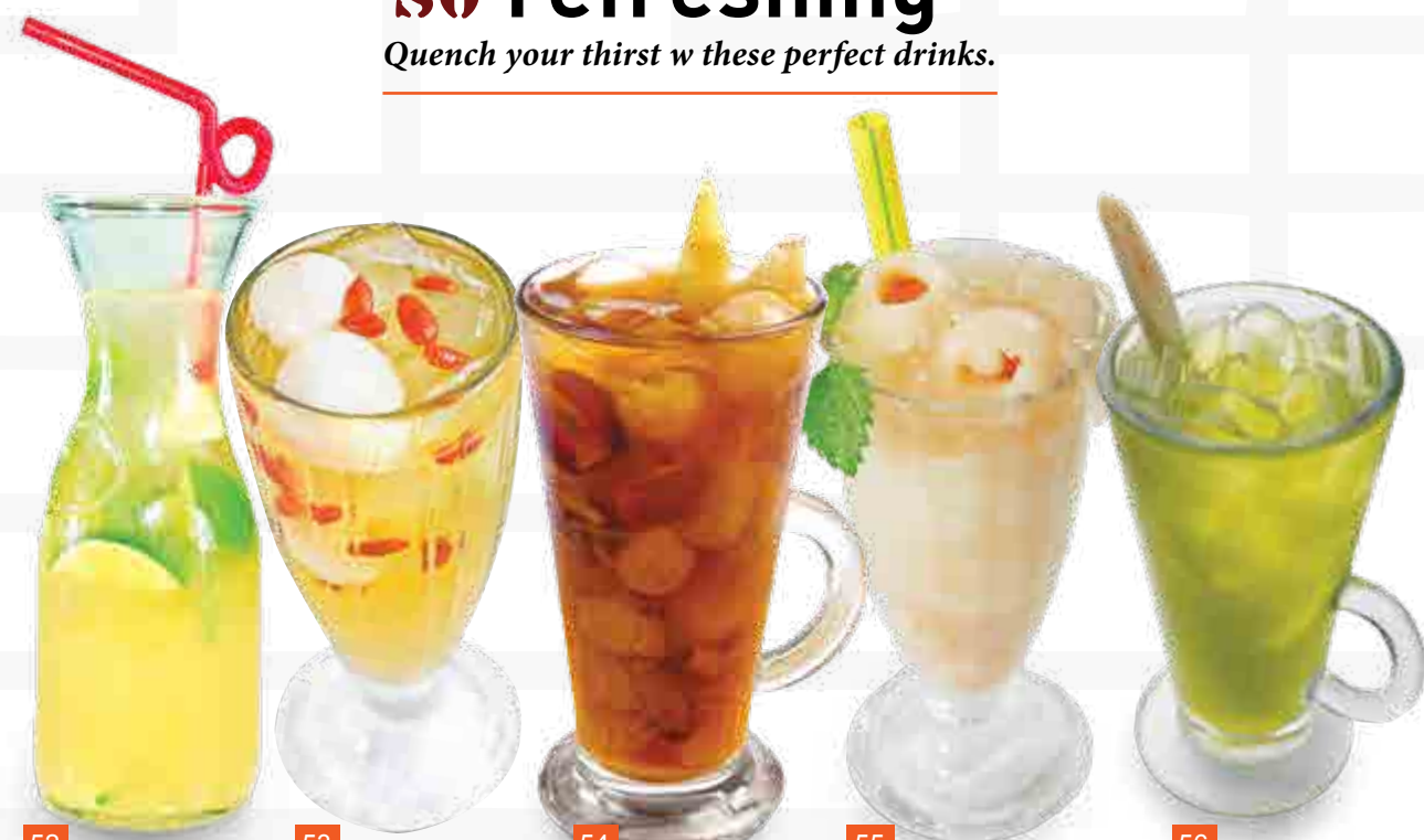
52 Iced Lime 4.5 Tea Cooler 53 Lychee Aloe 4.8 Vera Wolfberry Green Tea 54 Iced Longan ★ 5.5 w Red Dates & Ginger 55 Lychee Freeze 5.5 56 Iced Lemongrass ★ 3.5 Tea

Quench your thirst w these perfect drinks.