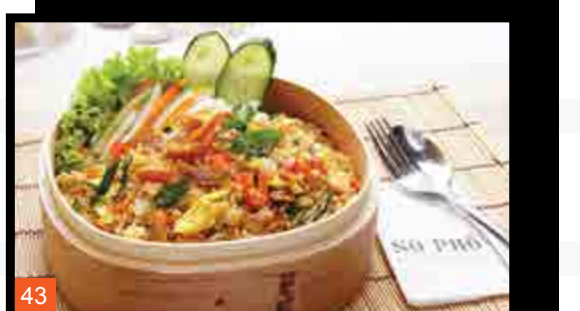
43 CƠM CHIÊN HẢI SẢN / BÒ ★ Basil Leaves Fried Rice w Vegetables 9.8 Salted Fish / Beef / Chicken 10.8

Traditionally in Vietnam, Imperial Fried Rice w lotus leaf which imparts a fresh fragrance to the taste.