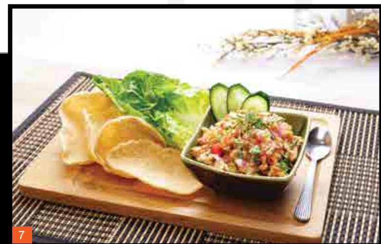
7 GÀ BĂM XÚC BÁNH ĐA TÔM ★ 10.8 Spicy & Sour Chicken Salad w Lettuce Cups & Crackers

Continue to be delighted w Vietnamese specialties, a taste of Vietnam.