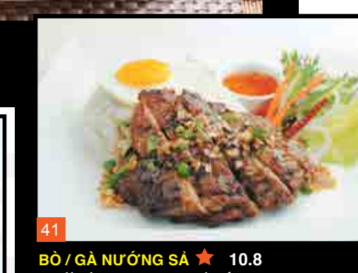
41 BÒ / GÀ NƯỚNG SA ★ 10.8 Grilled Lemongrass Chicken w Rice