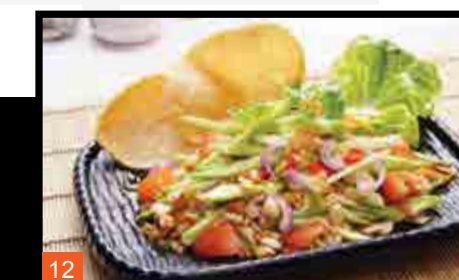
12 GỎI XOÀI ĐU ĐỦ ★ 8.8 Mango & Papaya Salad w Crispy Anchovies