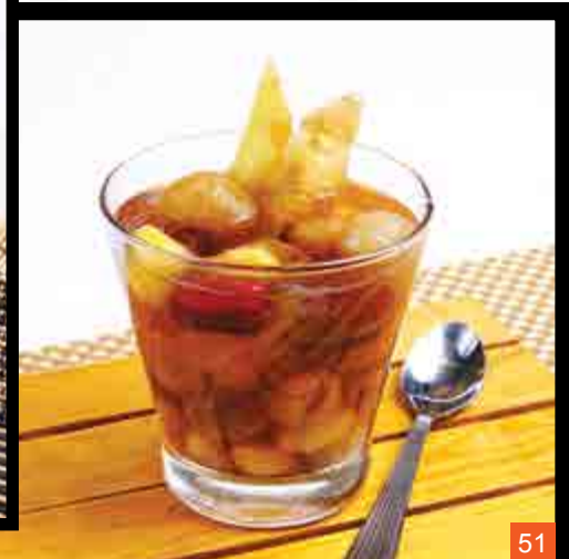
51 CHÈ NHÂN NHỤC BẠCH QUẢ TÁO ĐỎ NÓNG Hot Longan w Red Dates & Ginger