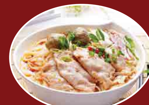
23 PHỞ BÒ CAY ★ 10.8 Pho Spicy Noodle Soup w Sliced Beef & Beef Balls w Sliced Beef 9.8