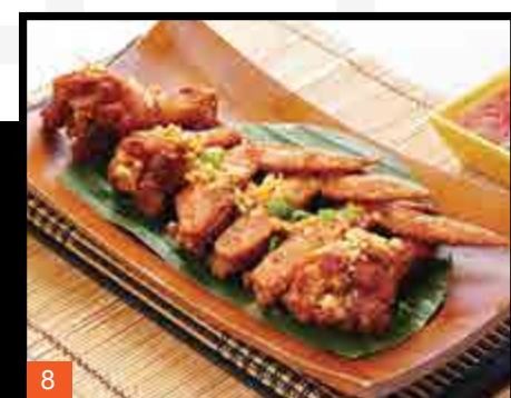
8 CÁNH GÀ CHIÊN SA ★ 10.5 Crispy Garlic Wings