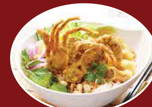
28 BÚN CHẢ GIÒ CUA LỘT ★ 13.5 Bun Noodle w Softshell Crab & Fried Spring Rolls