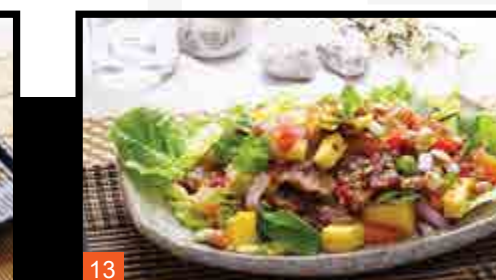
13 GỎI XOÀI TRỘN BÒ NƯỚNG ★ 10.8 Grilled Beef w Mango Salad 9.8 Vegetarian