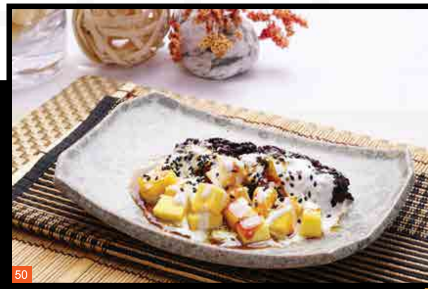
50 XÔI CHÈ VỚI XOÀI ★ 5.5 Mango w Black Glutinous Rice

End your meal w a sweet delicacy to relieve your tingling taste buds.