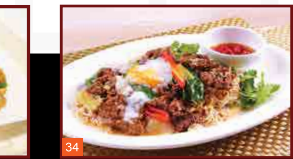
34 BÚN XÀO ★ Fried Vermicelli w Vegetables 10.8 Seafood / Beef / Chicken 11.8