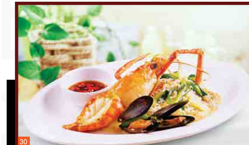
30 BÚN XÀO TÔM HÙM 14.8 ★ Vermicelli w Jumbo Prawn (seasonal)

Pamper the Noodle Lovers w a simple yet mouth-watering Vietnamese Fried Noodles.