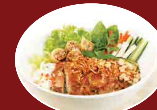
29 BÚN CHẢ GIÒ GÀ NƯỚNG ★ 10.8 Bun Noodle w Grilled Lemongrass Chicken 9.8 Vegetarian