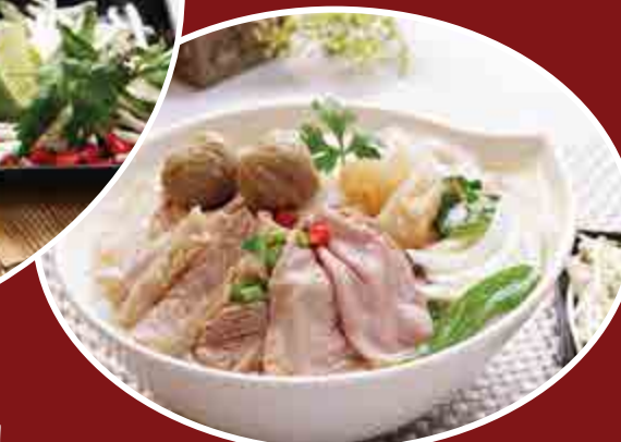
21 PHỞ THẬP CẨM ★ 12.5 Pho Sliced Beef w Tendon, Brisket & Beef Balls Noodle Soup