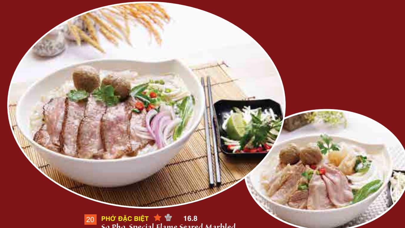
20 PHỞ ĐẶC BIỆT ★ 16.8 So Pho Special Flame Seared Marbled Sirloin Beef w Beef Balls Noodle Soup

Tasty & nutritious noodle soup cooked w cinnamon star anis, ginger & wonderful healing spices.