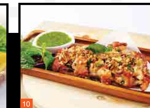
10 GÀ NƯỚNG SA 7.5 Lemongrass Chicken