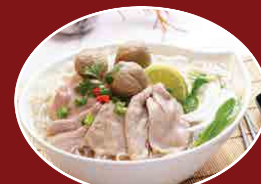
22 PHỞ TÁI BÒ VIÊN ★ 10.8 Pho Noodle Soup w Sliced Beef & Beef Balls w Sliced Beef 9.8