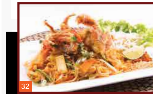
32 PHỞ XÀO CUA LỘT ★ Fried Pho Noodle w Softshell Crab 13.5