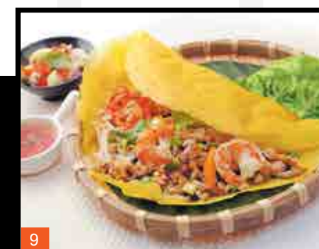
9 BÁNH XÈO ★ 11.5 Vietnamese Pancake w Minced Meat & Seafood