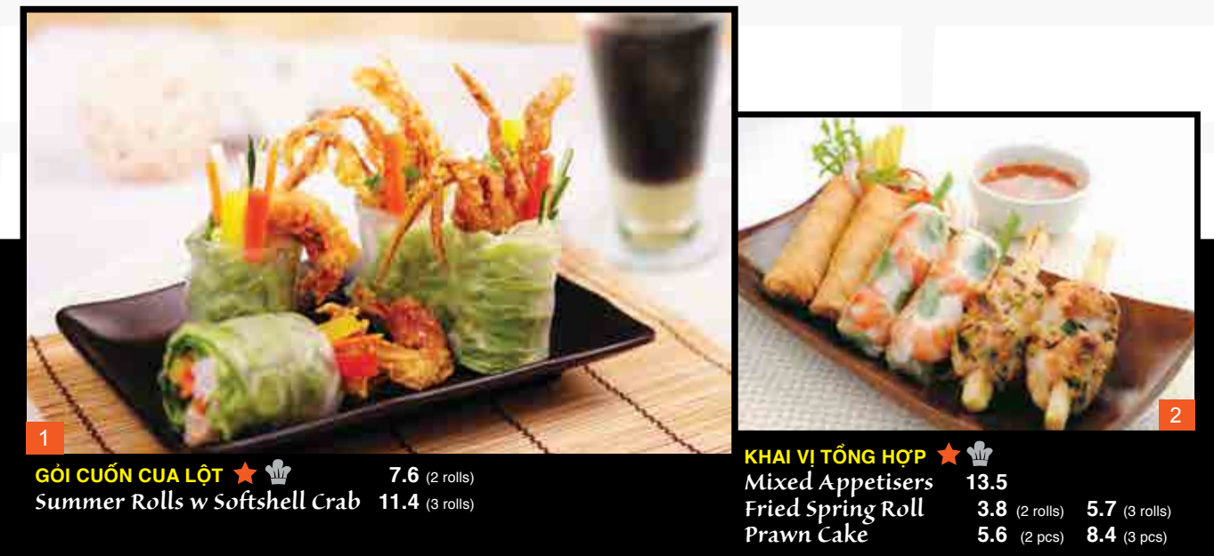
1 GỎI CUỐN CUA LỘT ★ 7.6 (2 rolls) Summer Rolls w Softshell Crab 11.4 (3 rolls)

Capture the essence of Vietnamese dining w a selection of delicious Vietnamese appetiser.