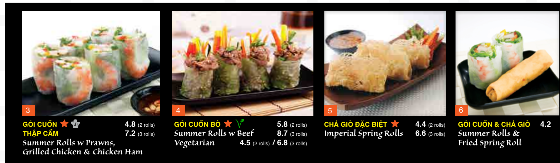
3 GỎI CUỐN THẬP CẨM ★ 4.8 (2 rolls) Summer Rolls w Prawns, Grilled Chicken & Chicken Ham 7.2 (3 rolls)