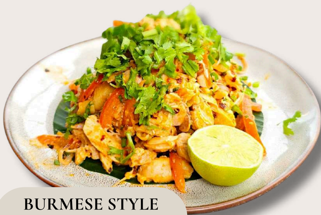
BURMESE STYLE CHICKEN SALAD