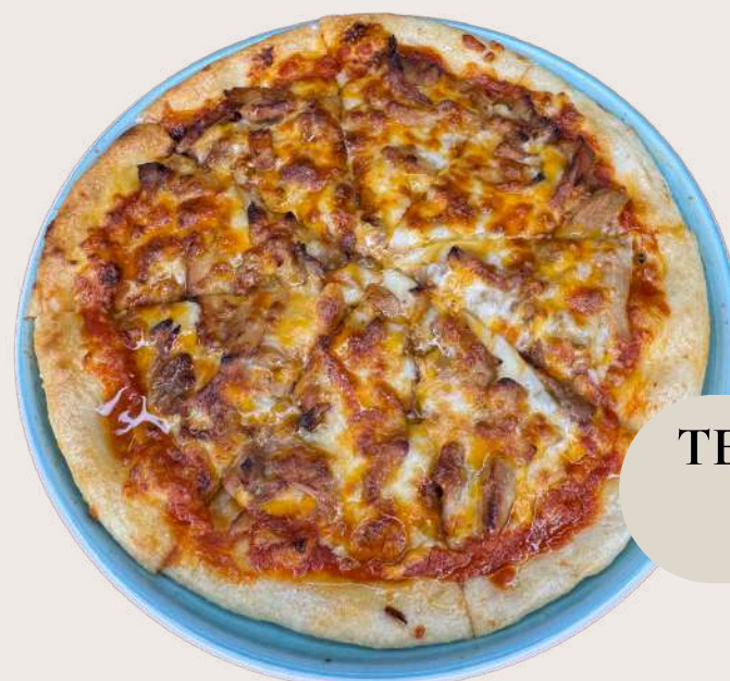
TERIYAKI CHICKEN PIZZA