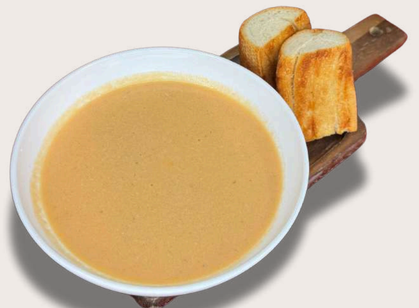
SALMON CHOWDER CREAM SOUP