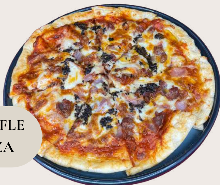
BACON AND TRUFFLE MUSHROOM PIZZA