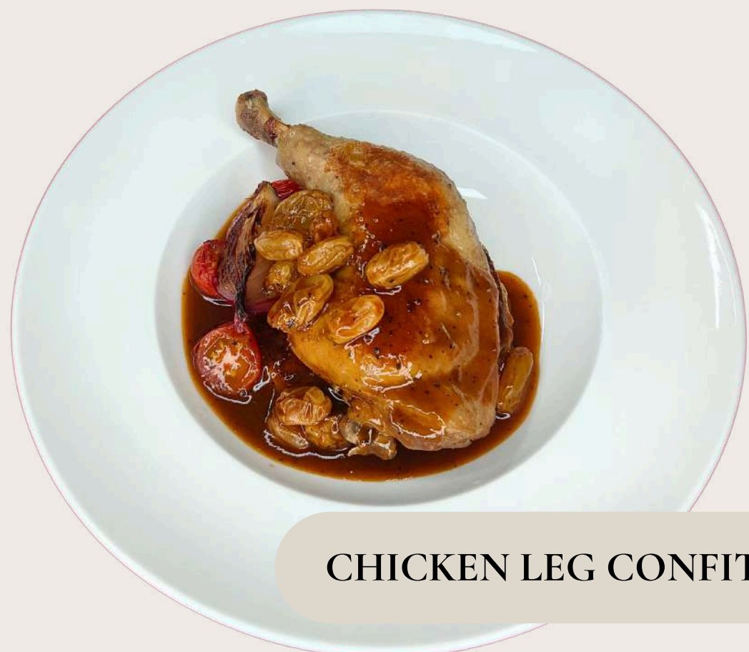
CHICKEN LEG CONFIT