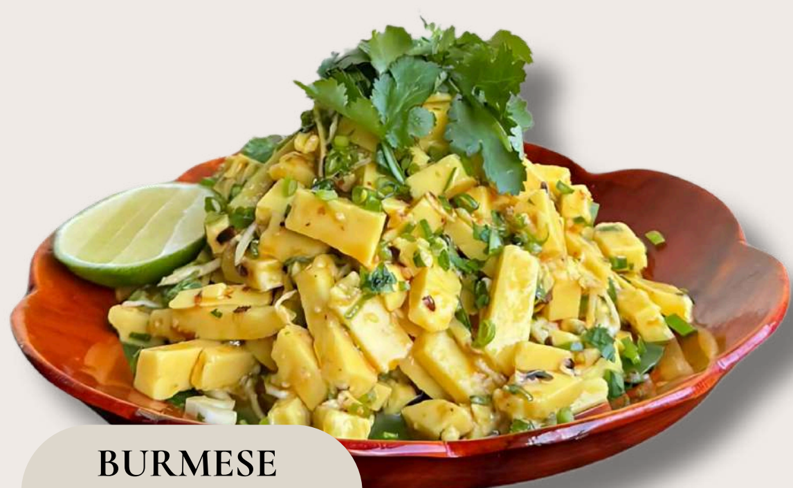
BURMESE TOFU SALAD