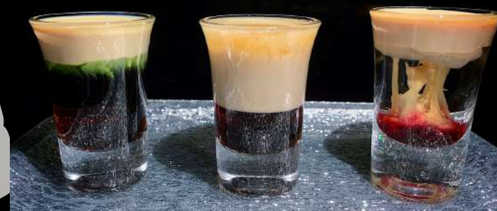
Quick F*ck B-52 Haemorrhage

$2 per can for soft drink mixers Fruit juice carafe $3